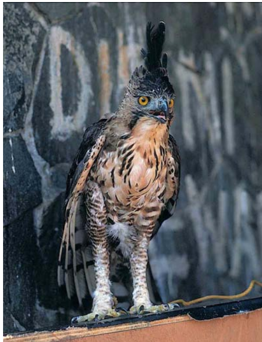
207 Javan Hawk-eagle / Javaanse Havikarend Spizaetus bartelsi , adult, Taman Safari Zoo, Cisarua, West Java, Indonesia, 10 December 1994 ( Bas van Balen ) 208-209 Javan Hawk-eagle / Javaanse Havikarend Spizaetus bartelsi , adult, bird market, Jakarta, Java, Indonesia, 5 July 1989 ( Arnoud B van den Berg )