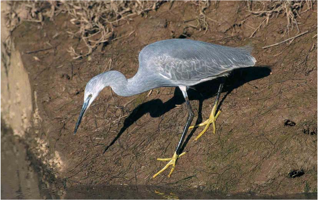
113 Grey-morph egret / grijze zilverreiger Egretta , Tavira, Algarve, Portugal, January 2001