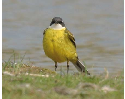
39-40 Witkeelkwikstaart / White-throated Wagtail Motacilla cinereocapilla , mannetje, Makkum, Friesland, 3 mei 2004

GEDRAG Langdurig verblijvend in en nabij kort gemaaid vochtig rietmoeras. Tekenen van territoriaal gedrag tonend, waarbij steeds op vaste delen van rietveld hoge rietstengels bezettend, waar vanaf met geregelde tussenpozen roepend. Tijdens gehele verblijf erg plaatstrouw. Interactie met andere kwikstaarten of baltsgedrag richting vrouwtje niet vastgesteld.