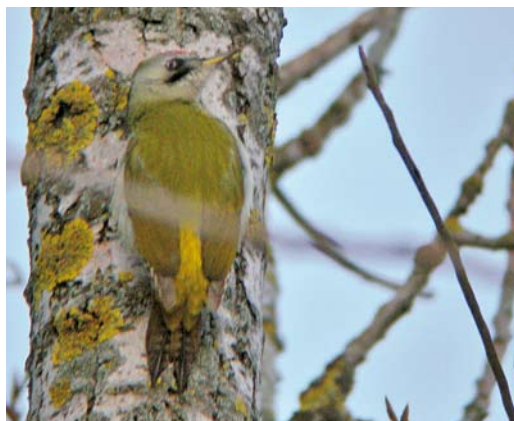
341-345 Hybrid Grey-headed x European Green Woodpecker / hybride Grijskopspecht x Groene Specht Picus canus x viridis , Lublin, Poland, 22 January 2010