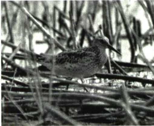
87 Great Knot / Grote Kanoet Calidris tenuirostris , Oostvaardersdijk, Flevoland, 21 September 1991 (Hans Gebuis)

1851, the second in November 1874, the third was a long-staying individual from November 1955 to March 1956 and the fourth in January-March 1965 (cf Eykman et al 1941, Voous 1957). (One collected in November 1913 could not be traced during review.) The pattern of records in central European countries shows that these birds originated from south-eastern rather than south-western Europe (Eigenhuis & Menkveld 1985). Some of the five birds recorded in 1985-91 might involve escapes. Apparently for the first time, a large number (24) was successfully raised in 1984 in captivity in the Netherlands at 't Zand, Noordholland, destined for re-introduction programmes elsewhere in Europe (Eigenhuis & Menkveld 1985). At least one bird staying with Ruddy Ducks O. jamaicensis at Abtskolk, Petten, Noordholland, in November-December 1987 is regarded as an escape from 't Zand (where Ruddy Duck is also bred) and was rejected (Blankert et al 1988, van der Burg et al 1988). The latter bird was possibly the same as the one at the same locality in January-March 1989 (cf van den Burg et al 1989).