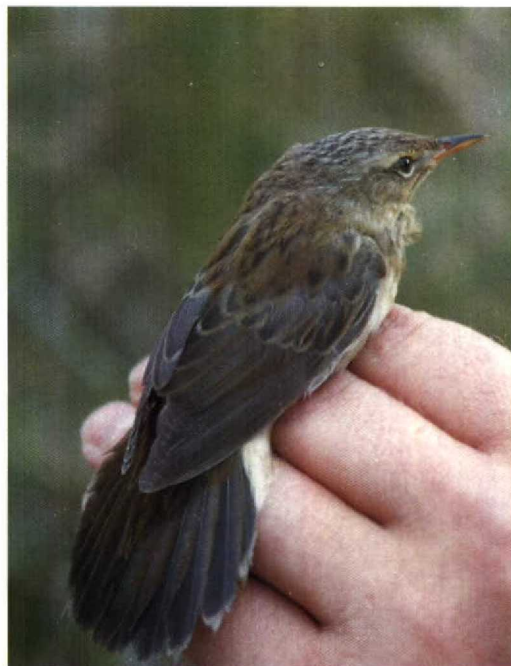
94 Pallas's Grasshopper Warbler / Siberische Snor Locustella certhiola , first-year, Castricum, Noordholland, 5 October 1991

FLEVOLAND Oostvaardersdijk, 5 June, trapped (C M Liebrechts-Haaker, H Liebrechts).