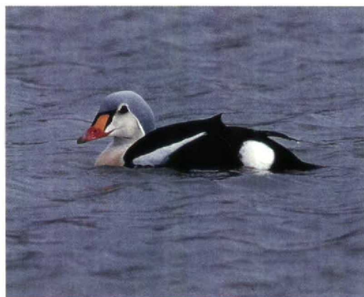
88 Pallid Harrier / Steppekiekendief Circus macrourus , third-year male, Vlissingen, Zeeland, 5 September 1991 89 Dusky Warbler / Bruine Boszanger Phylloscopus fuscatus , Friesland, 9 November 1990 90 Great Spotted Cuckoo / Kuiikoekoek Clamator glandarius , second-year, Lelystad, Flevoland, 4 April 1991 91 Black-eared Wheatear / Blonde Tapuit Oenanthe hispanica , female, Rottumeroog, Groningen, 6 June 1991 92 Lesser Yellowlegs / Kleine Geelpootruiter Tringa flavipes , adult winter, Flauwers Inlagen, Zeeland, 9 October 1991 93 King Eider / Koningseider Somateria spectabilis , Hoek van Holland, Zuidholland, 16 February 1991