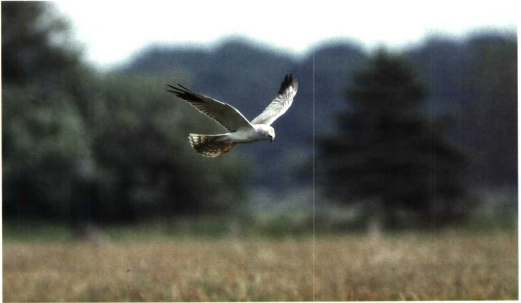
111 Pallid Harrier / Steppekiekendief Circus macrourus , male, Worpsswede, Niedersachsen, Germany, May 1993

(two), Saarijärvi and Orivesi. On 25 May, a River Warbler L. fluviatilis was trapped on Fair Isle, Shetland, and was last seen on 27 May. In Belgium, one was singing at Schulen, Limburg, on 30-31 May. In south-eastern Norway, three singing birds were found from 31 May to mid-June. The second Paddyfield Warbler Acrocephalus agricola for Hong Kong was seen at Nam Sang