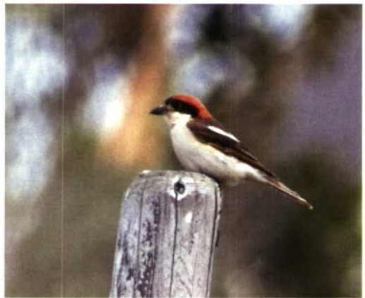
107 Pacific Swift / Siberische Gierzwaluw Apus pacificus , Cley, Norfolk, England, 30 May 1993 108 Oriental Pratincole / Oosterse Vorkstaartplevier Glaucopis trichoptera , Norfolk, England, May 1993 109 Ring-billed Gull / Ringsnavelmeeuw Larus delawarensis , Halmstad, Halland, Sweden, 29 May 1993 110 Balearic Woodchat Shrike / Balearische Roodkopklauwier Lanius senator badius , Voorhout, Zuidholland, 6 June 1993

adult Slender-billed Gulls L genei seen and photographed on 20 (one) and 21 May (two) in Rheindelta, Vorarlberg, constituted the second record for Austria. The first for Finland involved an adult staying at Pori from 23 May until at least 22 June. The fifth and the first twitchable Ring-billed Gull L delawarensis for Sweden concerned an adult present at Halmstad, Halland, from 21 May until at least mid-June. The first for Austria, an adult staying since 7 April in Rheindelta, Vorarlberg, was still present on 22 May. The Yellow-legged Gull L cachinnans staying for the fourth winter at Washington, DC, USA, was last reported on 26 March. The third Kittiwake Rissa tridactyla for Hong Kong was a first-winter bird at Mai Po on 3 April. In Ireland, a Gull-billed Tern Gelochelidon nilotica was seen at Ballycotton, Cork, on 28-29 April. On 3 May, the female Lesser Crested Tern Sterna bengalensis