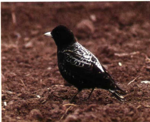
112 Black Lark / Zwarte Leeuwerik Melanocorypha yeltoniensis , male, Karlstad, Värmland, Sweden, May 1993

(two), Saarijärvi and Orivesi. On 25 May, a River Warbler L. fluviatilis was trapped on Fair Isle, Shetland, and was last seen on 27 May. In Belgium, one was singing at Schulen, Limburg, on 30-31 May. In south-eastern Norway, three singing birds were found from 31 May to mid-June. The second Paddyfield Warbler Acrocephalus agricola for Hong Kong was seen at Nam Sang