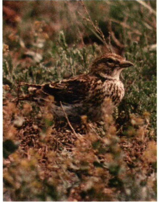
Mystery photograph 53. Solution in next issue.

even the primaries of L m hafizi show an obvious whitish fringe, it has paler whitish underparts and a distinctive pale supercilium. It also has longer wings (84-99 instead of 76-91 mm) and, especially, tail (74-90 instead of 58-76 mm). In fact, it is often easier to tell L m hafizi from L m megarhynchos than to identify Thrush Nightingale! For more information on the identification of Rufous