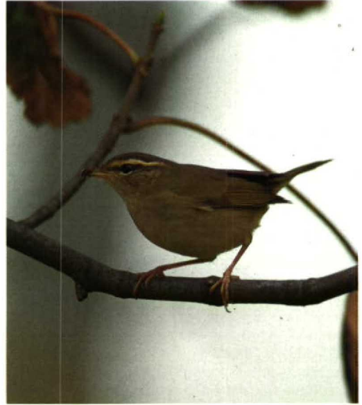
104-105 Raddes Boszanger / Radde's Warbler Phylloscopus schwarzi , Oosterend, Terschelling, Friesland, 10 oktober 1991 (Arie Ouwerkerk)

van Raddes Boszanger bekend waarvan dit de vijfde was: 9 oktober 1974, Texel, Noordholland (vangst) (Voous 1975); 8 oktober 1977, Castricum, Noordholland (vangst) (Slings 1979); 5 oktober 1981, Vlieland, Friesland (vangst) (van IJzendoorn 1981); 18 oktober 1981, Maasvlakte, Zuidholland (de Knijff & Schenk 1981); 10 oktober 1991, Terschelling; 12 oktober 1991, Meijndel, Zuidholland (vangst) (van den Berg et al 1993). Een geval op de Maasvlakte, Zuidholland, op 6-8 november 1990, dat aanvankelijk door de CDNA was aanvaard (van den Berg et al 1992), is alsnog afgewezen (van den Berg et al 1993). De foto's van deze vogel toonden bij nader inzien een Bruine Boszanger.