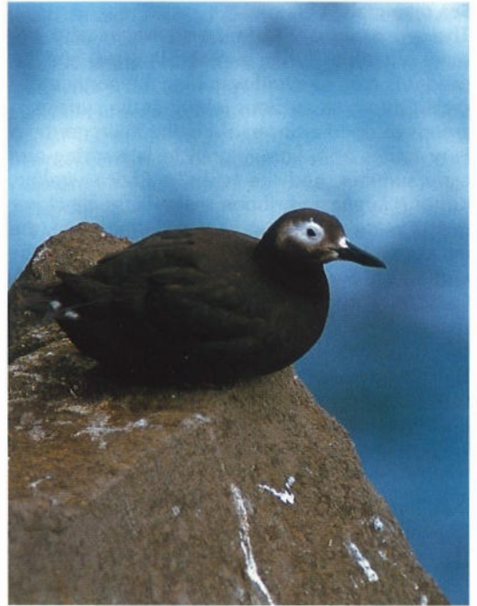
98 Short-tailed Albatross / Stellers Albatros Diomedea albatrus , off Torishima, Japan, March 1990 (Mark Brazil / Images of Japan) 99 Spectacled Guillemot / Brilzeekoet Cephus carbo , Teuri-jima Island, Hokkaido, Japan, June 1985 (Mark Brazil / Images of Japan) 100 Black-tailed Gulls / Sakhalinmeeuwen Larus crassirostris with Slaty-backed Gull / Kamtsjatkameeuw Larus schistisagus , Nemuro, Hokkaido, Japan, March 1984 (Mark Brazil / Images of Japan)