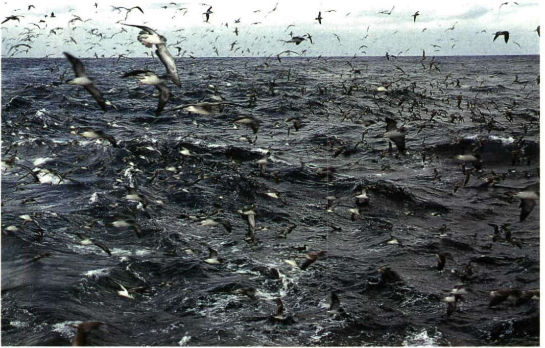
95 Streaked Shearwaters / Gestreepte Pijlstormvogels Calonectris leucomelas , off southern Izu Islands, Japan, March 1990 (Mark Brazil / Images of Japan) 96 Short-tailed Shearwater / Dunbekpijlstormvogel Puffinus tenuirostris , off ferry Tokyo-Kushiro, Japan, 28 May 1989 (Tom Kompier) 97 Laysan Albatross / Laysanalbatros Diomedea immutabilis , off ferry Tokyo-Kushiro, Japan, 28 May 1989 (Tom Kompier)