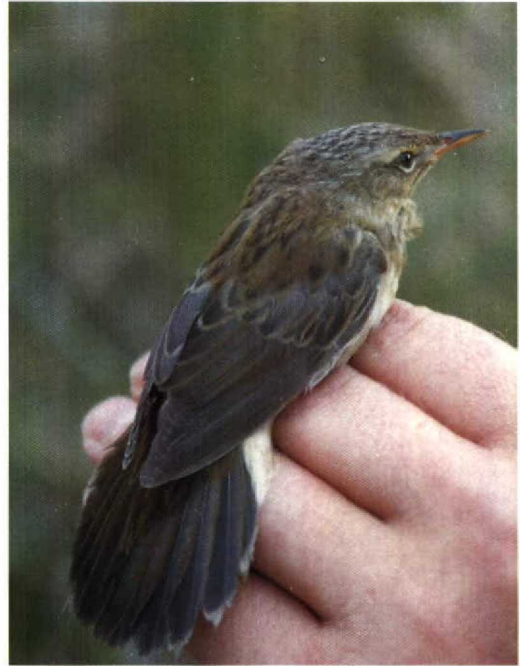
94 Pallas's Grasshopper Warbler / Siberische Snor Locustella certhiola , first-year, Castricum, Noordholland, 5 October 1991 (Henk-Jan Udding)

FLEVOLAND Oostvaardersdijk, 5 June, trapped (C M Liebrechts-Haaker, H Liebrechts).