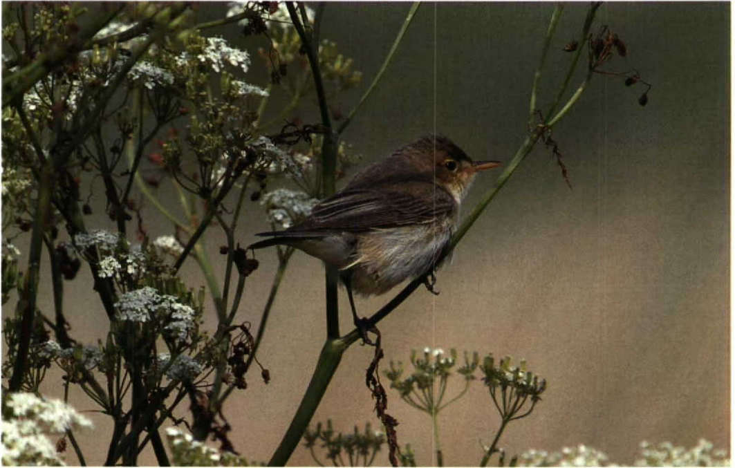
117 Orpheusspotvogel / Melodious Warbler Hippolais polyglotta , Rottumeroog, Groningen, 22 mei 1993 (Koen van Dijken) 118 Citroenkwikstaart / Citrine Wagtail Motacilla citreola , mannetje, Wilp, Gelderland, 5 mei 1993 (Arnaud B van den Berg) 119 Roodpootvalk / Red-footed Falcon Falco vespertinus , Sombrefte, Namen, 15 juni 1993 (Luc Verroken)