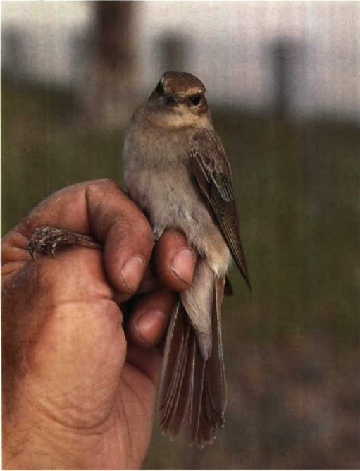
106 Rufous Nightingale / Nachtegaal Luscinia megarhynchos hafizi , Jubayl, North-Eastern Province, Saudi Arabia, 27 April 1991 (Arnoud B van den Berg)