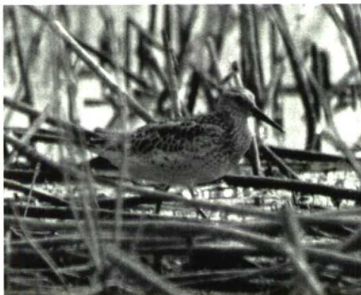
87 Great Knot / Grote Kanoet Calidris tenuirostris , Oostvaardersdijk, Flevoland, 21 September 1991 (Hans Gebuis)

1851, the second in November 1874, the third was a long-staying individual from November 1955 to March 1956 and the fourth in January-March 1965 (cf Eykman et al 1941, Voous 1957). (One collected in November 1913 could not be traced during review.) The pattern of records in central European countries shows that these birds originated from south-eastern rather than south-western Europe (Eigenhuis & Menkveld 1985). Some of the five birds recorded in 1985-91 might involve escapes. Apparently for the first time, a large number (24) was successfully raised in 1984 in captivity in the Netherlands at 't Zand, Noordholland, destined for re-introduction programmes elsewhere in Europe (Eigenhuis & Menkveld 1985). At least one bird staying with Ruddy Ducks O. jamaicensis at Abtskolk, Petten, Noordholland, in November-December 1987 is regarded as an escape from 't Zand (where Ruddy Duck is also bred) and was rejected (Blankert et al 1988, van der Burg et al 1988). The latter bird was possibly the same as the one at the same locality in January-March 1989 (cf van den Burg et al 1989).