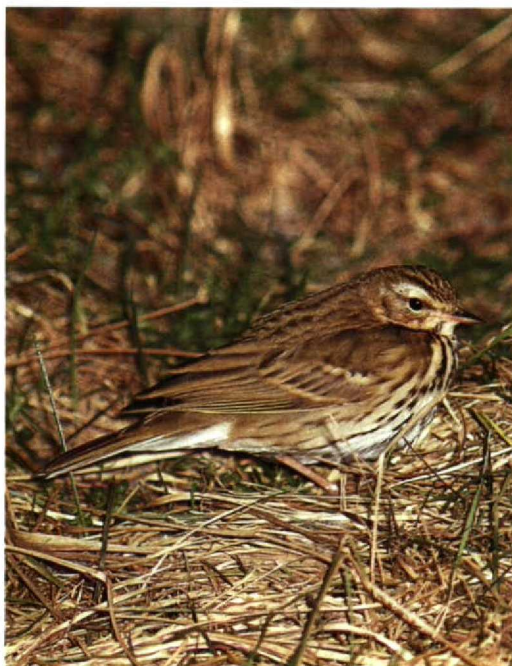
101-102 Siberische Boompieper / Olive-backed Pipit Anthus hodgsoni , Noordwijk, Zuidholland, 6 februari 1991 (Arnoud B van den Berg)

De Siberische Boompieper is een dwaalgast uit Siberië en is in de meeste Westeuropese landen vastgesteld, voornamelijk in het najaar (cf Lewington et al 1991). Het najaar van 1990 bracht een bijzonder groot aantal Siberische Boompiepers naar Westeuropa. Op de Britse Eilanden werden gedurende eind september en oktober tenminste 46 gevallen bekend. Dit betekende in één najaar meer dan de helft van het totaal in Groot-Brittannië en Ierland vastgestelde aantal Siberische Boompiepers tot 1990 (Rogers & Rarities Committee 1991-92). In Nederland werd in het najaar van 1990 slechts één geval bekend: een vangst in de Kennemerduinen te Bloemendaal, Noordholland, op 25 oktober; deze vogel bleef in het gebied aanwezig tot 29 oktober (Eggenhuizen & de Meijer 1991).