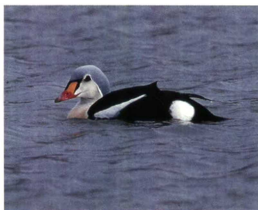
88 Pallid Harrier / Steppekiekendief Circus macrourus , third-year male, Vlissingen, Zeeland, 5 September 1991 89 Dusky Warbler / Bruine Boszanger Phylloscopus fuscatus , Friesland, 9 November 1990 90 Great Spotted Cuckoo / Kuiikoekoek Clamator glandarius , second-year, Lelystad, Flevoland, 4 April 1991 91 Black-eared Wheatear / Blonde Tapuit Oenanthe hispanica , female, Rottumeroog, Groningen, 6 June 1991 92 Lesser Yellowlegs / Kleine Geelpootruiter Tringa flavipes , adult winter, Flauwers Inlagen, Zeeland, 9 October 1991 93 King Eider / Koningseider Somateria spectabilis , Hoek van Holland, Zuidholland, 16 February 1991