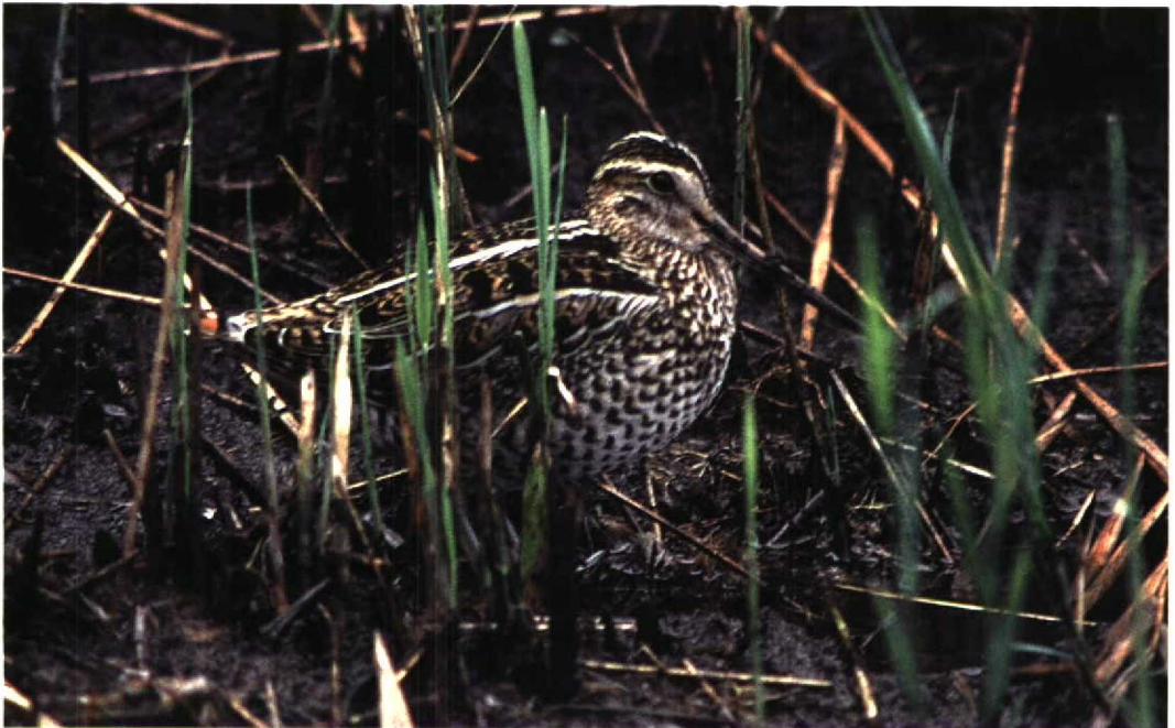
115 Great Snipe / Poelsnip Gallinago media , juvenile, West aan Zee, Terschelling, Friesland, 27 August 1996 (Hans Gebuis)