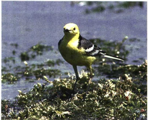
117 Citrine Wagtail / Citroenkwikstaart Motacilla citreola , male, Berkheide, Zuid-Holland, 7 June 1996

Western Black-eared Wheatear Oenanthe hispanica 3,1,1 2-4 June, Aagtekerke, Mariekerke , Zeeland, first-summer male, photographed, videoed (M Klootwijk, S Lilipaly et al; Klootwijk & Kuypers 1996; Birding World 9: 215, 1996; Dutch Birding 18: 140, plate 149, 154, plate 168, 1996).