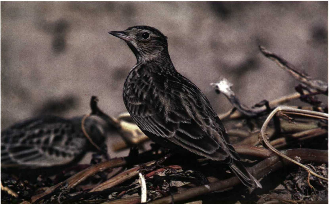
136 Oriental Lark / Kleine Veldleeuwerik Alauda gulgula , Eilat, Israel, 29 November 1992

The striking bill-shape of the mystery bird also does not fit many other lark species (including all members of the genera Calandrella and Melanocorypha ), because these species have shorter, thicker and less pointed bills. Bills more similar to that of the mystery bird are found in Crested Lark Galerida cristata (less so in Thekla Lark G theklae ), Wood Lark Lullula arborea , Sky Lark A arvensis and Oriental Lark A gulgula (also known as Small Skylark). Crested can be excluded as this species should show a distinct crest (which may seem absent occasionally), a darker