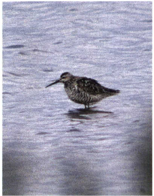
150 Steppekievit / Sociable Lapwing Vanellus gregarius , adult, Spaarndam, Noord-Holland, 25 juni 1998 ( Arnoud B van den Berg ) 151 Stelstrandloper / Stilt Sandpiper Micropalama himantopus , adult, Blauwe Kamer, Utrecht, 24 juli 1998 ( Arnoud B van den Berg ) 152 Huis kraai / House Crow Corvus splendens , adult, Kollumerland, Lauwersmeer, Friesland, 15 augustus 1998 ( Leo J R Boon/Cursorius )