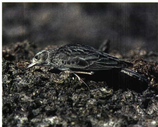
137 Oriental Lark / Kleine Veldleeuwerik Alauda gulgula , Eilat, Israel, 2 April 1993