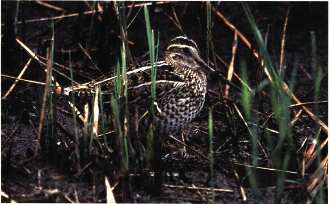
115 Great Snipe / Poelsnip Gallinago media , juvenile, West aan Zee, Terschelling, Friesland, 27 August 1996 (Hans Gebuis)