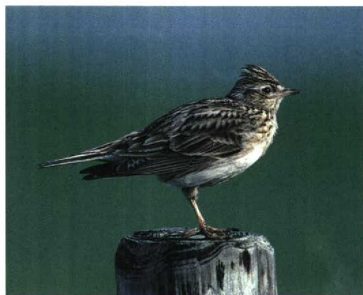
138 Sky Lark / Veldleeuwerik Alauda arvensis , Grevelingendam, Zuid-Holland, Netherlands, April 1993

area on the lores, some dark malar striping and often a dark half-ring below the eye, which are all lacking in the mystery bird; Wood can be excluded because this species should show a different, more striking head-pattern with a longer supercilium. Therefore, the mystery bird must be either a Sky Lark or an Oriental Lark.