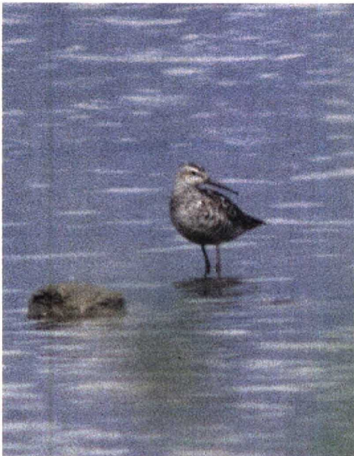
157 Steltstrandloper / Stilt Sandpiper Micropalama himantopus , adult, Blauwe Kamer, Utrecht, 24 juli 1998

Twee Siberische Strandlopers in Ezumakeeg Na de acht uur voor de baas in Leeuwarden voltooid te hebben besloot ik op donderdag 6 augustus de dag af te sluiten in de Ezumakeeg, aan de westkant van het Lauwersmeergebied nabij Ezumazijl, Friesland. Dit begin dit jaar ingerichte natuurgebied heeft in haar prille bestaan al het nodige aan zeldzame vogels opgeleverd. Zo zijn er al een Amerikaanse Smient Mareca americana , een Bronskopeend M. falcata , vier Steltkluten Himantopus himantopus , twee Gestreepte Strandlopers Calidris melanotos , een Grote Grijs Snip Limnodromus scolopaceus , vijf Poelruiters Tringa stagnatilis en drie Witwangsters Chlidonias hybridus waargenomen.