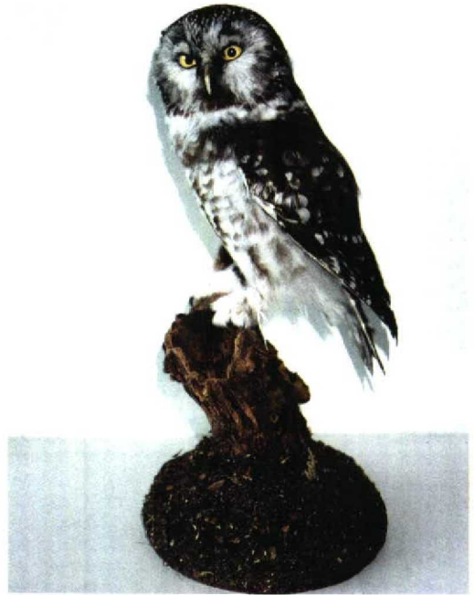
107 Short-toed Eagle / Slangenarend Circaetus gallicus , Hoge Veluwe, Gelderland, 5 August 1996 108 Tengmalm's Owl / Ruigpootuil Aegolius funereus (found dead at Zwolle, Overijssel, c 14 October 1996), Zwolle, Overijssel 109 Greater Sand Plover / Woestijnplevier Charadrius leschenaultii , first-summer female, De Cocksdorp, Texel, Noord-Holland, 1 August 1996