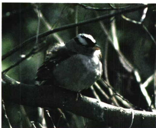
130 White-crowned Sparrow / Witkruingors Zonotrichia leucophrys leucophrys , adult, Spaarndam, Noord-Holland, January 1982 (Jan Kleiberg)