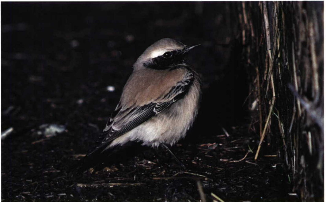
119 Desert Wheatear / Woestijntapuit Oenanthe deserti , first-winter male, Westernieland, Groningen, 23 December 1996