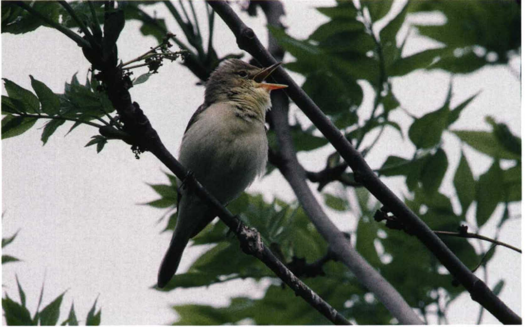
125 Melodious Warbler / Orpheusspotvogel Hippolais polyglotta , Wijlre, Limburg, 30 May 1996 126 Blyth's Reed Warbler / Struikrietzanger Acrocephalus dumetorum , Walem, Limburg, 24 June 1996 127 Arctic Redpoll / Witsluitbarmsijs Carduelis hornemanni , Groningen, Groningen, 6 February 1996