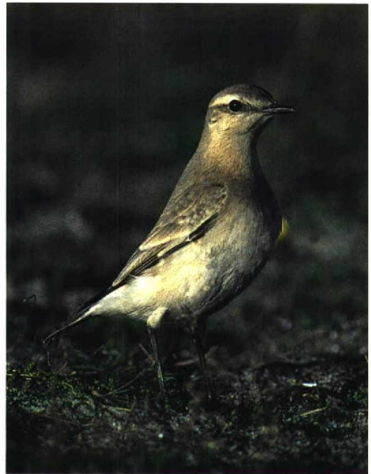
122 Desert Wheatear / Woestijntapuit Oenanthe deserti , first-winter male, Westernieland, Groningen, December 1996 (Rudy Offereins) 123 Isabelline Wheatear / Izabeltapuit Oenanthe isabellina , Maasvlakte, Zuid-Holland, 23 October 1996 (René Pop) 124 Booted Warbler / Kleine Spotvogel Acrocephalus caligatus , Katwijk aan Zee, Zuid-Holland, 10 September 1996 (Hans Gebuis)