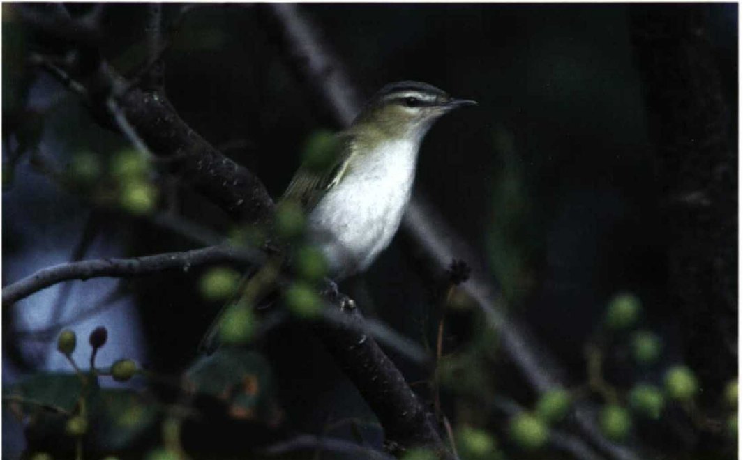
129 Red-eyed Vireo / Roodoogvireo Vireo olivaceus , Lange Paal, Vlieland, Friesland, 6 October 1996 (Hans Gebuis)