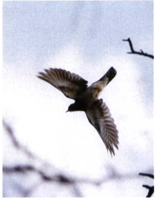
145 Oriental Cuckoo / Boskoekoek Cuculus saturator , Lieksa, Finland, 27 June 1998 (Juha Poutanen) 146 Oriental Cuckoo / Boskoekoek Cuculus saturator , Lieksa, Finland, 27 June 1998 (Kimmo Nevalainen) 147 Great Black-headed Gull / Reuzenzwartkopmeeuw Larus ichthyaetus , first-year, Altwarmbüchener See, Hannover, Germany, 5 September 1998 (Detlef Gruber)