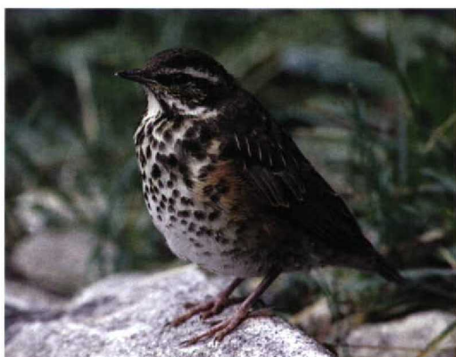
139 Sharp-tailed Sandpiper / Siberische Strandloper Calidris acuminata , adult, Ezumakeeg, Lauwersmeer, Friesland, Netherlands, 9 August 1998 140 Baird's Sandpiper / Bairds Strandloper Calidris bairdii , adult, and Dunlin / Bonte Strandloper C alpina , Lound Gravel Pits, Nottinghamshire, England, August 1998 141 Red-necked Stint / Roodkeelstrandloper Calidris ruticollis , adult, Ballycotton, Cork, Ireland, July 1998 142 Blue-cheeked Bee-eater / Groene Bijeneter Merops persicus , Husby Sø, Vestjylland, Denmark, 6 July 1998 143 Turkestan Shrike / Turkestaanse Klauwier Lanius phoenicuroides , Anglesey, Wales, July 1998 144 Redwing / Koperwiek Turdus iliacus , juvenile, Nuuk, Greenland, 15 August 1998