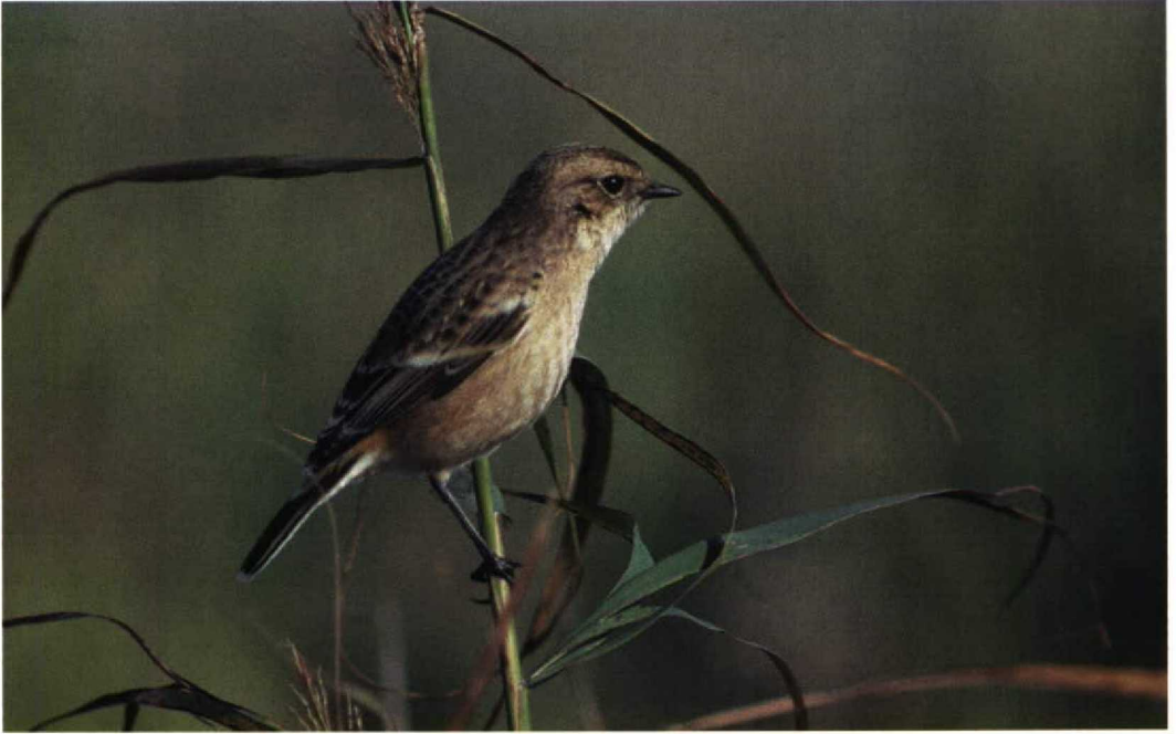
118 Siberian Stonechat / Aziatische Roodborsttapuit Saxicola maura , first-winter male, Den Helder, Noord-Holland, 12 October 1996