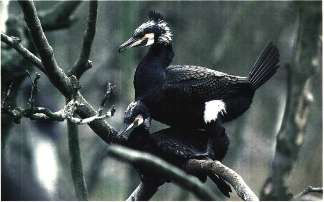
133 Continental Great Cormorants / Aalscholvers Phalacrocorax carbo sinensis , Naardermeer, Noord-Holland, Netherlands, 12 April 1986 (René Pop)