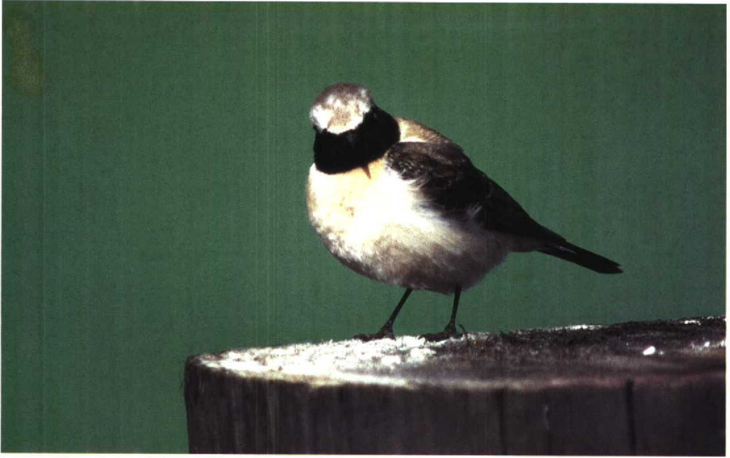
120 Western Black-eared Wheater / Westelijke Blonde Tapuit Oenanthe hispanica , first-summer male, Aagtekerke, Zeeland, 4 June 1996