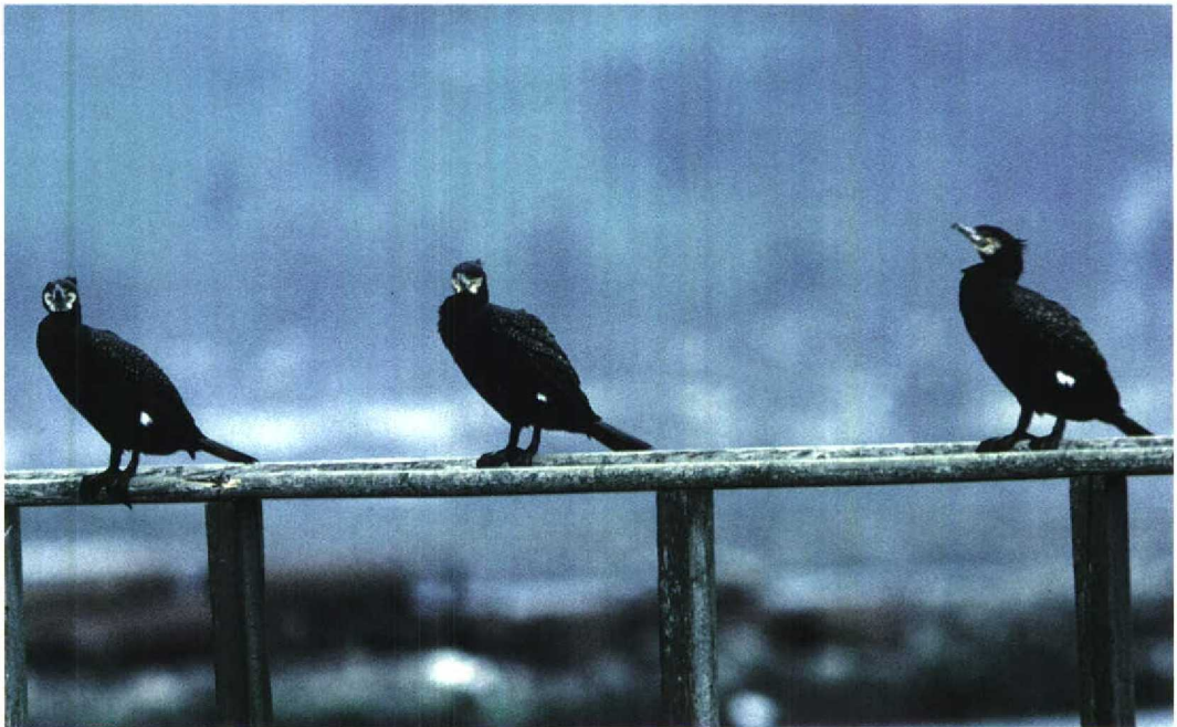
134 Atlantic Great Cormorants / Grote Aalscholvers Phalacrocorax carbo carbo , Belfast Lough, Northern Ireland, 20 March 1993