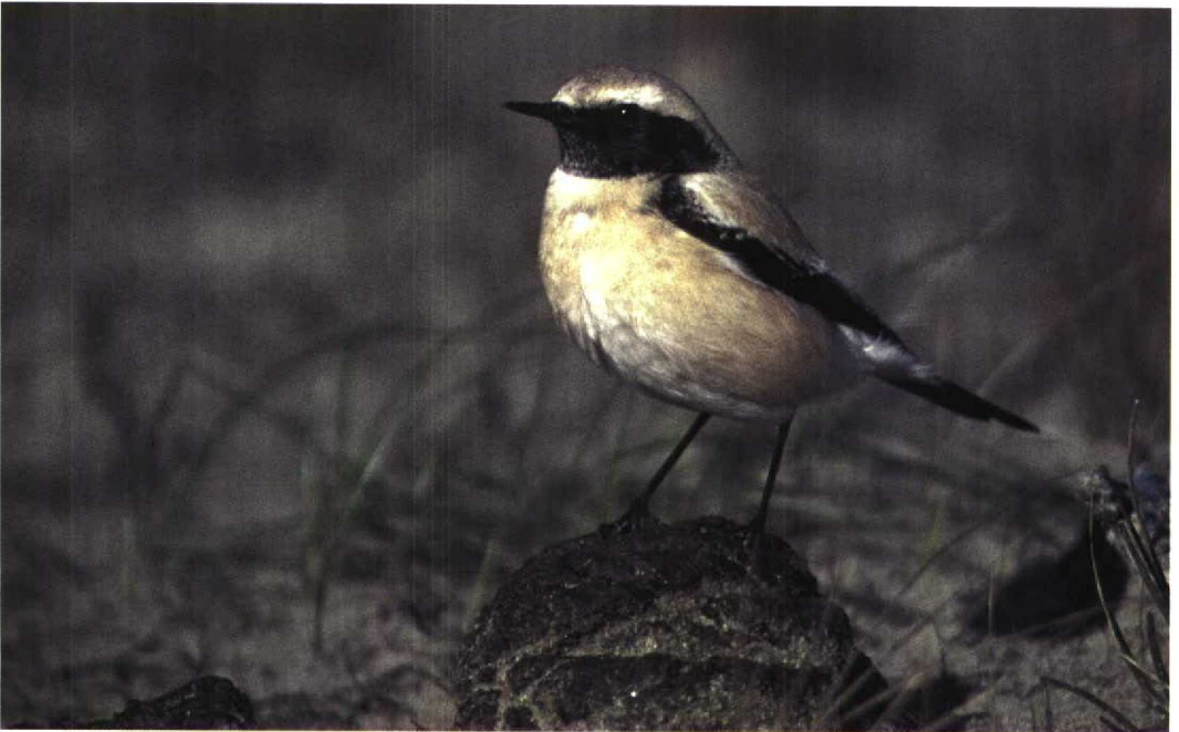
121 Desert Wheatear / Woestijntapuit Oenanthe deserti , adult male, Den Helder, Noord-Holland, 8 November 1996 (Diederik Kok)