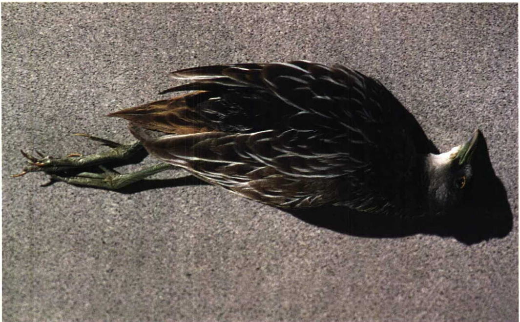
132 Striped Crake / Afrikaans Porseleinhoen Porzana marginalis (found at Livorno, Toscana, Italy, 4 January 1997), Istituto Nazionale Fauna Selvatica, Ozzano Emilia, Italy, March 1997 (Nicola Baccetti)

We are most grateful to Fernando Forzi for having attempted to rescue the Striped Crake and for the details which he provided. Information on shipping movements was kindly supplied by Massimo Moniga (harbour authority, Avvisatore