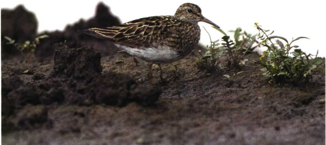
149 Gestreepte Strandloper / Pectoral Sandpiper Calidris melanotos , adult, Neer, Limburg, 4 augustus 1998