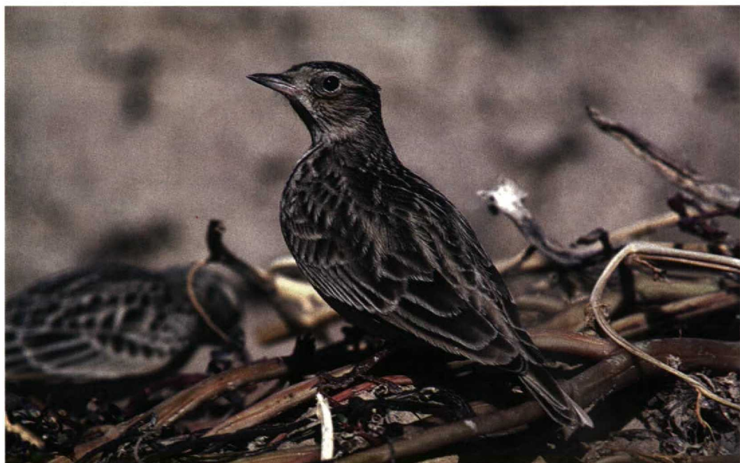
136 Oriental Lark / Kleine Veldleeuwerik Alauda gulgula , Eilat, Israel, 29 November 1992

The striking bill-shape of the mystery bird also does not fit many other lark species (including all members of the genera Calandrella and Melanocorypha ), because these species have shorter, thicker and less pointed bills. Bills more similar to that of the mystery bird are found in Crested Lark Galerida cristata (less so in Thekla Lark G theklae ), Wood Lark Lullula arborea , Sky Lark A arvensis and Oriental Lark A gulgula (also known as Small Skylark). Crested can be excluded as this species should show a distinct crest (which may seem absent occasionally), a darker