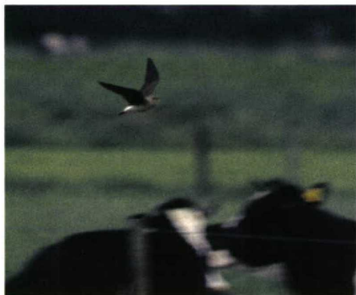
153 Steppevorkstaartplevier / Black-winged Pratincole Glareola nordmanni , Hooze Zwaluwe, Noord-Brabant, 1 juli 1998