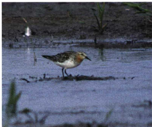
154 Roodkeelstrandloper / Red-necked Stint Calidris ruficollis , adult, Oud-Beijerland, Zuid-Holland, 4 juli 1998 (Hans Gebuis)

Polder Noorder-M, beide bij Petten, en op 31 juli 12 op een bloembollenveld bij 't Zand, Noord-Holland. Er werden 14 Reuzensterns Sterna caspia doorgegeven, voornamelijk vanaf eind juni. Er waren twee meldingen van Dougalls Sterns S. dougallii ; op 16 juni langs Camperduin en op 29 juni in de 's-Gravenhoekinlaag, Zeeland. Twee Witwangsterns Chlidonias hybridus bleven tot 4 juni in de Ezumakeeg. Andere vlogen op 5 juni (één) en 9 juni (twee) bij Stellendam, Zuid-Holland, en op 27 juli bij de Ventjagersplaten, Zuid-Holland. Vanaf 28 juni werden weer Witvleugelsterns C. leucopterus gezien bij Den Oever en op 31 juli drie bij de Houtribsluizen, Flevoland.