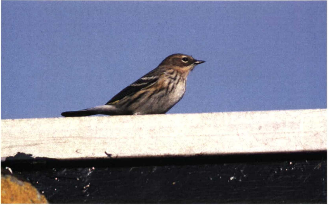
128 Myrtle Warbler / Mirtezanger Dendroica coronata , male, Oost-Vlieland, Vlieland, Friesland, 13 October 1996