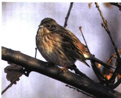
131 Pine Bunting / Witkopgors Emberiza leucocephalos , female, Katwijk, Zuid-Holland, November 1996 (Marc Guyt)