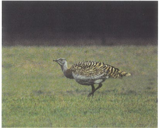
110 Collared Pratincole / Vorkstaartplevier Glareola pratincola , Lepelaarsplassen, Flevoland, 1 June 1996 (Marc Guyt) 111 White-rumped Sandpiper / Bonapartes Strandloper Calidris fuscicollis , adult, Wagejot, Texel, Noord-Holland, 13 August 1996 (Ruud E Brouwer) 112 Pectoral Sandpiper / Gestreepte Strandloper Calidris melanotos , juvenile, Julianadorp, Noord-Holland, 28 September 1996 (Arnoud B van den Berg) 113 Great Bustard / Grote Trap Otis tarda , Rolde, Drenthe, January 1996 (Patrick Palmen)

Baillon's Crane Porzana pusilla -,17,1 21-23 June, Singraven, Denekamp, Gelderland, singing, sound-recorded (O de Bruijn, P Knolle, C Derks). 1995 11 May to 13 June, Kleimeer, Langedijk, Noord-Holland, singing, sound-recorded (M Platteeuw, R E Brouwer, F Vogelzang); 3 to at least 7 July, Oude Waal, Nijmegen, Gelderland, male, sound-recorded (O van Hoorn, E A W Ernens). 1994 20-25 May, De Hamert, Bergen, Limburg, male, sound-recorded (H Alards).