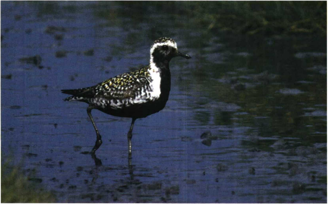
148 Aziatische Goudplevier / Pacific Golden Plover Pluvialis fulva , De Putten, Schoorl, Noord-Holland, 23 juli 1998