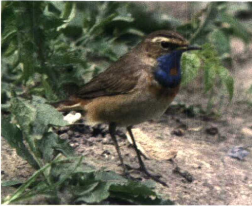
116 Red-spotted Bluethroat / Roodsterblauwborst Luscinia svecica svecica , Uithuizermeeden, Groningen, 22 May 1996