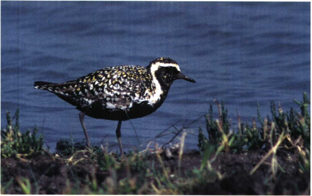
114 Pacific Golden Plover / Aziatische Goudplevier Pluvialis fulva , De Putten, Schoorl, Noord-Holland, 26 July 1996