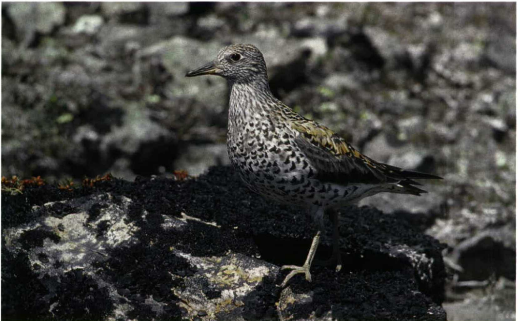
192 Surfbird / Brandingloper Aphriza virgata, Turquoise Lake, Alaska, USA, 26 May 1997