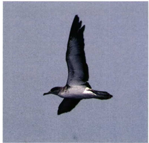
184-185 Cape Verde Shearwater / Kaauperdiche Pijlstormvogel Calonectris edwardsii , off Senegal, October 1996

the northern winter in Argentine and Brazilian waters (eg, Mougin et al 1988, Cantos & Gómez-Manzanique 1996). Then, during the northern spring, they head north to Central and North American waters where they stay during the summer. Immature borealis return to their South American wintering grounds either via Central America or via Europe (Mougin et al 1988, Paterson 1997). Immature diomedea spend the northern winter in southern African waters. Then they return to the Mediterranean Sea and European Atlantic waters to spend the summer (Mougin et al 1988). The migration patterns of adult borealis and diomedea are less complicated. They migrate directly to and back from their South American and southern African wintering waters, respectively (Mougin et al 1988). Some diomedea overwinter in the Mediterranean Sea (Paterson 1997) and off the Atlantic coast of Morocco (Thibault et al 1997). Interestingly, diomedea has been recorded off New England, USA, and borealis off South Africa (Cramp & Simmons 1977). Vagrant borealis (and/or diomedea ) are regular in the Indian Ocean (Thibault et al 1997) and have been recorded as far as New Zealand (Tunncliffe 1982).