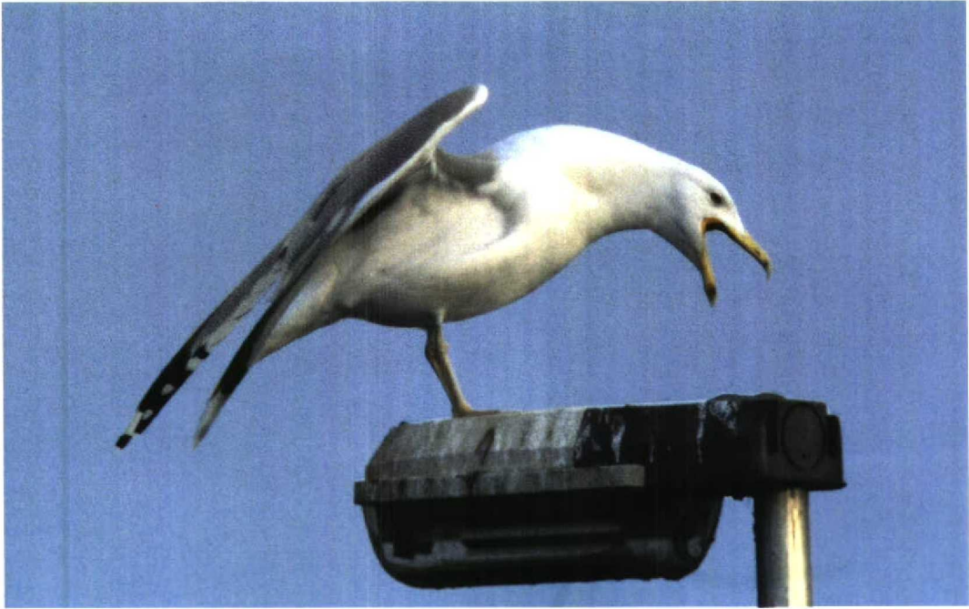
21 Pontische Meeuw / Pontic Gull Larus cachinnans cachinnans , adult, Huizen, Noord-Holland, januari 1998 (Jan Mulder)

ari bij Hollum op Ameland, Friesland. Het heeft er alle schijn van dat dit dezelfde vogel was die op 17-22 mei 1997 bij het Naardermeer, Noord-Holland, verbleef en daarna tot 10 januari (!) in Kent, Engeland. Er was een melding van een Regenwulp Numenius phaeopus op 27 januari bij Zoetermeer, Zuid-Holland. Rosse Franjepoten Phalaropus fulicaria pleisterden van 28 december tot 3 januari bij de Brouwersdam en op 1 januari bij Scharendijke, en op 24 januari vlogen er twee langs Scheveningen. De zevende Ringsnavelmeeuw Larus delawarensis voor Nederland, een adult winter, verbleef vanaf 18 januari in de omgeving van Goes. Nu vogelaars blijkbaar precies weten hoe ze eruit zien worden er veel adulte Pontische Meeuwen L. cachinnans cachinnans waargenomen, in totaal ruim 25, waaronder minimaal vier in december te Arcen, Limburg, maximaal acht in december en januari te Oost-Maarland en Itteren, Limburg, en ten minste drie te Huizen, Noord-Holland. Er werden c. 15 Geelpootmeeuwen L. michahellis gemeld, zowel in het binnenland als aan de kust. Een Kleine Burgemeester L. glaucoides verbleef op 14 en 15 december te Arcen. Langsvliegende exemplaren werden opgemerkt op 26 december te Scheveningen en op 31 december te Huisduinen, Noord-Holland. Grote Burgemeesters L. hyperboreus waren er ook, en wel op 28 december op Terschelling, op 31 december bij De Putten bij Camperduin en langsvliegend bij Scheveningen, op 10