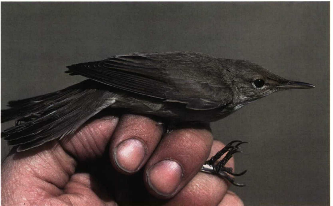
8 Caspian Reed Warbler / Kaspische Karekiet Acrocephalus fuscus , Jubail, Saudi Arabia, 16 April 1991