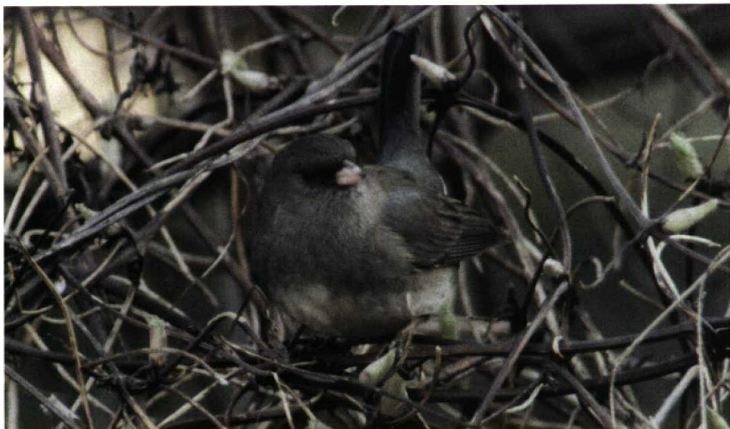
20 Dark-eyed Junco / Grijze Junco Junco hyemalis , Chester, Cheshire, England, January 1998 (Iain H Leach)

Siracusa, south-eastern Sicily, on 21-30 December. In Israel, one Olive-backed Pipit A hodgsoni , three Buff-bellied Pipits A rubescens and two Citrine Wagtails Motacilla citreola were seen in December-January near Eilat. A Blue-headed Wagtail M flava at Læsø, Nordjylland, during the third week of January constituted the first winter record for Denmark.