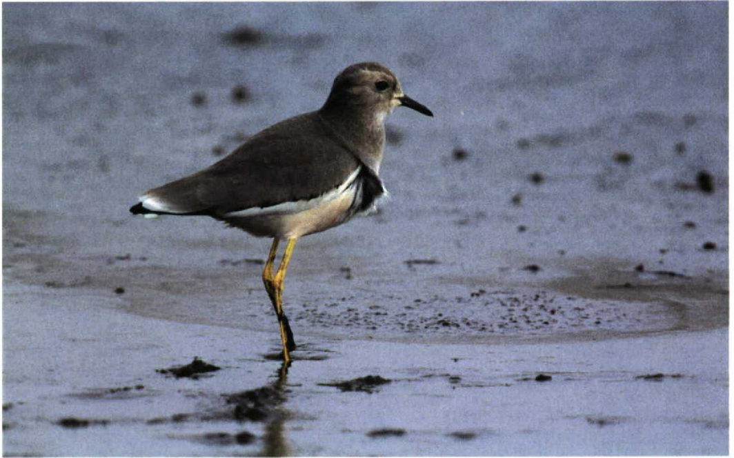
26 Witstaartkievit / White-tailed Lapwing Vanellus leucurus , Krommenie, Noord-Holland, 23 februari 1998 (René Pop)

Witstaartkievit bij Krommenie Op zaterdag 21 februari 1998 was Martien Roos op zoek naar teruggekeerde Grutto's Limosa limosa in de voor toekomstige woningbouw gedeeltelijk met zand opgespoten weilanden ten zuiden van Krommenie en bij Assendelft, Noord-Holland. In een ondiepe plas vond hij drie steltlopers, waarvan hij er twee direct als Tureluur Tringa totanus determineerde; bij de derde vogel lukte dat echter niet zo gemakkelijk. De lange gele poten en witte staart vielen bij deze vogel het meest op. Even dacht MR aan een Goudplevier Pluvialis apricaria maar al snel concludeerde hij dat het die niet kon zijn. Thuisgekomen raadpleegde hij de 'Lars Jonsson' en kon hij geen andere conclusie trekken dan dat het om een Witstaartkievit Vanellus leucurus ging. Hoewel MR niet speciaal geïnteresseerd is in zeldzaamheden besefte hij dat anderen graag kennis zouden nemen van deze bijzondere waarneming; daarom belde hij zijn kennis Peter Meijer, die het nieuws direct verspreidde. Ongeveer een uur later werd de waarneming bevestigd en konden de massaal toegestroomde (en aanvankelijk veelal ongelovige) vogelaars dit ornithologische mirakel met eigen ogen aanschouwen. Nadat de vogel zich over een flinke afstand verplaatst had en daarmee nog even voor wat spanning zorgde, liet hij zich tot donker bekijken in