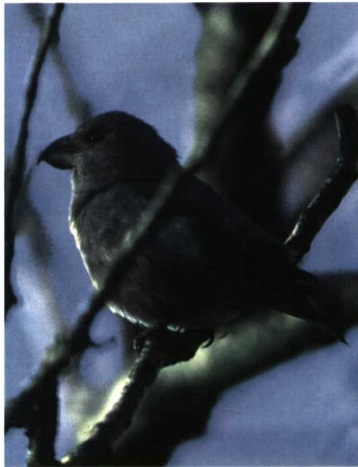
25 Grote Kruisbek / Parrot Crossbill Loxia pytyopsittacus , vrouwtje, Kennemerduinen, Bloemendaal, Noord-Holland, 31 januari 1998 (Arnoud B van den Berg)

spreidden deze vogels zich verder over Limburg en volgden waarnemingen te Helchteren-Meeuwen (11 januari); Schulin (10 en 23 januari); Neerpelt (maximaal drie op 22 en 24 januari); en Bokrijk (twee op 25 januari). Op 17 december verbleven er twee te Tienen, Vlaams-Brabant; op 24 december één te La Hulpe, Waals-Brabant, en op 26 december één te Ploegsteert, Hainaut. Te Harchies-Hensies, Hainaut, werden tot in februari nog één tot twee vogels waargenomen en ook te Geel, Antwerpen, was de gehele periode een exemplaar aanwezig. Van 24 tot 28 december verbleef een Ooievaar Ciconia ciconia in het centrum van Tournai, Hainaut; verder werden exemplaren waargenomen te Tessenderlo, Limburg, op 5 januari; te Warchin, Hainaut, op 7 en 8 januari; over Gent op 9 januari; over Heule, West-Vlaanderen, op 22 januari; te Geel op 25 januari; en hetzelfde exemplaar vloog over Geel, Herentals, en Brecht, Antwerpen, op 26 januari. De enige Rode Wouwen Milvus milvus in Laag-België vlogen op 14 december over Mendonk, Oost-Vlaanderen, en op 18 december over Kallo-Doel. Op 1 en 2 december werd een mogelijke Sakervalk Falco cherrug waargenomen te Lovendegem-Oosterzele, Oost-Vlaanderen.