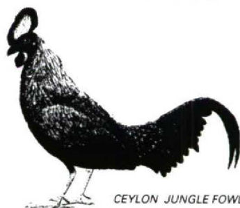
CEYLON JUNGLE FOWL

Experienced Tour Operator Delmege Forsyth Tours (Pvt) Ltd., 101, Vinayalankara Mawatha, Colombo 10. Sri Lanka.