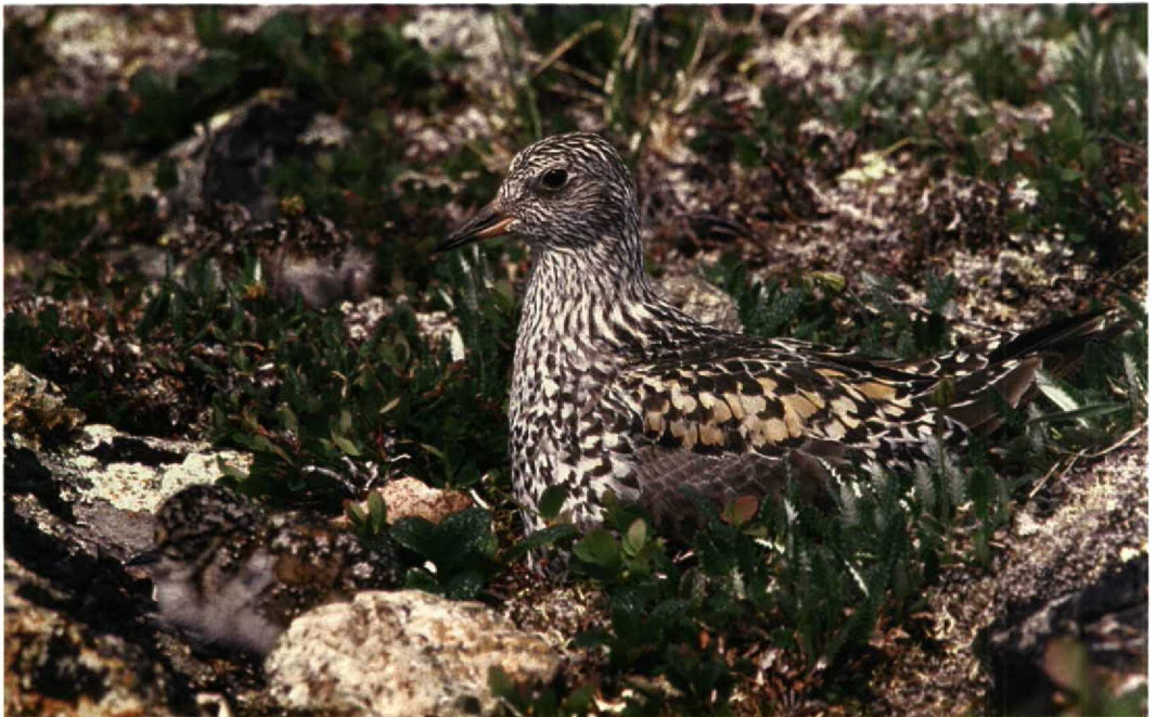
194 Surfbird / Brandingloper Aphriza virgata, adult with downy young, Turquoise Lake, Alaska, USA, 11 June 1997. Tundra is getting green at hatching