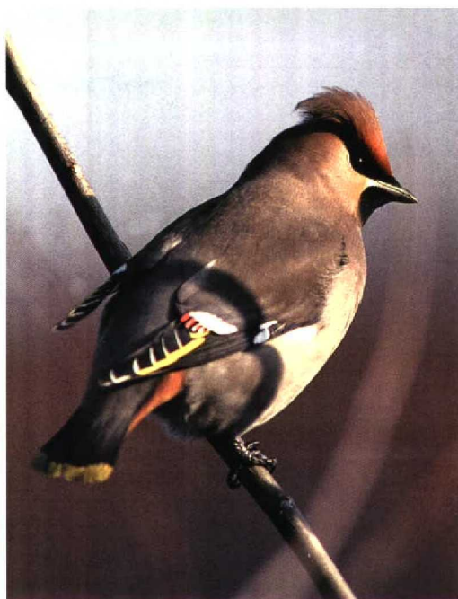
170 Pestvogel / Bohemian Waxwing Bombycilla garrulus , adult, Katwijk aan Zee, Zuid-Holland, 29 januari 1996 (René van Rossum)

eeuw is in hoge mate gebaseerd op een door Frans Rijnja bijeengebracht en aan Peter de Knijff overgedragen archief waarin vrijwel alle gepubliceerde Pestvogelwaarnemingen in 1900-77 zijn opgenomen. Hoewel dit archief niet volledig is, betreft het hier de meest complete toegankelijke bron van historische informatie. Aanvullingen over het optreden van invasies (ook buiten Nederland) zijn ontleend aan met name Eykman et al (1937), Glutz von Blotzheim (1966), Haffer (1985) en Cramp (1988). De waarnemingen uit de periode 1978-83 zijn afkomstig uit de database van het Atlasproject voor winter- en trekvogels van SOVON en deels gepubliceerd in SOVON (1987). Omdat deze waarnemingen per maand werden ingezameld en exacte aantalsopgaven niet verplicht waren, sluiten ze niet geheel aan bij die uit eerdere tijden. Voor de globale schets van het voorkomen zijn ze echter voldoende gedetailleerd. Informatie omtrent het voorkomen in 1984-88 is in hoofdzaak ontleend aan de waarnemingenrubrieken in Dutch Birding en Vogeljaar en aan Eggenhuizen (1989). Informatie van na 1989 stamt uit de database van het BSP Niet-broedvogels.