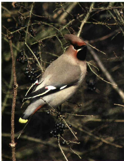
169 Pestvogel / Bohemian Waxwing Bombycilla garrulus , eerste-winter, Enschede, Overijssel, 16 maart 1996 (Paul Knolle)