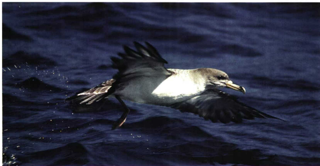
172 Scopoli's Shearwater / Scopoli's Pijlstormvogel Calonectris diomedea , off Palamós, Girona, Spain, 6 April 1997 (Ricard Gutiérrez). Note head proportions, slender bill and neck, pale neck and upperparts and pale inner webs of outermost primaries

On average, the upperside is noticeably darker in borealis . The head and, especially, the upperparts of diomedea are generally paler. Thus, individuals with little or no contrast between head, upperparts and upperwings are clearly borealis