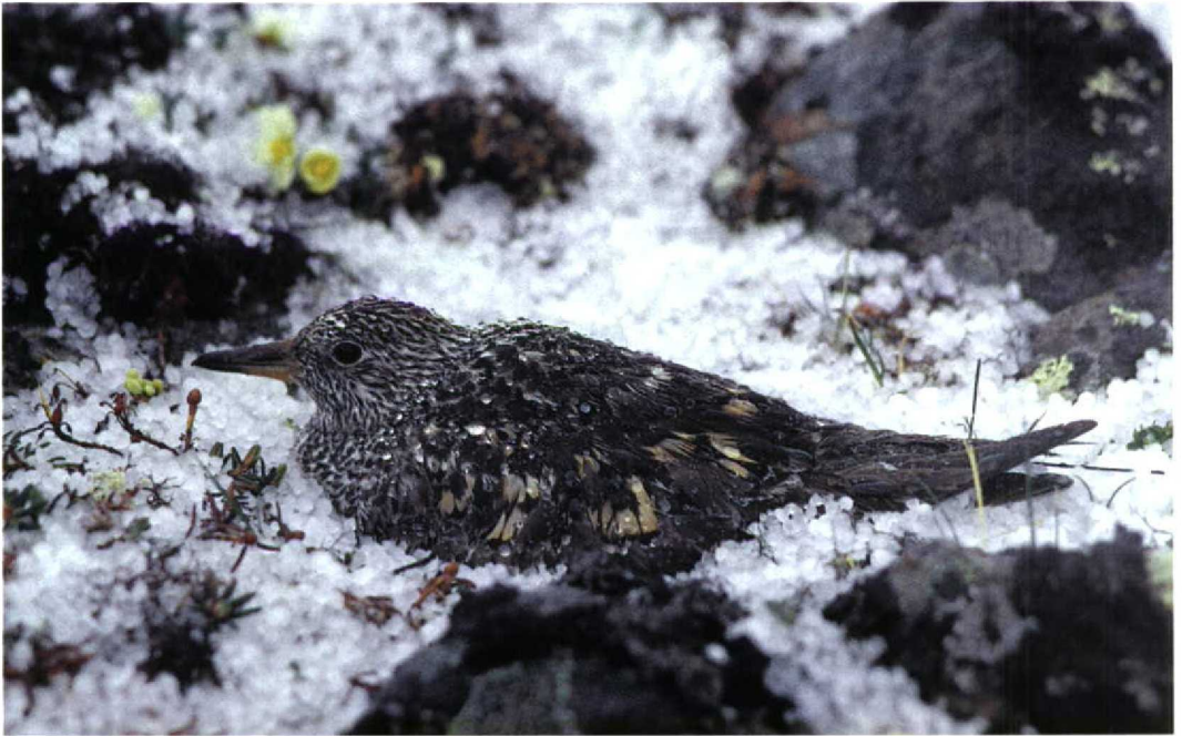
193 Surfbird / Brandingloper Aphriza virgata, incubating female after hail, Turquoise Lake, Alaska, USA, 9 June 1997