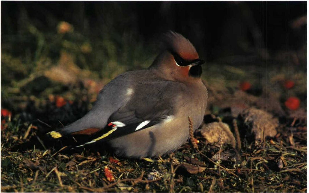
171 Pestvogel / Bohemian Waxwing Bombycilla garrulus , eerste-winter, Katwijk aan Zee, Zuid-Holland, 29 januari 1996 (René van Rossum)

zijn, per invasie verschilt. In veel gevallen worden gedurende 3-5 maanden grote aantallen gezien. In enkele gevallen is deze periode kortstondiger geweest, met name in de vroege, respectievelijk late invasiewinters 1965/66 en 1956/57. In het eerste geval was eigenlijk sprake van doortrek en niet van overwintering. In het tweede geval werd het zeer late en plotselinge voorkomen waarschijnlijk gelanceerd door het volledig uitgeput raken van voedselbronnen ten noorden en/of oosten van Nederland (Glutz von Blotzheim 1966).