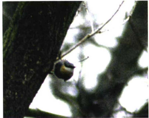
195 Aberrant European Nuthatch / afwijkende Boomklover Sitta europaea , Park Sansouci, Potsdam, Germany, 17 December 1996

There is no other species of nuthatch with the features shown in the photographs (cf Harrap & Quinn 1996) and no obvious hybrid candidate is available with blue-grey belly and flanks. Thus,