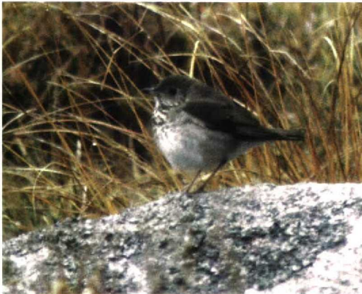
167 Grey-cheeked Thrush / Grijswangdwerlglijster Catharus minimus , Utsira, Rogaland, Norway, 28 October 1973 (Viggo Ree)