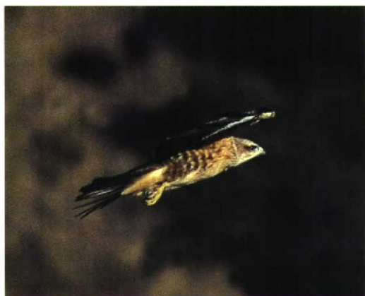
189 Hybrid Black Kite x Common Buzzard / hybride Zwarte Wouw x Buizerd Milvus migrans x Buteo buteo , juvenile, Tolfa Hills, Lazio, Italy, August 1996 (Daniele Ardizzone)