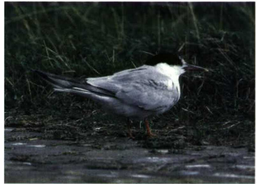
198 Common Tern / Visdief Sterna hirundo hirundo , adult summer, Stellendam, Zuid-Holland, Netherlands, 4 July 1994 (Klaus Malling Olsen). Note pale extreme tip to bill 199 Common Tern / Visdief Sterna hirundo hirundo , adult moulting to winter plumage, Lelystad, Flevoland, Netherlands, 9 September 1995 (Klaus Malling Olsen). Note extent of pale bill-tip, which gradually becomes more extensive in late summer and autumn before bill in winter becomes all black

would be even more out-of-range for the short-distance migrating tibetana . A further indication was that neither Kennerley nor me have ever seen the grey axillaries in any hirundo and tibetana , although I have noticed a slight grey wash in a bird ( hirundo or minussensis ) photographed in Kazakhstan in June. In that individual, the bill coloration was close to the Hong Kong tibetana (darker red with broader black bill-tip). Note also, that the 'mystery tern' photographs are rather dark, especially affecting the appearance of the upperparts – in my opinion this may well be a photographic effect rather than reality.