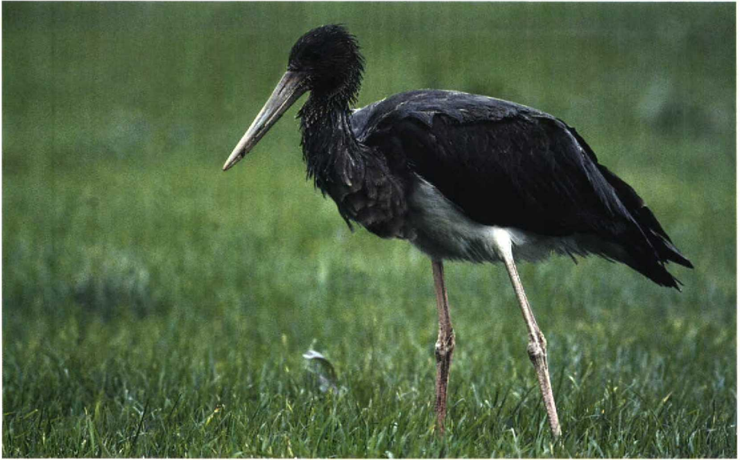
214 Zwarte Ooievaar / Black Stork Ciconia nigra , Texel, Noord-Holland, 14 september 1998