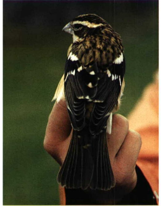
163 Eyebrowed Thrush / Vale Lijster Turdus obscurus , Utsira, Rogaland, Norway, October 1981 (Ove Bryne) 164 Rose-breasted Grosbeak / Roodborstkardinaal Pheucticus ludovicianus , Utsira, Rogaland, Norway, October 1977 (Ove Bryne) 165 Little Bunting / Dwerggors Emberiza pusilla and Yellow-breasted Bunting / Wilgengors E aureola , Utsira, Rogaland, Norway, September 1985 (Ove Bryne)