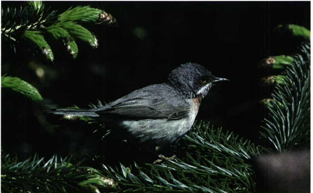
166 Subalpine Warbler / Baardgrasmus Sylvia cantillans , Utsira, Rogaland, Norway, May 1994

In early August, the first autumn migrants are seen heading south. The first wave involves com-