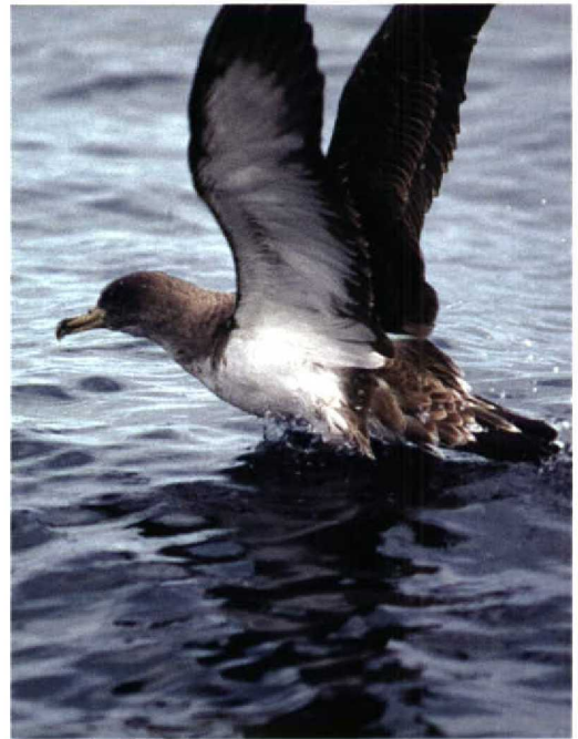
173 Scopoli's Shearwater / Scopoli's Pijlstormvogel Calonectris diomedea , off Palamós, Girona, Spain, 6 April 1997 (Ricard Gutiérrez). Compared with Cory's Shearwater C borealis , Scopoli's shows narrower wings. Note also bill proportions and white underwing panel shape 174 Cory's Shearwater / Kuhls Pijlstormvogel Calonectris borealis , off Lajes do Pico, Pico, Azores, 26 July 1997 (Ricard Gutiérrez). Note thicker and darker neck compared with Scopoli's Shearwater C diomedea depicted in plate 172. Note also broader wings. White underwing panel restricted to coverts, creating rounded-tip effect

while birds with paler upperparts contrasting with the rest of the upperside could either be borealis or diomedea . Borealis tends to show more contrast between upperside and underside, also contributing to a more fierce look than diomedea (see above). The neck shows less contrast with the head and mantle in borealis . Often, borealis appears thicker-necked than diomedea . In addition, the extent to which the dark upperside fades into the pale sides of the neck differs between the two. On average, it is more contrasting in borealis than in diomedea . Some distant borealis seen in the Azores in July 1997 seemed to have a head with a cap recalling Great Shearwater in this respect, a feature never recorded in diomedea . The lores always appear dark in both borealis and diomedea .