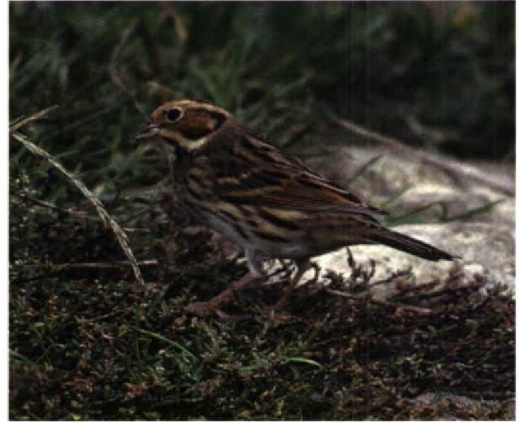
219 Dwerggors / Little Bunting Emberiza pusilla , Terschelling, Friesland, 21 september 1998 (Arie Ouwerkerk)

dit jaar weer opgevulrijkt door een Bergfluitier P. bonelli , ditmaal van 14 tot 16 september in de fameuze tuintjes bij De Cocksdorp. Na een vroege melding op 21 augustus in Haren, Groningen, waren er Kleine Vliegenvangers Ficedula parva op 15 en 16 september in het Oostduinpark bij Den Haag, op 19 september op Vlieland, op 23 september bij de Westplaat, op 25 september bij Den Helder en Katwijk aan Zee, op 26 september in het Noord-Hollands Duinreservaat, Noord-Holland, en bij Petten en op 27 september bij Maasdam, Zuid-Holland. Taigaboombkruipers Certhia familiaris werden gezien op 13 september op Breezanddijk en op 28 september bij Lauwersoog, Groningen. De meeste Buidelmezen Remiz pendulinus op doortrek werden gezien vanaf eind augustus. De Huis-kraai Corvus splendens van Kollumeroord, Friesland, werd daar gezien van 15 tot 19 augustus en mogelijk