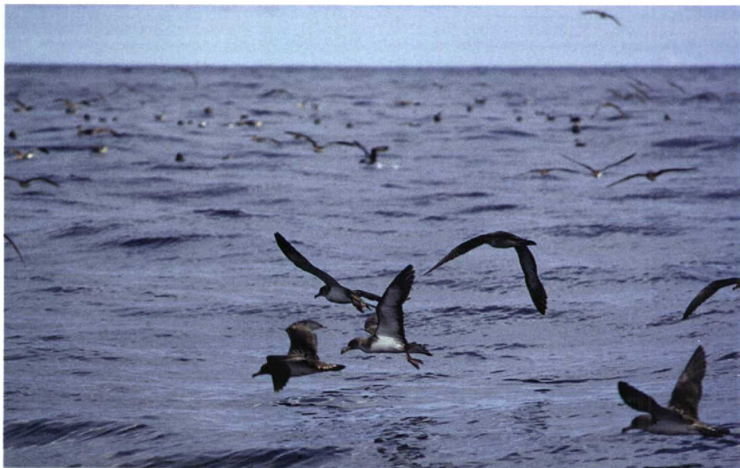
179 Cory's Shearwaters / Kuhls Pijlstormvogels Calonectris borealis , off Lajes do Pico, Pico, Azores, 26 July 1997 (Ricard Gutiérrez). Upperside of Cory's Shearwater tends to be darker than in Scopoli's Shearwater C diomedea . Note also underwing pattern and structure 180 Scopoli's Shearwaters / Scopoli's Pijlstormvogels Calonectris diomedea , off Palamós, Girona, Spain, 6 April 1997 (Ricard Gutiérrez). Head pattern is variable. However, note bill proportions in relation to head compared with Cory's Shearwater C borealis