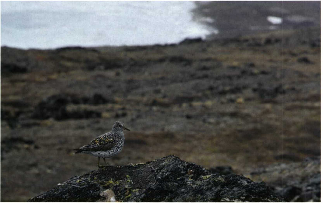
191 Surfbird / Brandingloper Aphriza virgata, territorial bird, Turquoise Lake, Alaska, USA, 21 May 1997