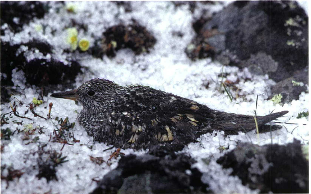
193 Surfbird / Brandingloper Aphriza virgata, incubating female after hail, Turquoise Lake, Alaska, USA, 9 June 1997