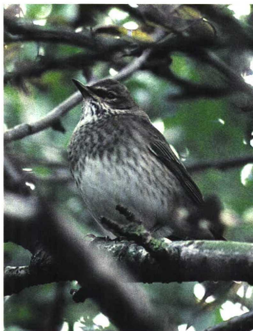
160 Myrtle Warbler / Mirtezanger Dendroica coronata , Utsira, Rogaland, Norway, 8 October 1996 (Håkon Heggland) 161 Black-throated Thrush / Zwartkeellijster Turdus ruficollis atrogularis , Utsira, Rogaland, Norway, 1 October 1991 (Håkon Heggland) 162 Swainson's Thrush / Dwerglijster Catharus ustulatus , Utsira, Rogaland, Norway, 20 September 1974 (Viggo Ree)