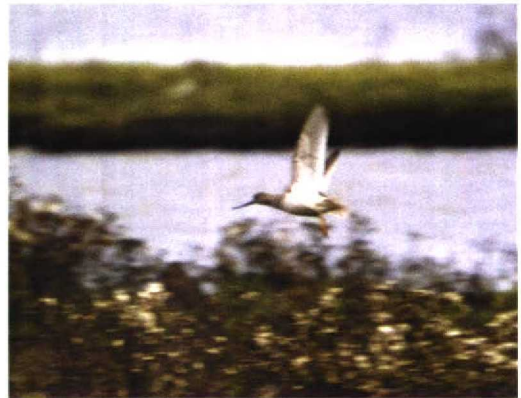
204 Demoiselle Crane / Jufferkraanvogel Anthropoides virgo , adult, Mariahoop, Limburg, Netherlands, 17 September 1998 (Jan den Hertog) 205 Least Sandpiper / Kleinste Strandloper Calidris minutilla , Rogerstown, Dublin, Ireland, 25 September 1998 (Paul Kelly) 206 Buff-breasted Sandpiper / Blonde Ruiter Tryngites subruficollis , Oye-Plage, Pas-de-Calais, France, 23 September 1998 (Roger Tonnel) 207 Willet / Willet Catoptrophorus semipalmatus , first-winter, La Belle-Henriette, Vendée, France, 13 September 1998 (Jean-Yves Frémont) 208 Long-billed Dowitcher / Grote Grijze Snip Limnodromus scolopaceus , Leighton Moss, Lancashire, England, October 1998 (Steve Young/Birdwatch) 209 Terek Sandpiper / Terekrutter Xenus cinereus , De Putten, Schoorl, Netherlands, Noord-Holland, 10 October 1998 (Jan den Hertog)