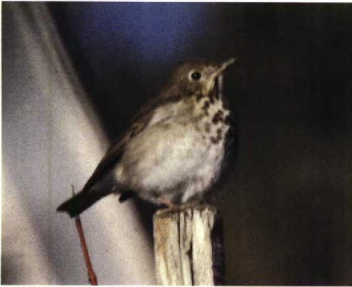
211 Hermit Thrush / Heremietlijster Catharus guttatus , Galley Head, Cork, Ireland, 25 October 1998 (Paul Kelly)