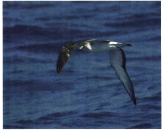
175 Scopoli's Shearwater / Scopoli's Pijlstormvogel Calonectris diomedea , off Arenys de mar, Barcelona, Spain, 14 April 1986 (Ricard Gutiérrez) 176 Cory's Shearwater / Kuhls Pijlstormvogel Calonectris borealis , off Lajes do Pico, Pico, Azores, 26 July 1997 (Ricard Gutiérrez). Note thicker bill than in Scopoli's Shearwater C. diomedea depicted in plate 175 177 Cory's Shearwater / Kuhls Pijlstormvogel Calonectris borealis , off Lajes do Pico, Pico, Azores, 26 July 1997 (Ricard Gutiérrez). In some light conditions, primaries show two tones, black and dark grey; however, white underwing panel never forms pointed shape (plate 178). Note also broad wings and heavy structure 178 Scopoli's Shearwater / Scopoli's Pijlstormvogel Calonectris diomedea , off Isla Cristina, Huelva, August 1996 (Xavier Laruy). Even in distant birds, shape of white underwing panel is clearly visible

(Sánchez Codoñer 1994, contra Thibault & Bretagnolle 1998). Another (nine-year-old) female borealis ringed as pullus on Selvagem Grande was present on Linosa, Pelagian Islands, Sicilian Channel, although not breeding (Lo Valvo & Massa 1988). An apparent case of mixed pairing in the Mediterranean Sea between a proven male borealis (identified through call analysis, body measurements and cytochrome-b sequence) and a presumed diomedea female (call atypical for diomedea but biometrics within the range of this taxon; however, no underwing pattern was described) was reported from a dio-