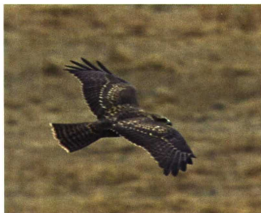
190 Hybrid Black Kite x Common Buzzard / hybride Zwarte Wouw x Buizerd Milvus migrans x Buteo buteo , juvenile, Tolfa Hills, Lazio, Italy, August 1996 (Roberto Gildi)

Common Buzzard, eight characters of Black Kite, and five intermediate (see table 1).