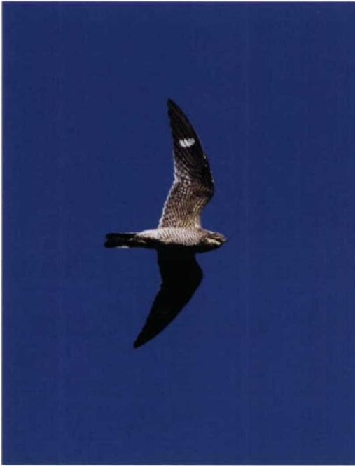
210 Common Nighthawk / Amerikaanse Nachtzwaluw Chordeiles minor , adult female, Ouessant, Finistère, France, September 1998 (Miguel Vergès)

record 29 young. In Cyprus, flocks of Demoiselle Crane Anthropoides virgo passed through during 2-10 September with several flocks of over 100 individuals, the largest being 180 at Akrotiri on 2 September. In Israel, one was seen at Kfar Ruppin on 5 September. An adult at Montfoort, Limburg, the Netherlands, from 20 August until at least 25 October was alleged to have missing remiges and was regarded by many as being of doubtful origin. A Little Bustard Tetrax tetrax stayed at the Quendale area, Shetland, on 4-6 October before being picked up with a broken wing.