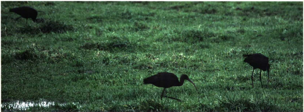
201 Glossy Ibises / Zwarte Ibissen Plegadis falcinellus , Gaast, Friesland, Netherlands, 11 October 1998 (Mark Zekhuis)