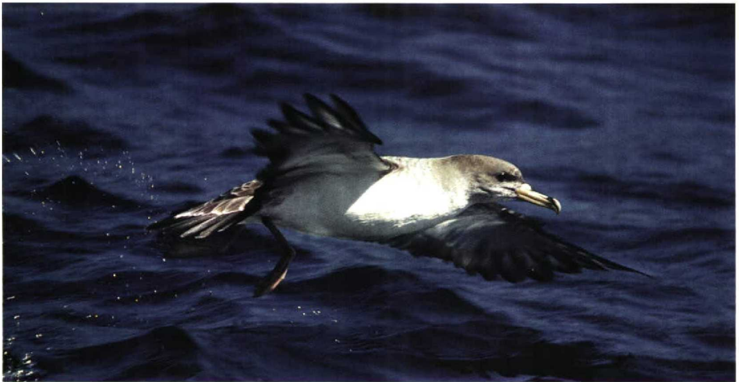
172 Scopoli's Shearwater / Scopoli's Pijlstormvogel Calonectris diomedea , off Palamós, Girona, Spain, 6 April 1997 (Ricard Gutiérrez). Note head proportions, slender bill and neck, pale neck and upperparts and pale inner webs of outermost primaries

On average, the upperside is noticeably darker in borealis . The head and, especially, the upperparts of diomedea are generally paler. Thus, individuals with little or no contrast between head, upperparts and upperwings are clearly borealis