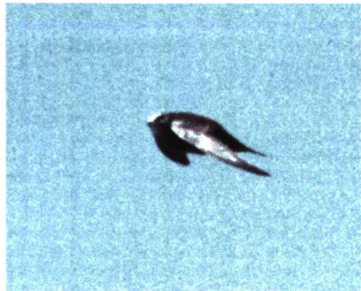
168 Pallid Swift / Vale Gierwaluw Apus pallidus , Utsira, Rogaland, Norway, 3 June 1995