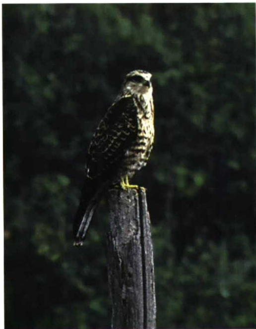
187-188 Hybrid Black Kite x Common Buzzard / hybride Zwarte Wouw x Buizerd Milvus migrans x Buteo buteo , juvenile, Tolfa Hills, Lazio, Italy, August 1996 (Roberto Gildi)