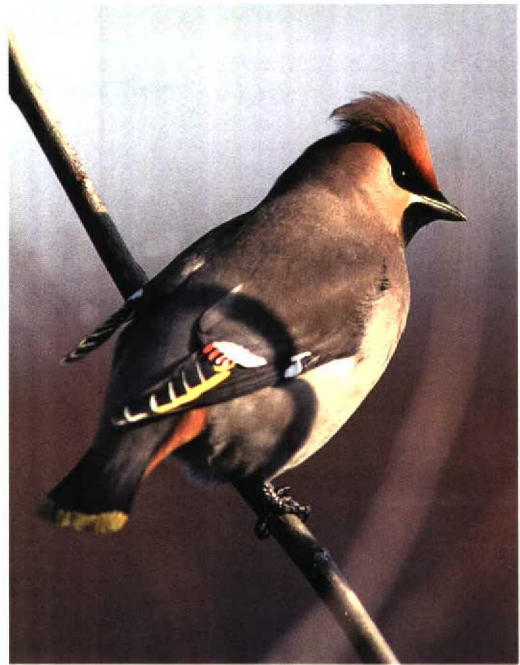
170 Pestvogel / Bohemian Waxwing Bombycilla garrulus , adult, Katwijk aan Zee, Zuid-Holland, 29 januari 1996

eeuw is in hoge mate gebaseerd op een door Frans Rijnja bijeengebracht en aan Peter de Knijff overgedragen archief waarin vrijwel alle gepubliceerde Pestvogelwaarnemingen in 1900-77 zijn opgenomen. Hoewel dit archief niet volledig is, betreft het hier de meest complete toegankelijke bron van historische informatie. Aanvullingen over het optreden van invasies (ook buiten Nederland) zijn ontleend aan met name Eykman et al (1937), Glutz von Blotzheim (1966), Haffer (1985) en Cramp (1988). De waarnemingen uit de periode 1978-83 zijn afkomstig uit de database van het Atlasproject voor winter- en trekvogels van SOVON en deels gepubliceerd in SOVON (1987). Omdat deze waarnemingen per maand werden ingezameld en exacte aantalsopgaven niet verplicht waren, sluiten ze niet geheel aan bij die uit eerdere tijden. Voor de globale schets van het voorkomen zijn ze echter voldoende gedetailleerd. Informatie omtrent het voorkomen in 1984-88 is in hoofdzaak ontleend aan de waarnemingenrubrieken in Dutch Birding en Vogeljaar en aan Eggenhuizen (1989). Informatie van na 1989 stamt uit de database van het BSP Niet-broedvogels.