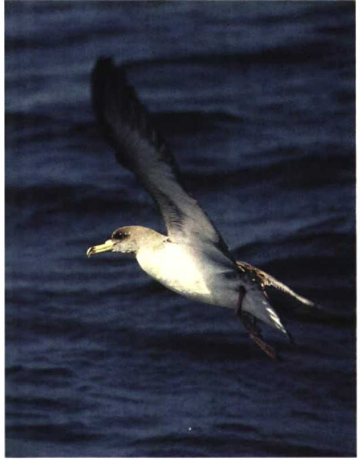
181 Cory's Shearwater / Kuhls Pijlstormvogel Calonectris borealis , off Lajes do Pico, Pico, Azores, 26 July 1997 (Ricard Gutiérrez). Even in bad conditions, underwing pattern is clearly visible. Note also almost uniformly coloured upperside in this bird (unlike Cory's Shearwater depicted in plate 176) 182 Scopoli's Shearwaters / Scopoli's Pijlstormvogels Calonectris diomedea , off Palamós, Girona, 6 April 1997 (Ricard Gutiérrez). Note slim proportions (pitfall of Balearic Shearwater Puffinus mauretanicus for inexperienced observers) and white underwing panel 183 Cory's Shearwater / Kuhls Pijlstormvogel Calonectris borealis , picked up at Fijnaart, Noord-Brabant, Netherlands, 27 September 1996 (photographed on 4 October 1996) (Hans Westerlaken)