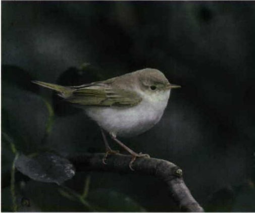
218 Bergfluitier / Western Bonelli's Warbler Phylloscopus bonelli , Texel, Noord-Holland, 15 september 1998