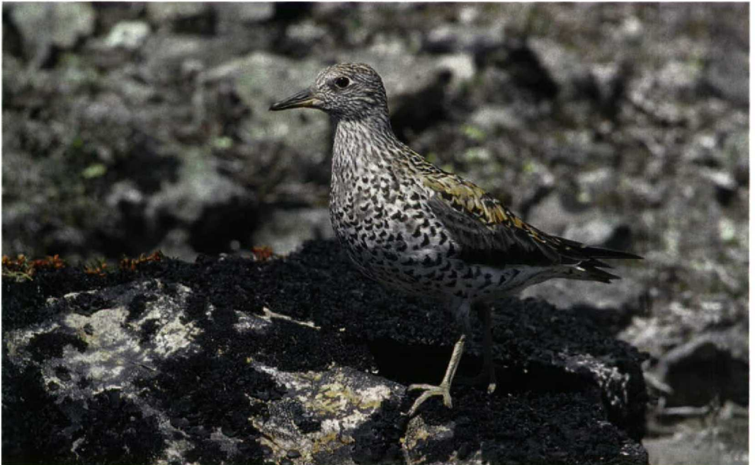
192 Surfbird / Brandingloper Aphriza virgata, Turquoise Lake, Alaska, USA, 26 May 1997