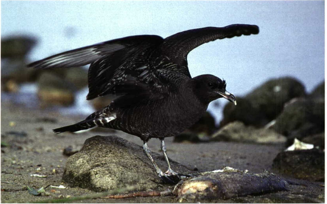
202 Long-tailed Skua / Kleinste jager Stercorarius longicaudus , Altmühlsee, Bayern, Germany, August 1998 (Thomas Sacher)