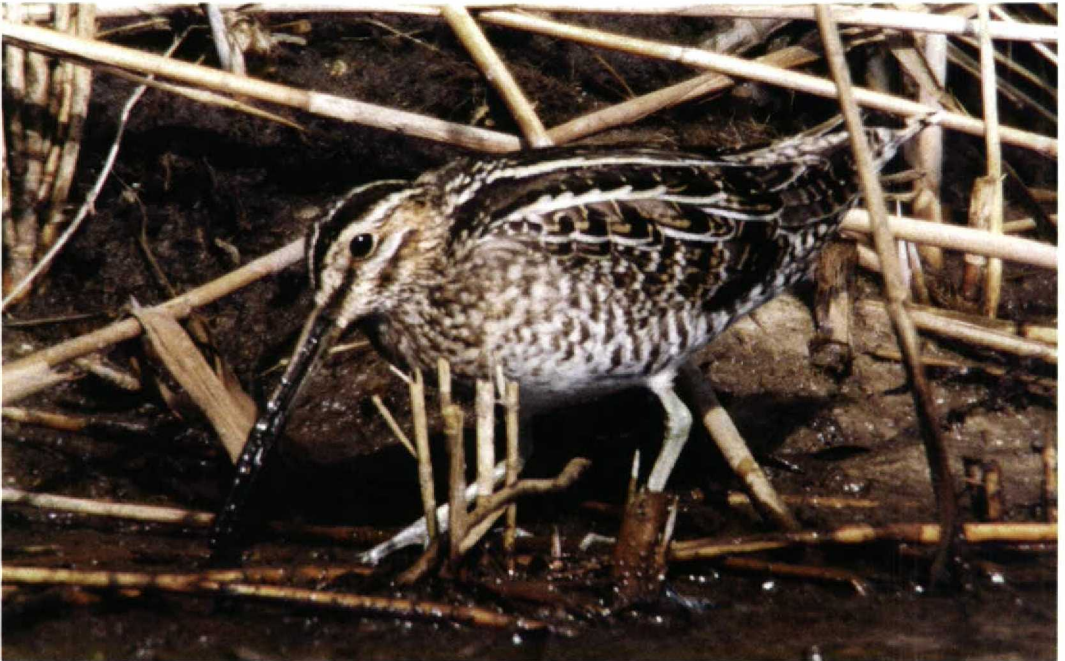
203 Wilson's Snipe / Wilsons Snip Gallinago delicata , Lower Moors, St Mary's, Scilly, England, October 1998 (Iain H Leach)