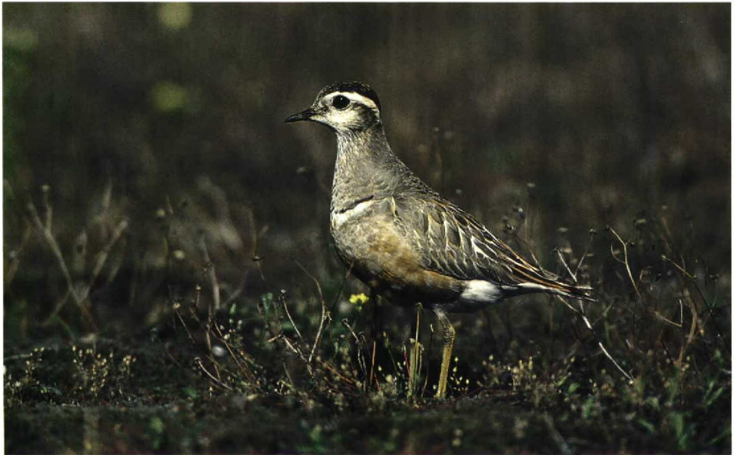
215 Morinelplevier / Dotterel Charadrius morinellus , Maasvlakte, Zuid-Holland, 5 september 1998