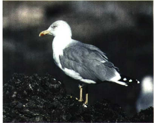
197 Yellow-legged Gull / Geelpootmeeuw Larus michahellis , adult, Mucking, Essex, England, October 1996 (Bob Glover)

plate 117, 1997), and another photograph of the same individual is published here (plate 195).