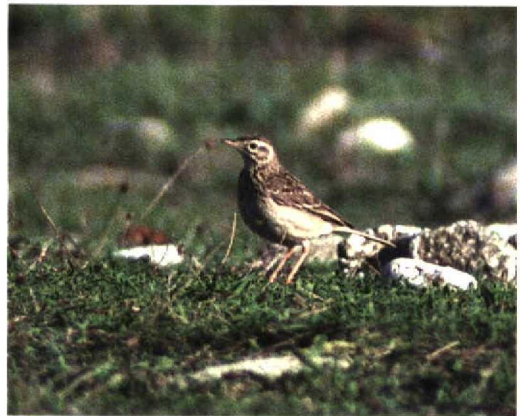
212 Blyth's Pipit / Mongoolse Pieper Anthus godlewskii , Sein, Finistère, France, October 1998 (Marc Duquet)