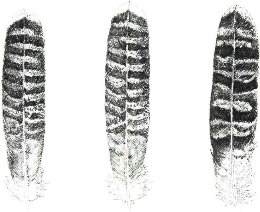
FIGURE 3. Rectrices. Centre: Tofia Hills juvenile hybrid Black Kite x Common Buzzard / hybride Zwarte Wouw x Buizerd Milvus migrans x Buteo buteo ; right: European Honey-buzzard / Wespendif Pernis apivorus ; left: Common Buzzard / Buizerd ( Carmeluccia Cardelli )

darker than the others and also wider); and 7 barred flanks and thighs, contrasting with unbarred vent, belly and undertail-coverts (juvenile European Honey-buzzard normally shows dark, evenly spotted underparts although they can rarely show bars).