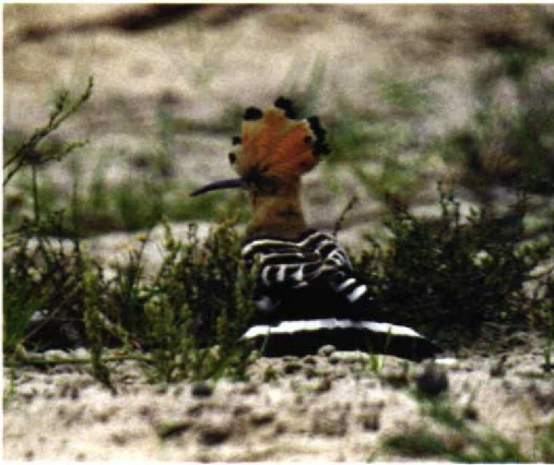
216 Hop / Hoopoe Upupa epops , Alkmaar, Noord-Holland, 3 oktober 1998

tember bij Den Haag. Visarenden Pandion haliaetus waren opvallend talrijk, met c 90 voornamelijk van eind augustus tot begin september. Verspreid over de periode werden 11 Roodpootvalken Falco vespertinus gezien.