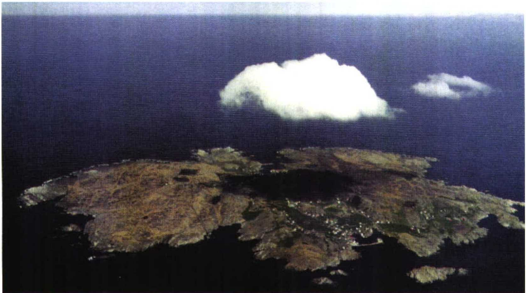
159 Utsira in bird's eye view ( Airspot )

diameter of c 3 km, covering c 6 km 2 . The grey, barren, mountainous rock that you see from the ferry is a sign of the rugged nature of Utsira. Yet, as you enter the north or south harbour, you will discover one of the island's secrets: a beautiful green valley that cuts across the diameter. In both harbours, old boat houses and wharf buildings line the shore whilst along the lanes joining north to south and up the short valleys many houses exhibit a bewildering variety of colours. The higher areas beyond the valley, which make up most of the eastern and western parts of the island, offer little but barren rock and sparse low vegetation. These moorlands, where the only suitable food sources and resting places for birds are heather and some spruce plantations, are not very good for birds and only host breeding Meadow Pipits Anthus pratensis and Northern Wheatears Oenanthe oenanthe . A few ponds are sometimes frequented by common dabbling ducks and the rough coastline can hold a few of the most common shorebirds. Thus, the main valley, Siradalen, and its near surroundings, is