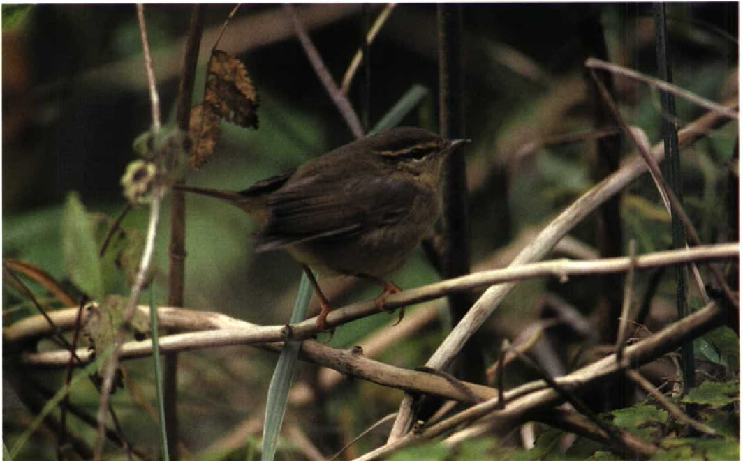
213 Radde's Warbler / Raddes Boszanger Phylloscopus schwarzi , Vlieland, Friesland, Netherlands, 11 October 1998

On Fair Isle, Pallas's Grasshopper Warblers Locustella certhiola were seen on 30 September, 1-2 October and 3-7 October. Another turned up in Lincolnshire, England, on 3 October. In France, one stayed on Ouessant on 11-15 October. In Shetland, Lanceolated Warblers L. lanceolata were present on Unst on 22 September and five occurred on Fair Isle between 26 September and 10 October. The third Paddyfield Warbler Acrocephalus agricola for Ireland stayed in the only tree of East Town, Tory Island, Donegal, on 21 September; in the same tree, a Greenish Warbler Phylloscopus trochiloides was present that day. Both birds were also trapped and ringed; on 30 September, the East Town tree produced a Little Bunting Emberiza pusilla . In 1998, Cape Verde Warbler A. brevipennis was rediscovered as a breeding bird on São Nicolau, Cape Verde Islands (the only other known breeding population occurs on