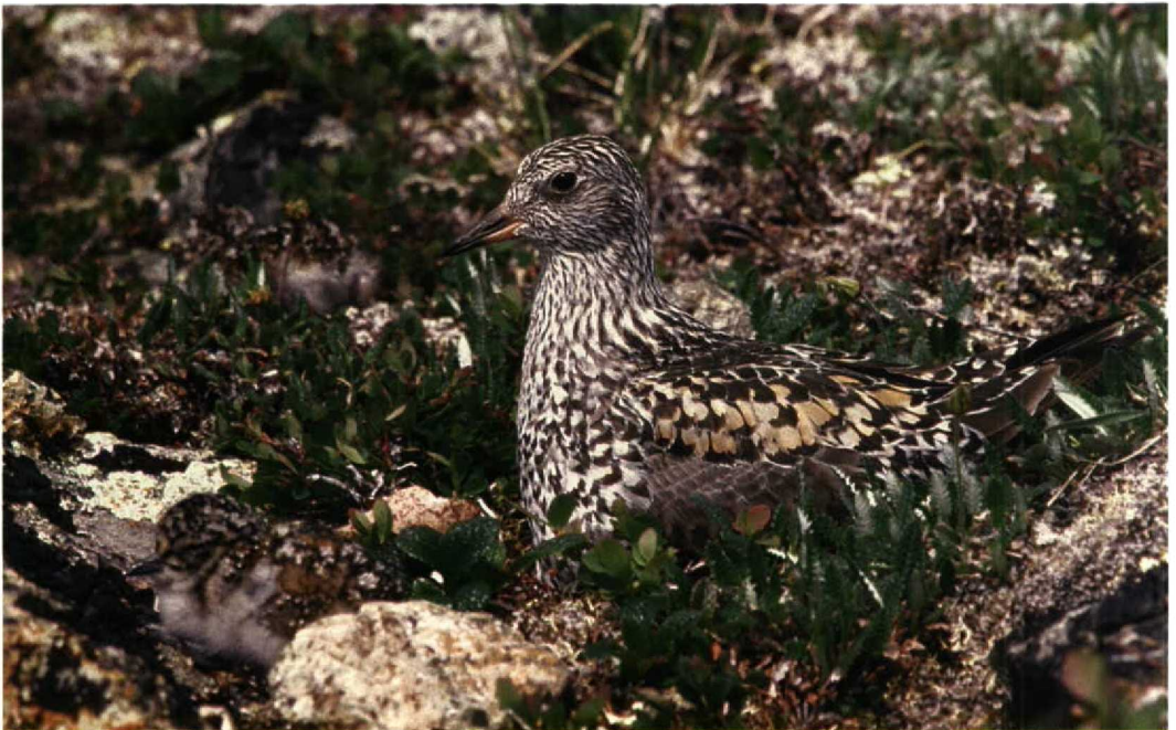
194 Surfbird / Brandingloper Aphriza virgata, adult with downy young, Turquoise Lake, Alaska, USA, 11 June 1997. Tundra is getting green at hatching