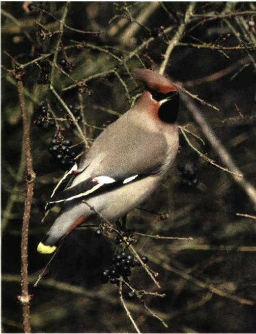
169 Pestvogel / Bohemian Waxwing Bombycilla garrulus , eerste-winter, Enschede, Overijssel, 16 maart 1996