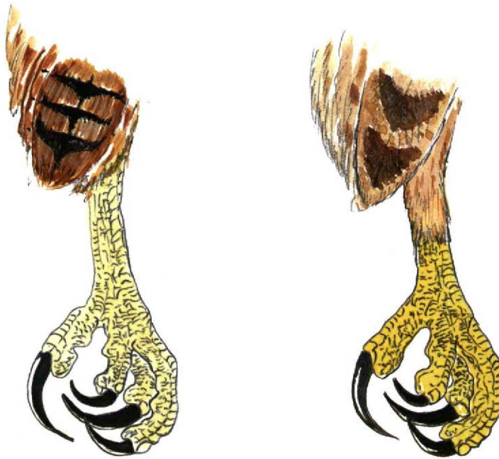
FIGURE 4 Legs and feet. Left: Tolfa Hills juvenile hybrid Black Kite x Common Buzzard / hybride Zwarte Wouw x Buizerd Milvus migrans x Buteo buteo ; right: European Honey-buzzard / Wespendifiel Pernis apivorus (Carmeluccia Cardelli)

Marsh Harrier or Montagu's Harrier (see overview in Forsman 1995 and references therein, Fairclough 1995; Dutch Birding 17: 119, 1995). The only successful hybridization in harriers was of a male Pallid paired with a female Montagu's raising three hybrid young in Finland in 1993 (Forsman 1995). Amongst European falcons, there are two known instances of copulating Common Kestrel F tinnunculus and Lesser Kestrel F naumanni but without nesting success (Andrea Corso pers obs).