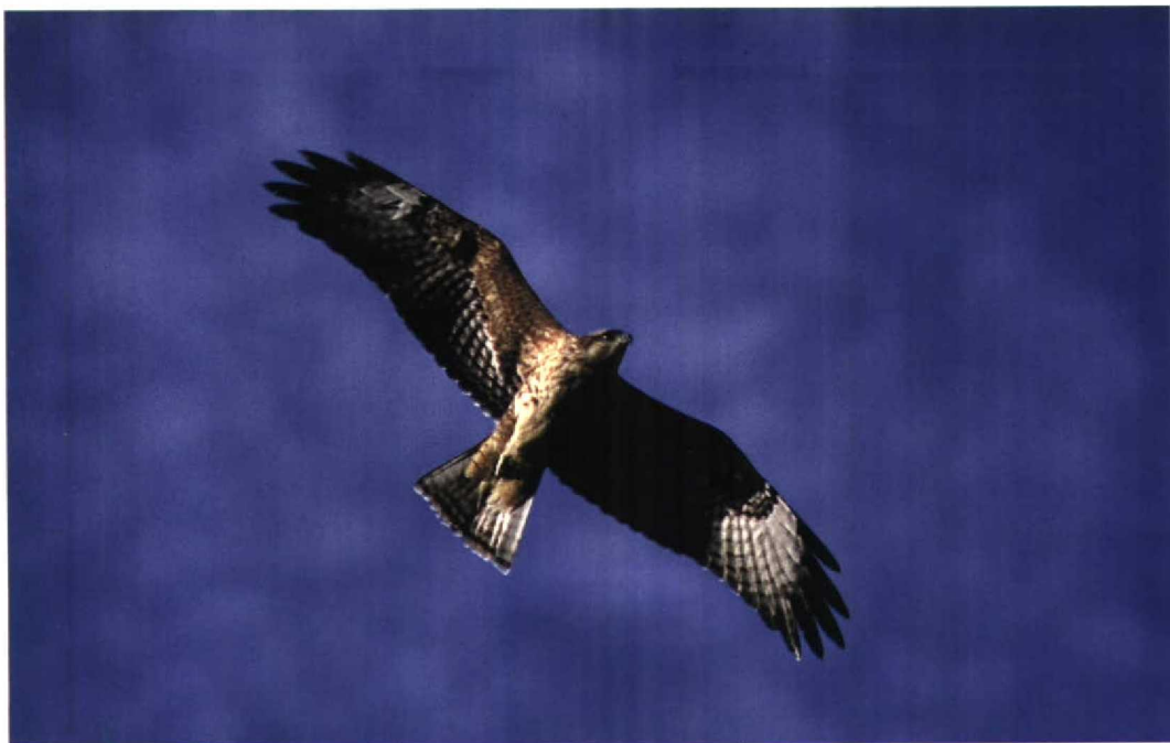
186 Hybrid Black Kite x Common Buzzard / hybride Zwarte Wouw x Buizerd Milvus migrans x Buteo buteo , juvenile, Tolfa Hills, Lazio, Italy, August 1996 (Daniele Ardizzone)