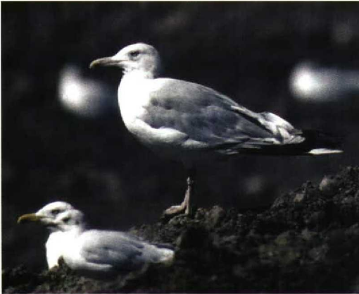
196 Pontic Gull / Pontische Meeuw Larus cachinnans cachinnans , adult, Mucking, Essex, England, 24 August 1996 (Bob Glover)