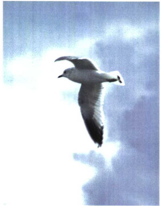
11 Hobby / Boomvalk Falco subbuteo , juvenile, Alphen aan den Rijn, Zuid-Holland, Netherlands, August 1995 12 Common Gull / Stormmeeuw Larus canus , second-winter, Woerden, Utrecht, Netherlands, 31 March 1996 13 Cirl Bunting / Cirlgors Emberiza cirlus , juvenile with adult male, Porto, Corsica, France, 11 July 1990