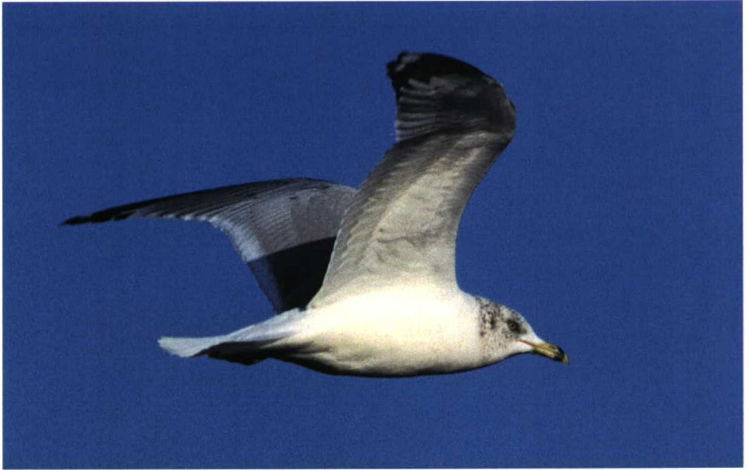
22 Ringsnavelmeeuw / Ring-billed Gull Larus delawarensis , adult, Goes, Zeeland, januari 1998 (Carl Derks)