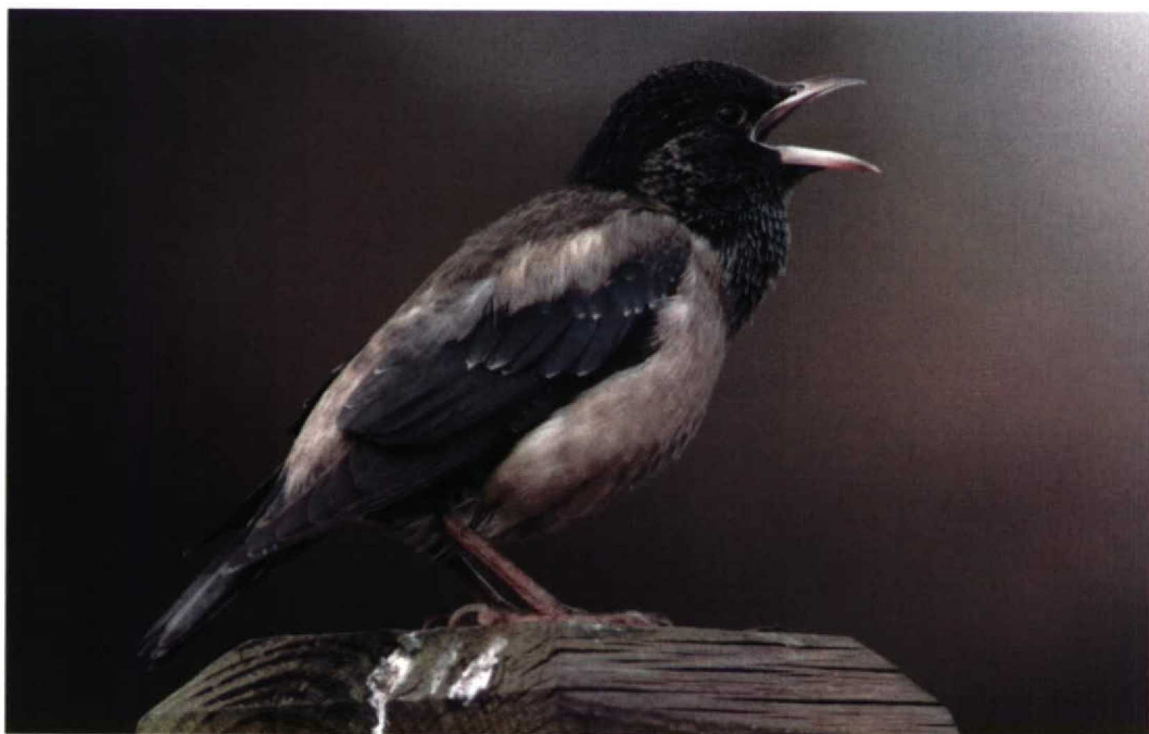
14 Rosy Starling / Roze Spreeuw Sturnus roseus , Beeston, Norfolk, England, January 1998