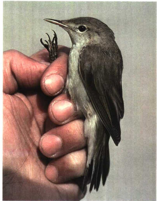
9 Olivaceous Warbler / Vale Spotvogel Acrocephalus pallidus , Jubail, Saudi Arabia, 16 April 1991 (Arnoud B van den Berg) 10 Caspian Reed Warbler / Kaspische Karekiet Acrocephalus fuscus , Jubail, Saudi Arabia, 16 April 1991 (Arnoud B van den Berg)

species of falcon with a barred closed uppertail (for example juvenile Red-footed Falcon F vesperinus ). Juvenile Sooty Falcon F concolor has a uniform closed uppertail, but another important feature of the mystery bird, the dark upperparts, do not fit this species (paler blue-grey in Sooty). As is visible on the outermost left tail feather, the barring is restricted to the inner web. This pattern on the tail feathers is typical for juvenile Hobby F subbuteo , although there are often some small spots present on the outer webs. In the very similarly plumaged juvenile Eleonora's Falcon F eleonora , the barring of the tail feathers is denser and continues further onto the outer web (the central pair of tail feathers being unbarred in both species).