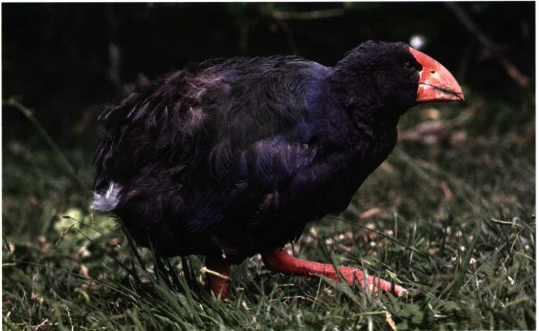
4 South Island Takahē / Zuidereilandtakahē Porphyrio hochstetteri , Tiritiri Matangi, New Zealand, 9 February 1997