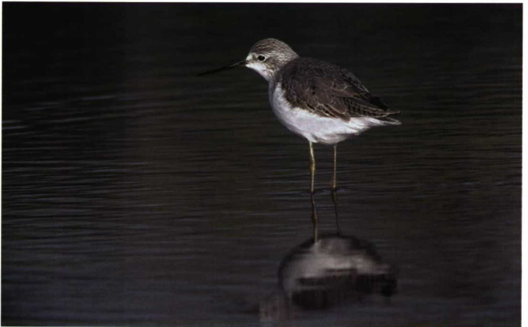
15 Marsh Sandpiper / Poelruiter Tringa stagnatilis , adult winter, Tavira, Algarve, Portugal, 24 January 1998 (Ray Tipper)