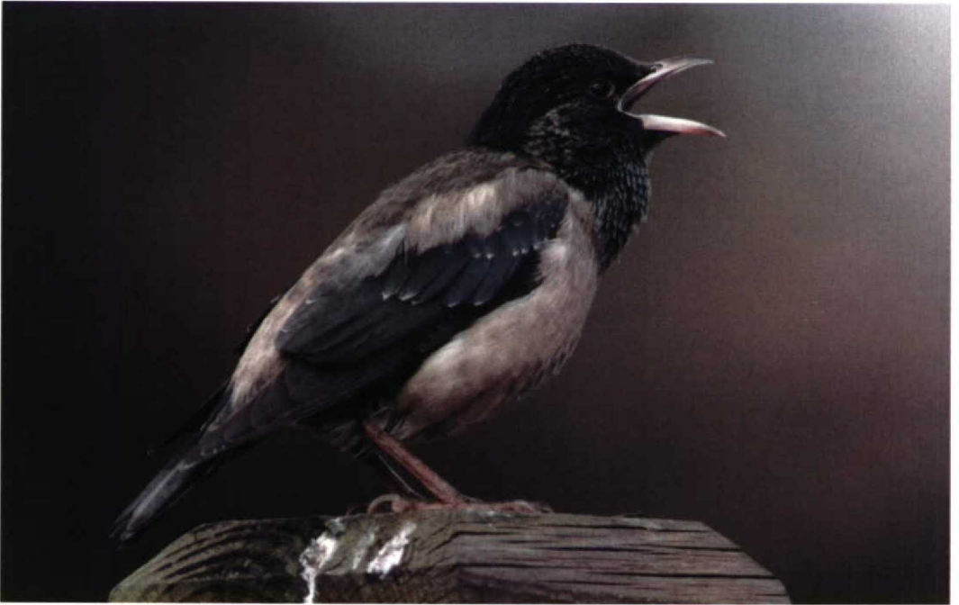
14 Rosy Starling / Roze Spreeuw Sturnus roseus , Beeston, Norfolk, England, January 1998