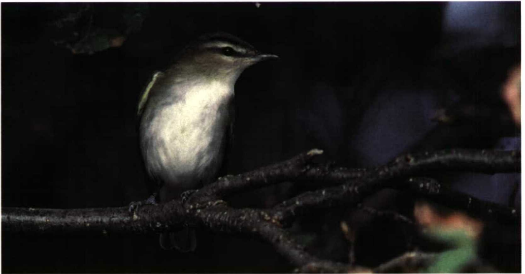
2 Roodoogvireo / Red-eyed Vireo Vireo olivaceus , Vlieland, Friesland, 6 oktober 1996 (Hans Gebuis)

groene bovendelen en vleugel, witte keel, borst en buik, gelige onderstaartdekveren en loodgrijze poten sloot alle Euraziatische grasmussen en boszangers Phylloscopus uit en paste eigenlijk alleen op Roodoogvireo. Philadelphiavireo, de enige soort waarmee nog enige verwarring mogelijk is, kon onder meer worden uitgesloten op grond van de witte borst en buik (bij Philadelphiavireo vaak uniform lichtgeel tot geel), de zwarte wenkbrauwbegrenzing (afwezig bij Philadelphiavireo) en het forse formaat (National Geographic Society 1987, Bradshaw 1992). Het rode vlekje dat zich twee dagen lang op de keel bevond, was waarschijnlijk afkomstig van bessen. Het op leeftijd brengen van de vogel leverde meer problemen op. Eerstejaars vogels kunnen worden herkend op grond van hun bruine iris. Echter, veel eerstejaars ontwikkelen reeds een rode iris (cf Pyle et al 1987, Glutz von Blotzheim et al 1993, Cramp & Perrins 1994). Deze exemplaren zijn dan zelfs in de hand uiterst moeilijk op leeftijd te determineren. De gelige onderstaartdekveren vormen geen betrouwbaar leeftijdskenmerk (contra National Geographic Society 1987; cf Pyle et al 1987, Glutz von Blotzheim et al 1993, Cramp & Perrins 1994). Er zijn geen andere betrouwbare leeftijdskenmerken in het verenkleed bekend (Pyle et al 1987). Resumerend lijkt het dus in dit geval niet mogelijk om de leeftijd te bepalen.