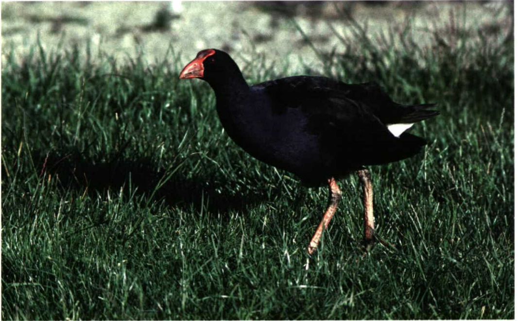
3 Australian Swamp-hen / Australische Purperkoet Porphyrio melanotus , Auckland, South Island, New Zealand, 24 October 1995