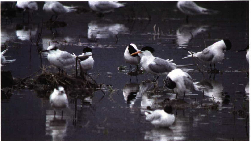
1 Elegant Tern / Sierlijke Stern Sterna elegans with Sandwich Terns / Grote Sterns S. sandvicensis , Llobregat delta, Barcelona, Spain, 24 April 1993 (Ricard Gutiérrez)

back, rump and tail is also important. Lesser Crested has a similar colour on the lower part of the mantle, back, scapulars, tertials and all the coverts as Common Tern, and darker than in Sandwich Tern. This was not the case in the Llobregat tern. Besides, in Lesser Crested, rump and tail have the same colour as the back and mantle or are sometimes slightly paler, but there is no contrast with the back and they are never whitish. Although the Llobregat tern had a pale grey rump and tail (typical for Elegant, Malling Olsen & Larsson 1995), not pure white, it did show an evident contrast with the darker grey back and mantle. The head showed a small white spot over the bill which may have been a remnant of winter plumage. The bird seen in Ireland in summer 1982 also showed this character (Anthony McGeehan in litt). In the Llobregat tern, the crest was long and shaggy, clearly fitting Elegant. A short crest has been reason to reject other records of Elegant (Arnoud van den Berg in litt, Anthony McGeehan in litt). However, it should be remembered that crest length does not reach its maximum until maturity (Gantlett 1987) and that there are differences in length between male and female (Malling Olsen & Larsson 1995).