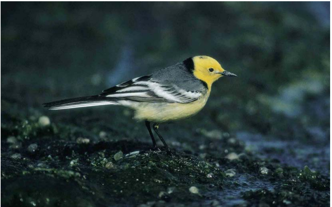
98 Citrine Wagtail / Citroenkwikstaart Motacilla citreola , male, Eilat, Israel, 12 March 1999 (Arie Ouwerkerk)

On 18 March, the first Pallas's Gull Larus ichthyaetus for Belgium was an adult photographed during its three minutes stay at Gullegem, West-Vlaanderen. The first Grey-headed Gull L cirrocephalus for Egypt was an adult winter reported on 7 February at Nabaq in the southern Sinai. If accepted, an adult Armenian Gull L armenicus at Siracusa dump, Sicily, Italy, on 2 March will be the second for Italy. In Ireland, at least three first-winter and two adult American Herring Gulls L smithsonianus were present during March at Killybegs, Donegal; also in March, at the same site, at least three Kumlien's Gulls L glaucoides kumlieni were seen. The third, fourth and fifth Caspian Terns Sterna caspia for the Cape Verde Islands were reported between 21 February and 14 March on Boavista, off Raso, and on São Vicente, respectively. A first-winter Forster's Tern