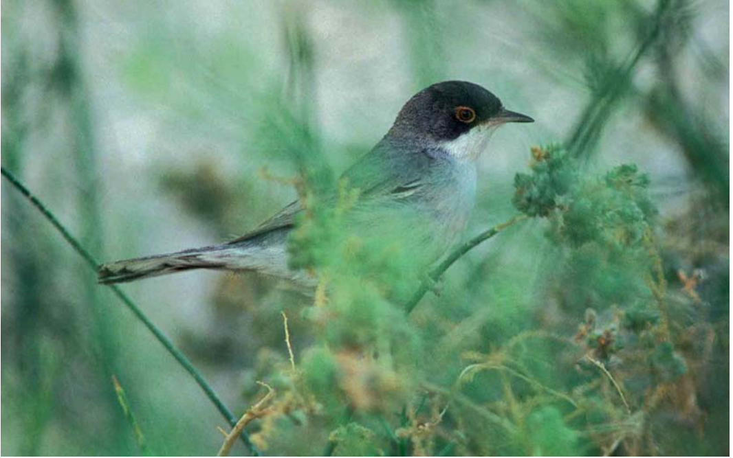
90 Ménétries's Warbler / Ménétries' Zwartkop Sylvia mystacea , Kibbutz Lothan, Israel, 2 April 1999 (René van Rossum) 91 White-tailed Lapwing / Witstaartkievit Vanellus leucurus , Yotvata, Israel, 21 March 1999 (Alex Wieland) 92 Oriental Skylark / Kleine Veldleeuwerik Alauda gulgula , Yotvata, Israel, 21 March 1999 (Alex Wieland)