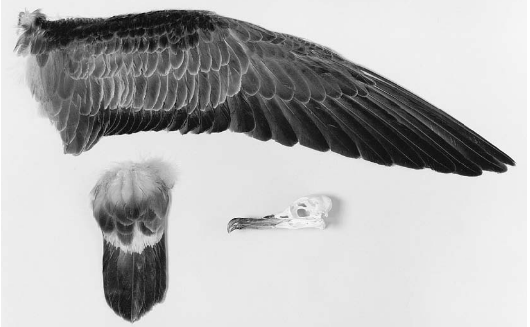
59 Great Shearwater / Grote Pijlstormvogel Puffinus gravis , second-calendar year (wing, tail and skull of bird found beached at Petten, Noord-Holland, on 23 February 1997), Zoölogisch Museum Amsterdam, Amsterdam, Noord-Holland (Louis A van der Laan) 60 Pied-billed Grebe / Dikbekfuut Podilymbus podiceps , adult, Akersloot, Noord-Holland, April 1997 (Hans Gebuis) 61 Pied-billed Grebe / Dikbekfuut Podilymbus podiceps , adult, Akersloot, Noord-Holland, April 1997 (Jan van Holten)