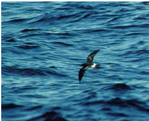
88-89 Madeiran Storm-petrel / Madeirastormvogeltje Oceanodroma castro, off Salvage Islands, August 1997