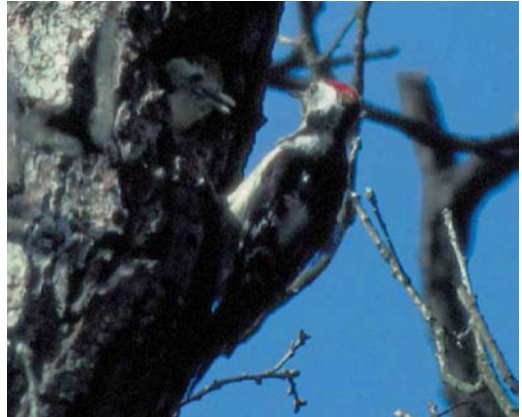
66 Middle Spotted Woodpeckers / Middelste Bonte Spechten Dendrocopos medius , Posterholt, Ambt Montfort, Limburg, June 1997 (Jan van Holten)