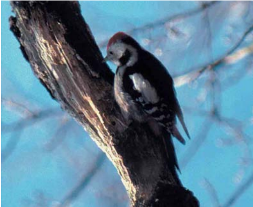
65 Middle Spotted Woodpecker / Middelste Bonte Specht Dendrocopos medius , Elzetterbos, Epen, Wittem, Limburg, 22 maart 1997 (Karel Lemmens)