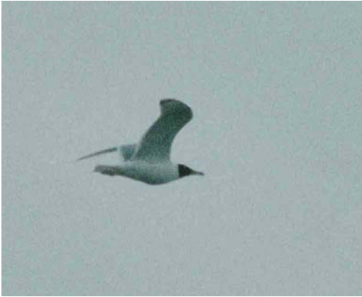
101 Reuzenzwartkopmeeuw / Pallas's Gull Larus ichthyaetus , adult, Gullegem, West-Vlaanderen, 18 maart 1999 (Nicolas Selosse)