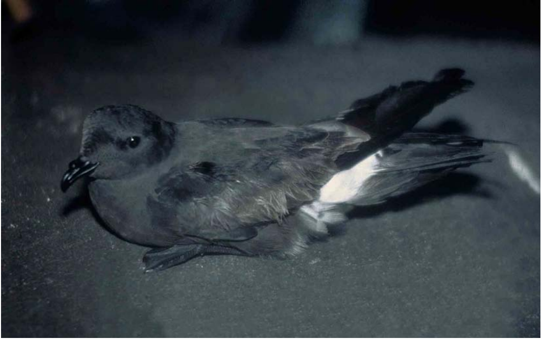
87 Madeiran Storm-petrel / Madeirastormvogeltje Oceanodroma castro , Furna Roques, Ilhas Desertas, Madeira, September 1996 (Manuela Nunes)

birds ringed in one season were recaptured in the same season in a subsequent year whereas only two possible interchanges between hot- and cool-season populations were noted. The brood-patch scores of the latter two individuals suggested that they were non-breeders (Monteiro & Furness 1998).