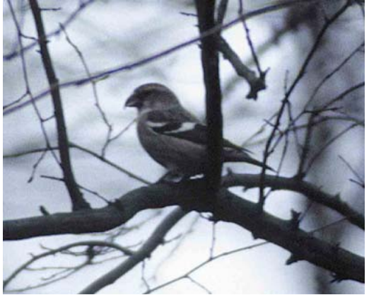
81 Two-barred Crossbills / Witbandkruisbekken Loxia leucoptera bifasciata , female, Kuinderbos, Flevoland, 14 December 1997 (Sietse Bernardus)

Common Crossbills by Robert Keizer at Kwinteloijen, Rhenen, Utrecht.