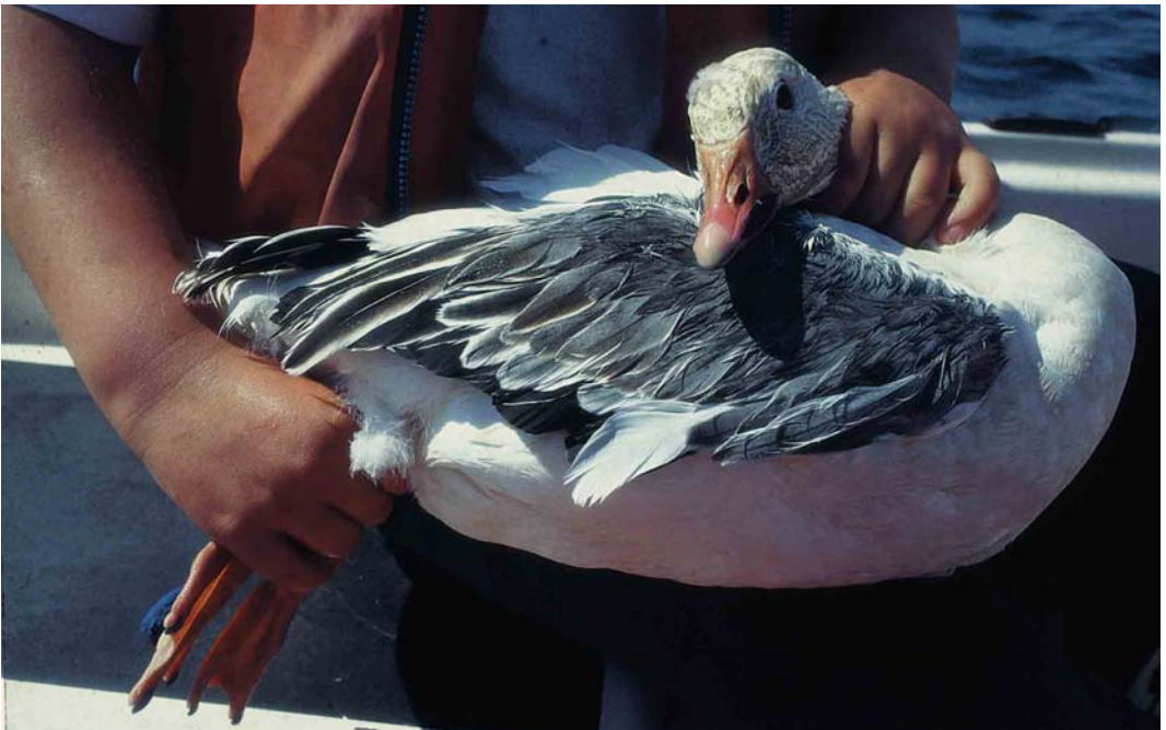
85 Sneeuwgans / Snow Goose Anser caerulescens , Smålø, Trondheim, Noorwegen, 13 juli 1997 (Yngve Lystad)

Van 18 tot 26 april 1980 bevonden zich 18 Sneeuwgansen (13 witte en één blauwe adult en vier onvolwassen) bij Andijk, Noord-Holland. Eén van de witte vogels was geringd; deze bleek in 1977 als kuiken te zijn geringd in La Pérouse Bay, Manitoba, Canada. Het betrof een mannetje Kleine Sneeuwgans (Blankert 1980). Samen met een aantal recente terugmeldingen van in Noord-Amerika gehalsringde canadese ganzen Branta canadensis parvipes/B hutchinsii uit Ierland en