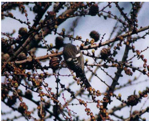
82 Two-barred Crossbill / Witbandkruisbek Loxia leucoptera bifasciata , female, Heide van Duurswoude, Friesland, 14 March 1998 (Oane Tol)