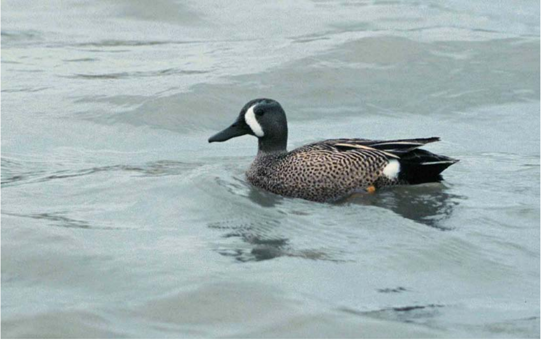
56 Blue-winged Teal / Blauwvleugeltaling Anas discors , adult male, Oostvaardersplassen, Flevoland, April 1997 (Ruud E Brouwer) 57 Whistling Swan / Fluitzwaan Cygnus columbianus with Bewick's Swan / Kleine Zwaan C. bewickii , Anloo, Drenthe, 28 December 1997 (Jan van Holten) 58 Greenland White-fronted Goose / Groenlandse Kolgans Anser albifrons flavirostris , Doniaburen, Friesland, 9 November 1997 (Arnoud B van den Berg)