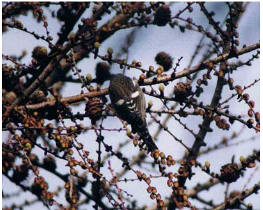
82 Two-barred Crossbill / Witbandkruisbek Loxia leucoptera bifasciata , female, Heide van Duurswoude, Friesland, 14 March 1998 (Oane Tol)