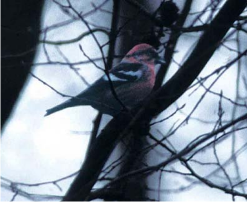
80 Two-barred Crossbill / Witbandkruisbek Loxia leucoptera bifasciata , male, Kuinderbos, Flevoland, 14 December 1997