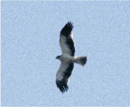
62 Booted Eagle / Dwergarend Hieraaetus pennatus , pale morph, Beek-Ubbergen, Gelderland, 17 July 1996 (Ward Hagemeyer)