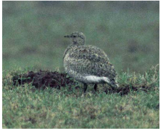
63 Little Bustard / Kleine Trap Tetrax tetrax , immature male, Etersheim, Zeevang, Noord-Holland, 8 March 1997