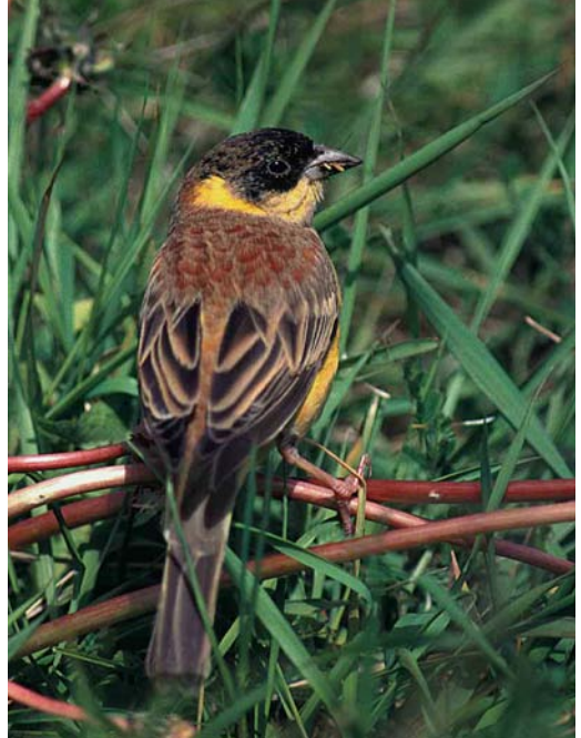
77 Black-headed Bunting / Zwartkopgors Emberiza melanocephala , first-summer male, Den Helder , Noord-Holland, 5 May 1997

Hutchins's Canada Goose Branta hutchinsii hutchinsii 3 March, Brakel , Gelderland, five (description does not