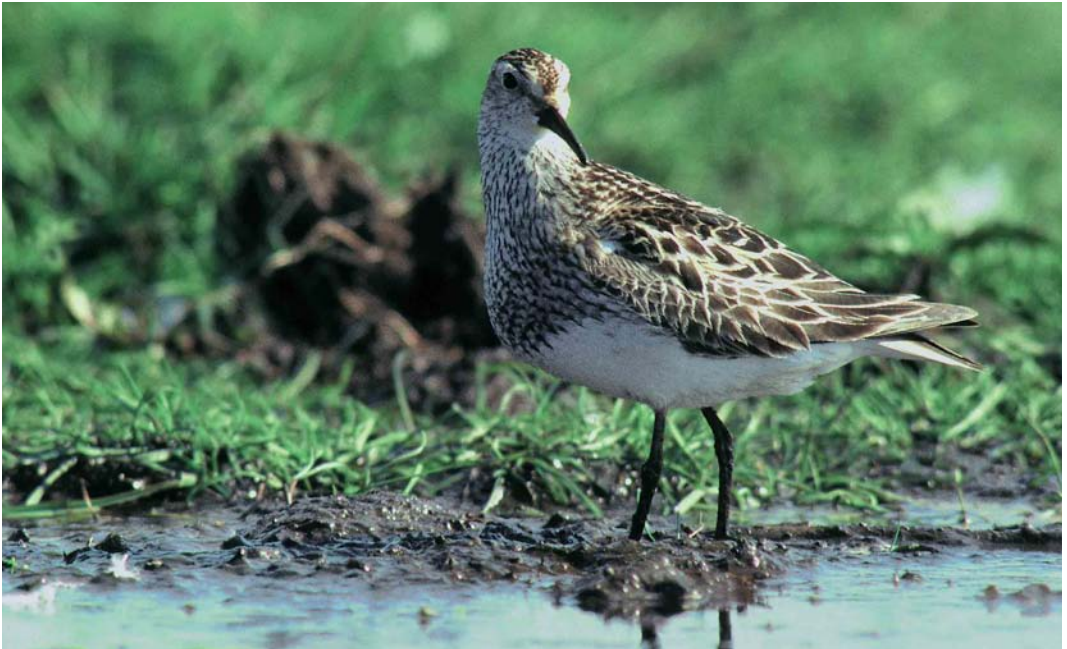
64 Pectoral Sandpiper / Gestreepte Strandloper Calidris melanotos , adult, Wormer- en Jisperveld, Noord-Holland, 10 July 1997 (Jan van der Geld)

The first, but in retrospect the second record for the Netherlands, concerned a confiding individual which took up residence in the city of Groningen, for obvious reasons close to a McDonald's restaurant. After thorough study of the moult of the Groningen individual, several observers demanded review of the rejected 1993 record which was documented by a number of (poor-quality) photographs. One of the reasons for rejection of that record were the very short primaries, but CDNA now has decided that this can well be attributed to moult. Therefore, the Harderwijk record becomes the first.