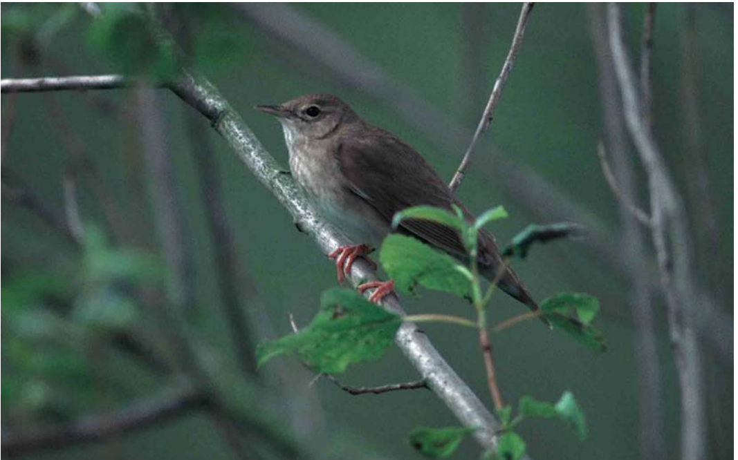
74 River Warbler / Krekelzanger Locustella fluviatilis , Pampushout, Flevoland, May 1997