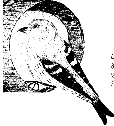
Loxia leucoptera ♂ ad., 21.08.97 Willemsduin / Schiermonnikoog