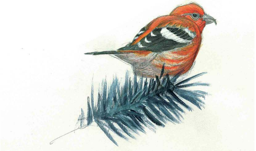
FIGURE 3 Two-barred Crossbill / Witbandkruisbek Loxia leucoptera bifasciata , male, Noordhollands Duinreservaat, Bakkum, Noord-Holland, 15 March 1998