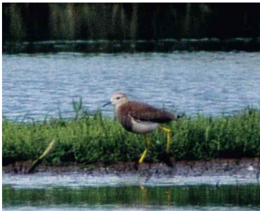
250 Witstaartkievit / White-tailed Lapwing Vanellus leucurus , adult, Zeebrugge, West-Vlaanderen, 15 juli 1999 (Filip De Ruwe)