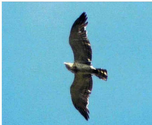
251 Slangenarend / Short-toed Eagle Circaetus gallicus , Ben-Ahin, Liège, 2 juli 1999 (Johan Buckens)

Harelbeke op 30 juli. Op acht waarnemingsplaatsen werden in totaal 25 Ooievaars Ciconia geteld, met als maximum zes over Dessel-Retie, Antwerpen, op 26 juli. Er waren waarnemingen van Rode Wouwen Milvus milvus te Brecht (1 juni); te Bredene (30 juli); te Kuringen-Hasselt, Limburg (31 juli); te Muizen, Antwerpen (29 juli); en in de Uitkerkse Polders (31 juli). Op 23 juni vloog een (of de) Slangenarend Circaetus gallicus over het Schietveld te Brecht, op 30 juni verbleef hij op het Klein Schietveld te Brasschaat, Antwerpen, en op 9 en 10 juli verscheen hij weer kortstondig te Brecht. Verrassend genoeg was in de Steengroeve te Ben-Ahin, Liège, van 6 juni tot 11 juli een zeer bleek exemplaar aanwezig dat vaak zeer goed (en ook in zit) te zien was. Nog een andere pleisterde vermoedelijk reeds vanaf mei te Helchteren-Meeuwen, Limburg, en was daar in elk geval op 11 juli nog present. Op 17 juni werd te Rulles, Luxembourg, een laag overvliegende, lichte Dwergarend Hieraetus pennatus waargenomen. Telkens één Visarend Pandion haliaetus werd gemeld te Belzele, Evergem, Oost-Vlaanderen, op 5 juni; te Willebroek op 10 juni en 27 juli; over de Kalkense Meersen, Oost-Vlaanderen, op 15 juni; en te Neerpelt, Limburg, op 10 juli. Eerste-zomer mannetjes Roodpootvalk Falco vespertinus vlogen op 1 juni over de Kalmthoutse Heide, Antwerpen, op 26 juni over Bredene, en op 10 juli over Hensies, Hainaut.