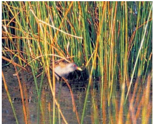
245 Kleine Vliegenvanger / Red-breasted Flycatcher Ficedula parva , onvolwassen mannetje, Epen, Limburg, juni 1999 246 Bonapartes Strandloper / White-rumped Sandpiper Calidris fuscicollis , adult, Den Oever, Noord-Holland, 5 augustus 1999 247 Witwangsterns / Whiskered Terns Chlidonias hybridus met jong, Soerendonks Goor, Noord-Brabant, 3 juli 1999 248 Klein Waterhoen / Little Crane Porzana parva , mannetje, Kampina, Noord-Brabant, 14 juni 1999

waren er de gehele periode in de Oostvaardersplassen en omgeving (maximaal vier), op 11 juni bij Wageningen, Gelderland, op 18 en 19 juni bij Alphen aan den Rijn, op 27 juni bij Bleskensgraaf, Zuid-Holland, op 4 juli bij Hazerswoude, Zuid-Holland, en op 24 juli bij Gouderak, Zuid-Holland. In totaal werden 19 Zwarte Ooievaars Ciconia nigra waargenomen, waarvan het merendeel in juli. De grootste groep Ooievaars C. ciconia die gemeld werd omvatte 26 exemplaren en vloog op 29 juli over Kampen, Overijssel. Zomerse Zwarte Vrouwen Milvus migrans werden gezien op 3 juni bij Gulpen, Limburg, op 5 juni in de Marnewaard, Groningen, op 13 juni over de Kampina en op 31 juli langs Huisduinen, Noord-Holland. Tot de eerste dagen van juni werden nog enkele Rode Vrouwen M. milvus vastgesteld en vanaf eind juni alweer 10. Ook dit jaar liet de Lammergier Gypaetus barbatus niet verstek gaan; op 25 juli vloog