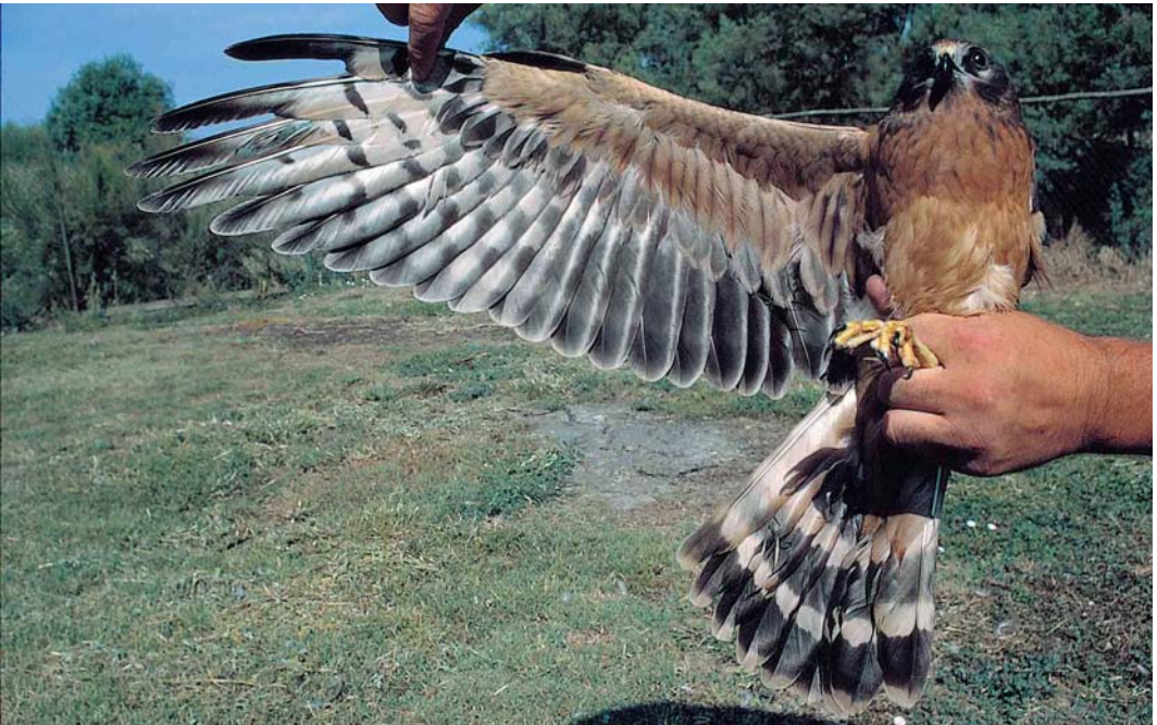
200 Montagu's Harrier / Grauwe Kiekendief Circus pygargus , juvenile female, Valli di Ferrara, Italy, September 1996