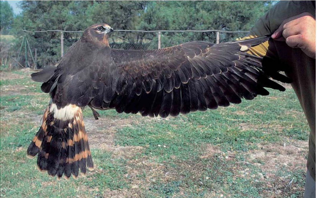
199 Montagu's Harrier / Grauwe Kiekendief Circus pygargus , juvenile female, Valli di Ferrara, Italy, September 1996 (Maurizio Azzolini & Andrea Corso)