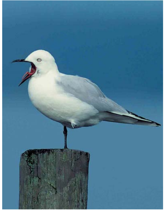
225 Red-billed Gull / Roodsnavelmeeuw Larus scopulinus , New Zealand, January 1997 (Theo Roersma) 226 Black-billed Gull / Zwartsnavelmeeuw Larus bulleri , New Zealand, January 1997 (Theo Roersma) 227 King Gull / Hartlaubs Meeuw Larus hartlaubii , Namibia, 30 March 1999 (Arnoud B van den Berg)