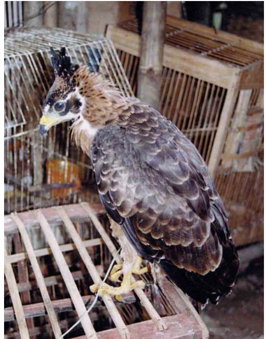
203-204 Javan Crested Honey Buzzard / Javaanse Wespendif Pernis ptilorhyncus ptilorhyncus , juvenile, roadside bird market between Pelabuhanratu and Bogor, West Java, Indonesia, 16 October 1995 (Rona Dennis) 205 Javan Crested Honey Buzzard / Javaanse Wespendif Pernis ptilorhyncus ptilorhyncus , adult, Taman Safari Zoo, Cisarua, West Java, Indonesia, 10 December 1994 (Bas van Balen) 206 Javan Hawk-eagle / Javaanse Havikarend Spizaetus bartelsi , immature, Taman Safari Zoo, Cisarua, West Java, Indonesia, 10 December 1994 (Bas van Balen)