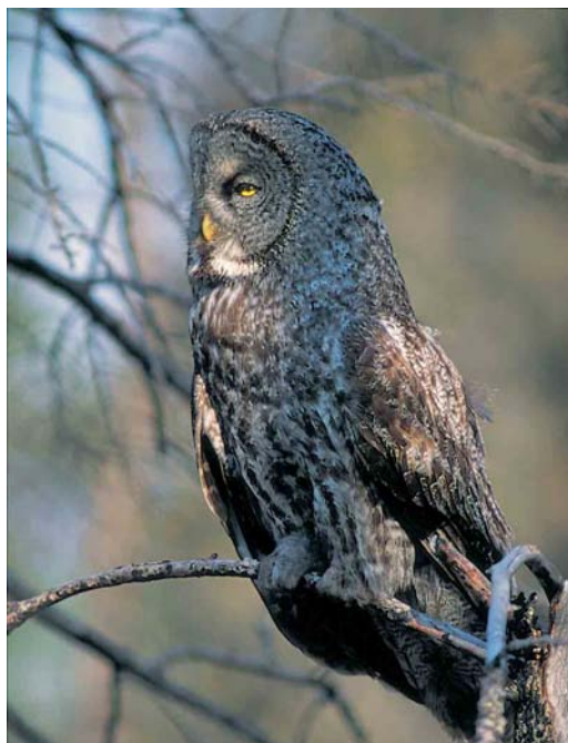
218 American Hawk Owl / Amerikaanse Sperweruil Surnia ulula caparoch , Churchill, Manitoba, Canada, June 1994 (Chris Schenk) 219 Great Grey Owl / Laplanduil Strix nebulosa , Churchill, Manitoba, Canada, June 1994 (Chris Schenk) 220 Bonaparte's Gull / Kleine Kokmeeuw Larus philadelphia , Churchill, Manitoba, Canada, June 1996 (Chris Schenk)