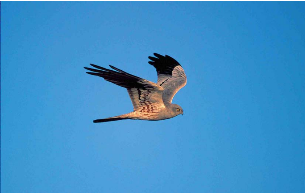
242 Grauwe Kiekendief / Montagu's Harrier Circus pygargus , mannetje, Flevoland, mei 1999 243 Koereiger / Cattle Egret Bubulcus ibis , adult, Meers, Limburg, 10 juli 1999 244 Baardgrasmus / Subalpine Warbler Sylvia cantillans , mannetje, Berkheide, Wassenaar, Zuid-Holland, 18 juli 1999