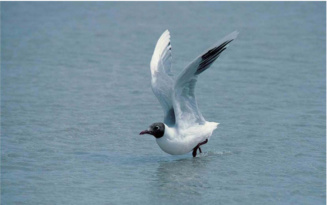
223 Brown-hooded Gull / Patagonische Kokmeeuw Larus maculipennis , Falkland Islands, December 1990 (René Pop)