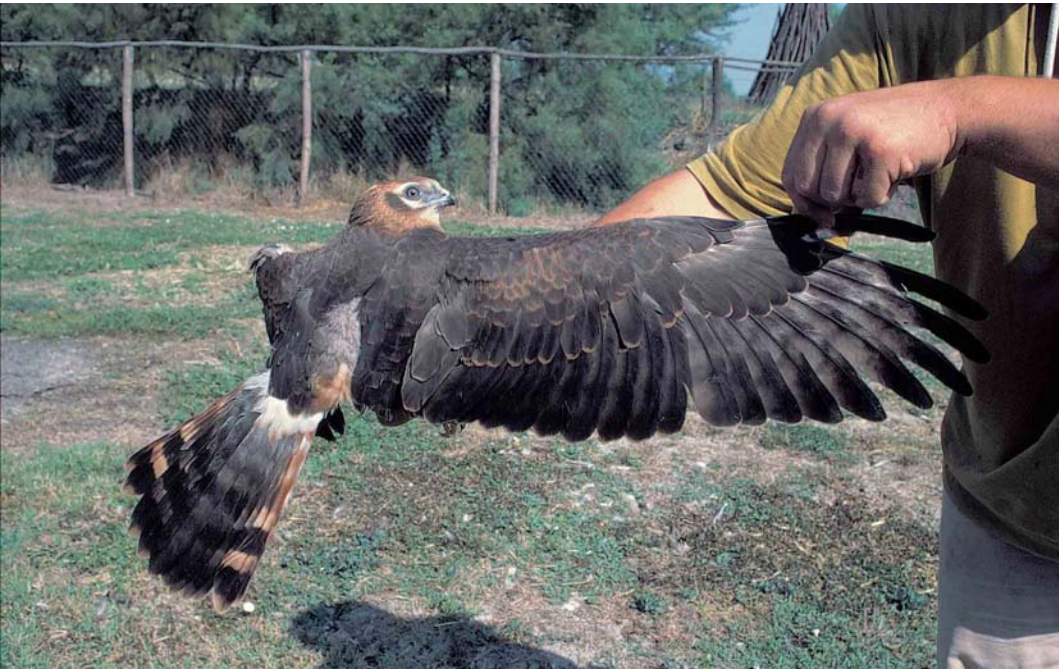
201 Montagu's Harrier / Grauwe Kiekendief Circus pygargus , juvenile male, Valli di Ferrara, Italy, September 1996 (Maurizio Azzolini & Andrea Corso)