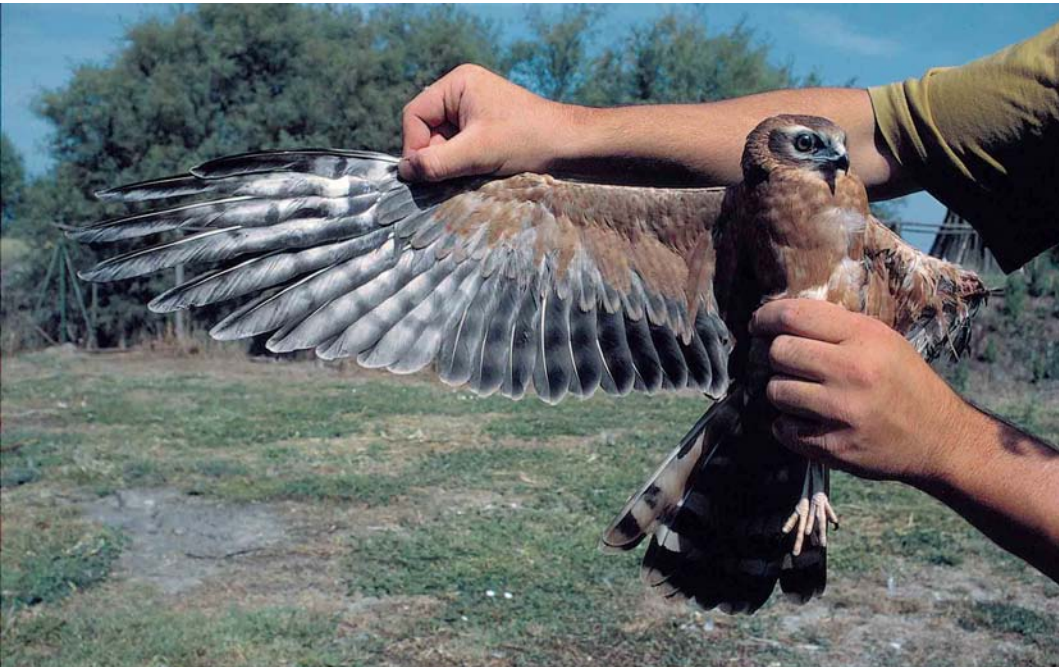
202 Montagu's Harrier / Grauwe Kiekendief Circus pygargus , juvenile male, Valli di Ferrara, Italy, September 1996 (Maurizio Azzolini & Andrea Corso)