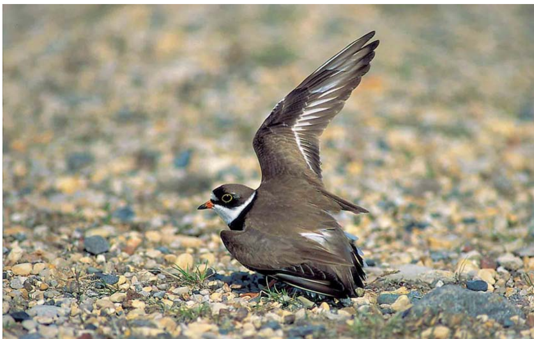
215 Semipalmated Plover / Amerikaanse Bontbekplevier Charadrius semipalmatus , Churchill, Manitoba, Canada, June 1994