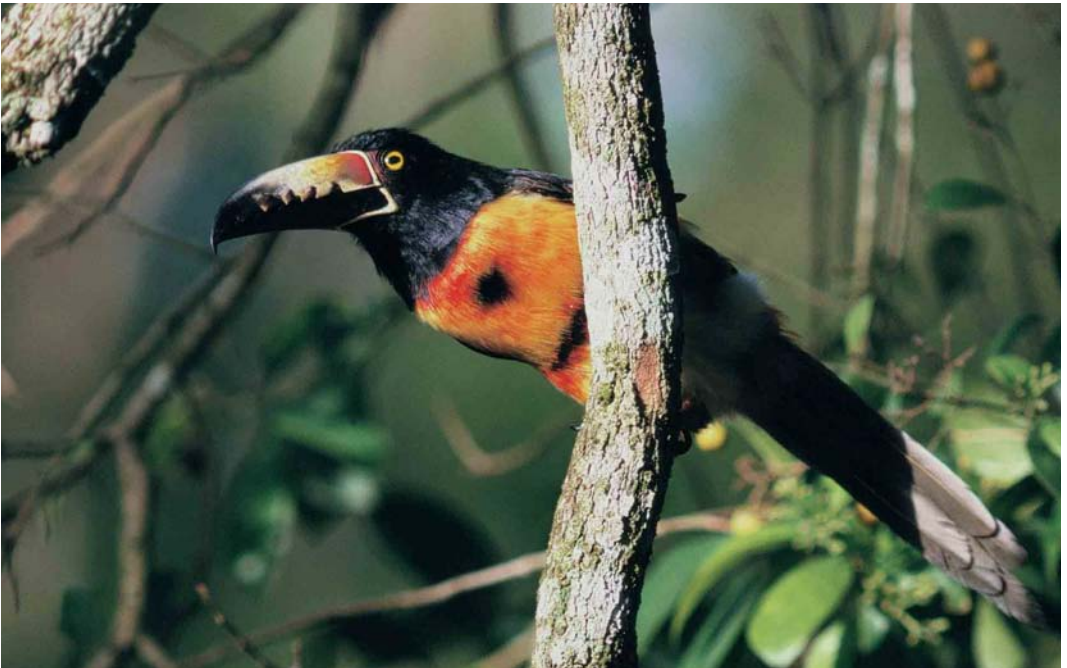
363 Collared Aracari / Halsbandarassari Pteroglossus torquatus , Tikal, Guatemala, 15 August 1998