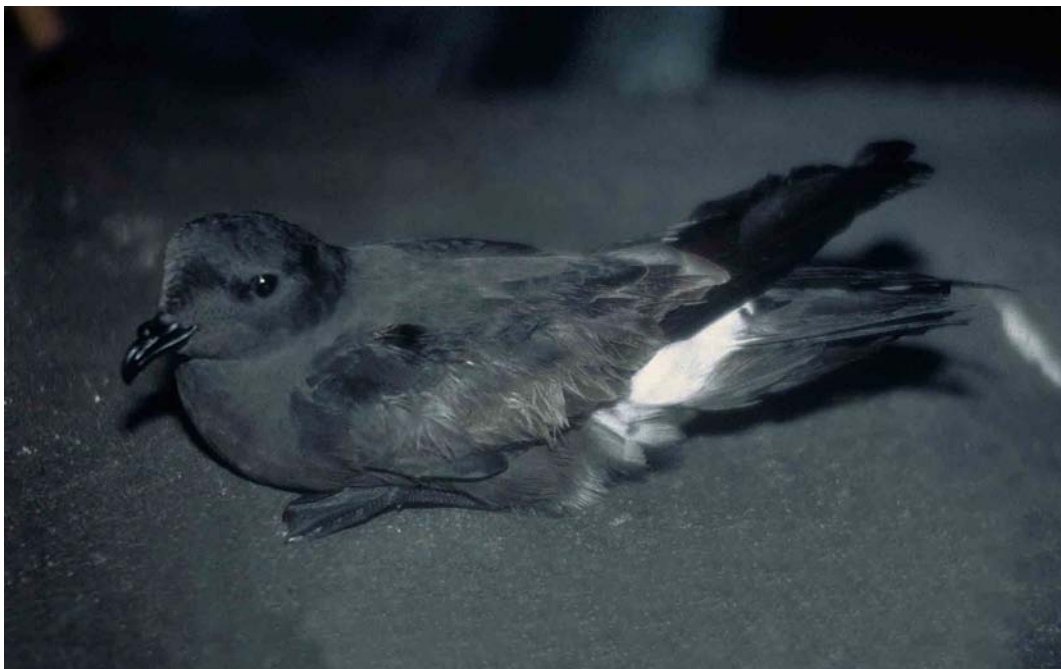
87 Madeiran Storm-petrel / Madeirastormvogeltje Oceanodroma castro , Furna Roques, Ilhas Desertas, Madeira, September 1996 (Manuela Nunes)

birds ringed in one season were recaptured in the same season in a subsequent year whereas only two possible interchanges between hot- and cool-season populations were noted. The brood-patch scores of the latter two individuals suggested that they were non-breeders (Monteiro & Furness 1998).