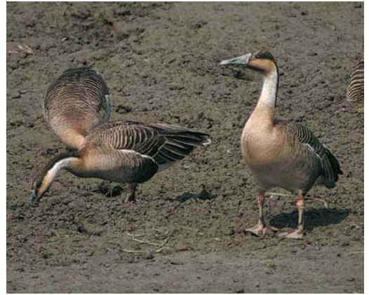
192 Black-faced Spoonbills / Kleine Lepelaars Platalea minor , Kanghwa Island, Kyunggi Province, South Korea, September 1998 ( Jeong-Hwa Seo ) 193 Oriental Storks / Zwartsnavelooievaars Ciconia boyciana , Ch'ŏn-su Bay, South Chungcheong Province, South Korea, December 1995 ( Jeong-Hwa Seo ) 194 Nordmann's Greenshanks / Nordmanns Groenpootruiters Tringa guttifer , Yongjong Island, Kyunggi Province, South Korea, September 1994 ( Jin-Young Park ) 195 Chinese Egret / Chinese Zilverreiger Egretta eulophotes , Yeonpyung Island, Kyunggi Province, South Korea, May 2000 ( Jeong-Hwa Seo ) 196 Swan Geese / Zwaanganzen Anser cygnoides , Imjin River, Kyunggi Province, South Korea, November 1995 ( Jin-Young Park )