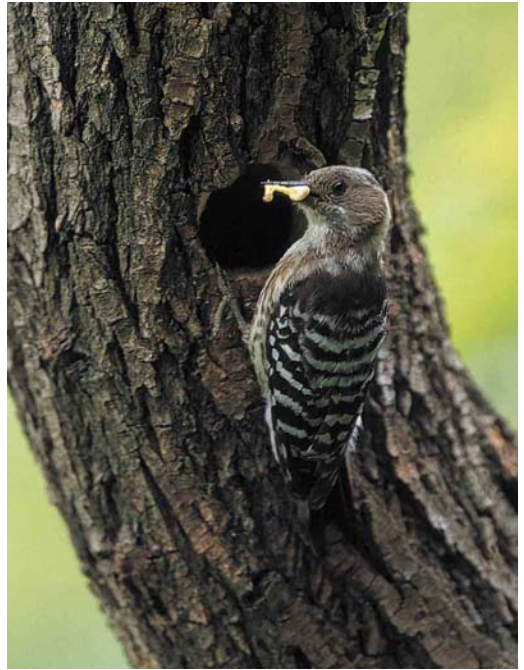
201 Chinese Penduline Tit / Chinese Buidelmees Remiz (pendulinus) consobrinus , Keum Estuary, North Cholla Province, South Korea, March 1994 ( Jin-Young Park ) 202 Japanese Pygmy Woodpecker / Kizukispecht Dendrocopos kizuki , Toechon, Kyunggi Province, South Korea, May 1995 ( Jeong-Hwa Seo ) 203 Varied Tit / Bonte Mees Parus varius , Kwangnung Forest, Kyunggi Province, South Korea, February 1994 ( Jeong-Hwa Seo )