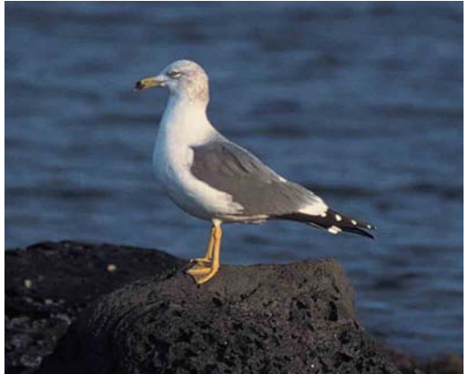
197 Saunders's Gull / Saunders' Meeuw Larus saundersi , immature, Keum Estuary, North Cholla Province, South Korea, January 1999 (Jeong-Hwa Seo) 198 Relict Gull / Relictmeeuw Larus relictus , Nakdong Estuary, South Kyungsang Province, South Korea, February 1993 (Jin-Young Park) 199 Mongolian Gull / Mongoolse Meeuw Larus cachinnans mongolicus , adult, Naksan Beach near Sokcho, Kangwon Province, South Korea, December 1998 (Jin-Young Park) 200 Black-tailed Gull / Japanese Meeuw Larus crassirostris , Ch'ön-su, South Korea, late September 1996 (Nick Lethaby)

(DMZ). There is a large souvenir store and restaurant here, with an open rooftop where you can scan for birds – a telescope is essential. Since the DMZ has few inhabitants, it attracts many wintering raptors and wildfowl, along with small numbers of cranes. Imjingak and the freeway that runs south-west from here along the south side of the Imjin River and then the north bank of the Han River are good places to look for these species. Birding around here is a bit 'hit or miss' but there are usually some good birds to see on each visit.