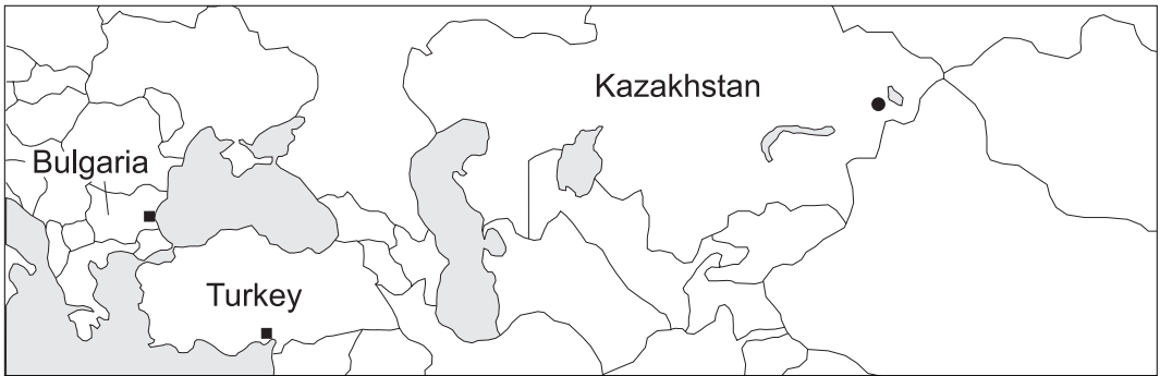
FIGURE 1 Ringing site in Kazakhstan (dot) and (possible) recovery sites in Bulgaria and Turkey (squares) of Relict Gulls / Relictmeeuwen Larus relictus

Relict Gull has been present here for a long time. E F Rodionov, when studying the egg collection of A A Sludsky, discovered two eggs of this species (labelled as ' Larus melanocephalus ') which had been collected on 21 May 1931 at Lake Alakol' near Rybal'noye (now Rybach'ye). Their measurements were 61.8 x 45.2 and 59.6 x 42.7 mm, respectively. In 1931, M D Zverev reportedly ringed four pulli of Mew Gull L canus at Lake Alakol', a species which has, however, never nested here (Dolgushin 1962). Presumably, these were pulli of Relict Gull.