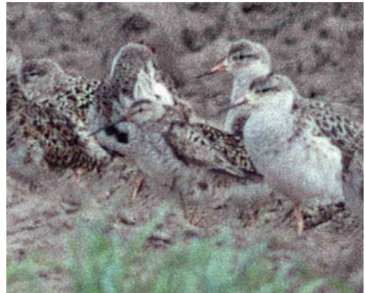
226 Oriental Turtle Dove / Oosterse Tortel Streptopelia orientalis , Bühr, Germany, 1 June 2000 ( Daniel Kratzer ) 227 Little Swift / Huisgierzwaluw Apus affinis , Bolonia, Andalucía, Spain, 29 July 2000 ( Diederik Kok ) 228 Semipalmated Sandpiper / Grijze Strandloper Calidris pusilla , Vistula mouth, Gdąnsk, Poland, 20 July 2000 ( Piotr Zielinski ) 229 Stilt Sandpiper / Steltstrandloper Micropalama himantopus , adult, with Ruffs / Kemphanen Philomachus pugnax , 't Zand, Noord-Holland, Netherlands, 23 July 2000 ( Sietse Bernardus )

SHEATHBILLS TO TERNS A Pale-faced Sheathbill Chionis alba in the south-western tip of South Africa at The Boulders, Simon's Town, Cape Province, during August was almost certainly ship-assisted (like the ones in Down, Northern Ireland, in December 1892 and in Devon, England, in September 1982). On the Hortobágy, Hungary, three Parasitic Jaegers Stercorarius parasiticus were seen during 1-3 August. An adult winter Pallas's Gull Larus ichthyaetus was on the Hortobágy from 23 August onwards. On 23 July, the third Laughing Gull L. atricilla for the Netherlands was an adult reported at Rutbekerveld, Overijssel, and possibly the same bird was seen on 13-16 August along the Rhine at Arnhem, Gelderland. In France, one stayed from 28 August onwards on Ile de Ré. On the same island, a first-summer Bonaparte's Gull L. philadelphia was present from at least 21 July to 23 August and an adult occurred at Saint-Brévin, Loire-Atlantique, France, on