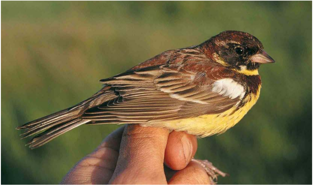
167 Yellow-breasted Bunting / Wilgengors Emberiza aureola aureola , second-summer male, Liminka, Finland, June 1996 (Jari Peltomäki). Second-summer males often have pale supercilium behind eye, black ear-coverts mixed with some brown feathers, some white feathers on black throat, buff fringes to mantle-feathers and trace of pale median crown-stripe 168 Yellow-breasted Bunting / Wilgengors Emberiza aureola aureola , first-summer male, Liminka, Finland, June 1995 (Jari Peltomäki). First-summer males can be superficially similar in plumage to adult females. Note however chestnut colour on rump, crown, nape and sides of breast and also blackish feathers on throat and ear-coverts, typical of males. Heavily worn rectrices and remiges, especially tertials, typical of first-summer birds