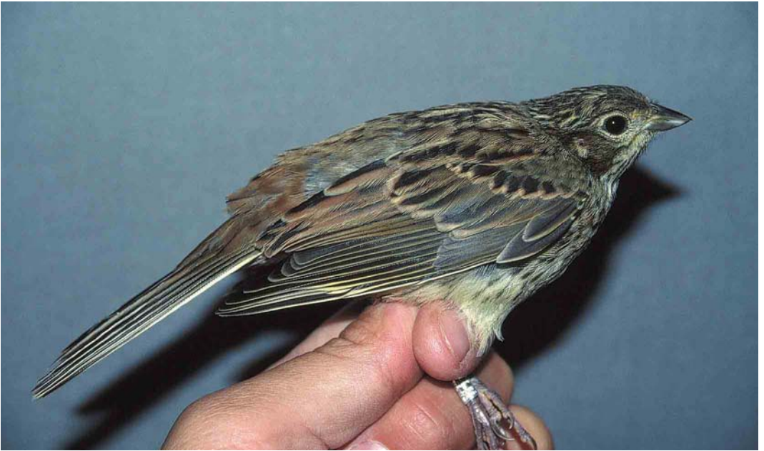
184 Yellowhammer / Geelgors Emberiza citrinella , juvenile, Liminka, Finland, August 1993 (Jari Peltomäki). Note bluish-grey lower mandible, absence of supercilium, yellow edges to primaries and long tail with lot of white on outer rectrices

moult until halfway on autumn migration at stop-over sites in China (for details, see Byers et al 1995). E a ornata strongly resembles E a aureola in plumage but shows some subtle differences, mainly in adult male plumage. In adult male E a ornata , the black of the head covers the forehead and extends to above the eye, the upperparts are darker and the sides of the breast are streaked blackish rather than brownish; the underparts are, on average, brighter yellow. In female E a ornata , the plumage is brighter and the sides of the breast tend to be more heavily streaked in comparison with E a aureola (Cramp & Perrins 1994, Byers et al 1995).