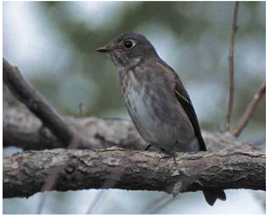
204 Yellow-rumped Flycatcher / Driekleurenvliegenvanger Ficedula zanthopygia , male, Chilbal Island, South Cholla Province, South Korea, May 2000 ( Jeong-Hwa Seo ) 205 Yellow-rumped Flycatcher / Driekleurenvliegenvanger Ficedula zanthopygia , female, Baekryong Island, Kyunggi Province, South Korea, May 1992 ( Jin-Young Park ) 206 Mugimaki Flycatcher / Mugimakivliegenvanger Ficedula mugimaki , female, Chilbal Island, South Cholla Province, South Korea, May 1999 ( Jeong-Hwa Seo ) 207 Dark-sided Flycatcher / Roetvliegenvanger Muscicapa sibirica , Kanghwa Island, South Korea, late September 1996 ( Nick Lethaby )

star attraction. This flock feeds just after dawn in the rice fields but typically spends much of the day in the salt-marsh or on the tidal flats. The mudflats hold over 1000 Saunders's Gulls and 15 000 Common Shelducks. The reedbeds and rice fields hold Chinese Penduline Tits and numerous buntings including Pallas's Reed, Common Reed, Yellow-throated, Little E pusilla , Rustic, Black-faced E spodocephala and Chestnut-eared Buntings E fucata .