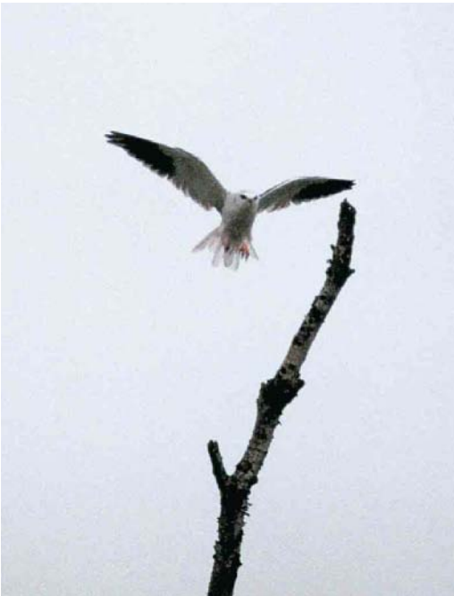
223 Black-winged Kite / Grijze Wouw Elanus caeruleus , Meerstalblok, Drenthe, Netherlands, 28 July 2000