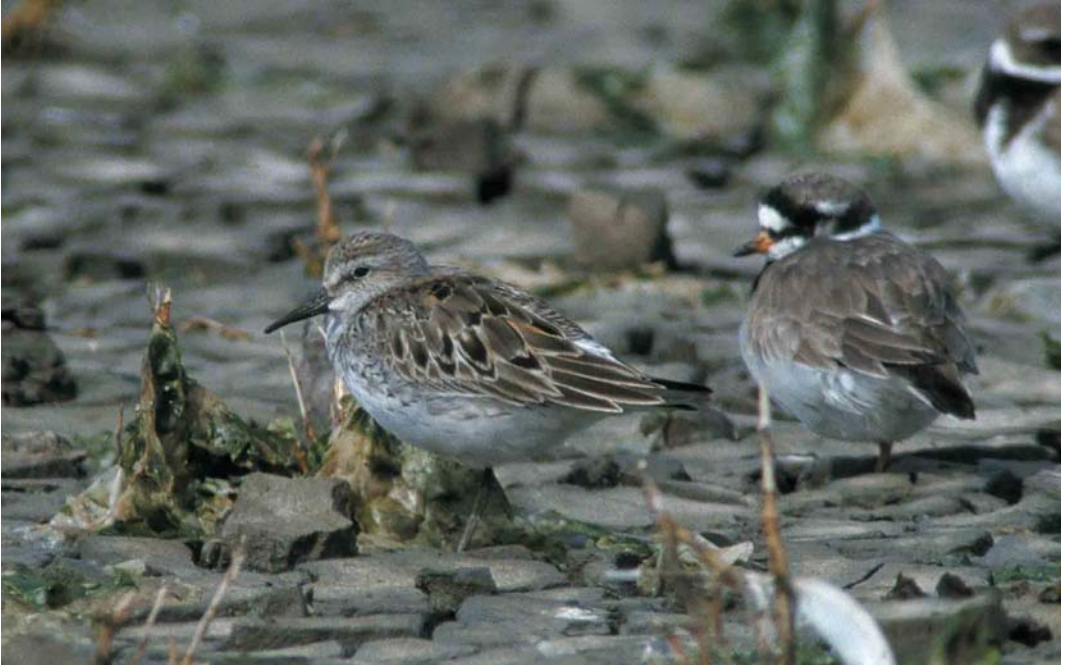
238 Bonapartes Strandloper / White-rumped Sandpiper Calidris fuscicollis , adult, met Bontbekplevier / Common Ringed Plover Charadrius hiaticula , Zwarte Haan, Friesland, 20 augustus 2000 (Roef Mulder)