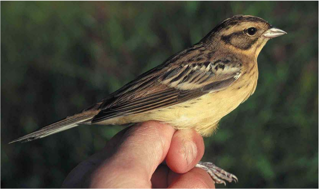
173 Yellow-breasted Bunting / Wilgengors Emberiza aureola aureola , juvenile, Liminka, Finland, July 1993 ( Jari Peltomäki ). Strongly marked individual with obvious dark framing on ear-coverts and lot of white on median wing-coverts. Strong unstreaked supercilium and yellow area on sides of neck below ear-coverts typical of Yellow-breasted Bunting 174 Chestnut Bunting / Rosse Gors Emberiza rutila , female, Mai Po, Hong Kong, China, November 1992 ( Jari Peltomäki ). Note really plain looking face with pale eye-ring standing out obviously. Wing-bars indistinct and unstreaked rump showing obvious deep chestnut colour