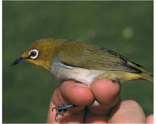
216 Chestnut-flanked White-eye / Roodflankbrilvogel Zosterops erythropleurus , Kadoorie Farm and Botanic Garden, Hong Kong, China, November 1999 (Paul J Leader). Note pale pinkish base to lower mandible, rather broad eye-ring, diffusely dark lores and relatively small throat patch 217 Japanese White-eye / Japanese Brilvogel Zosterops japonicus simplex , Mai Po, Hong Kong, China, 11 September 1999 (Paul J Leader). Note greyish-blue base to lower mandible, relatively bright iris, solid-black lores and relatively large throat patch 218 Japanese White-eye / Japanese Brilvogel Zosterops japonicus simplex , Kadoorie Farm and Botanic Garden, Hong Kong, China, 14 November 1999 (Paul J Leader). Note dull greyish-brown iris 219 Japanese White-eye / Japanese Brilvogel Zosterops japonicus simplex , Mai Po, Hong Kong, China, 11 September 1999 (Paul J Leader). Note distinctly grey side of breast, and relatively pale flank