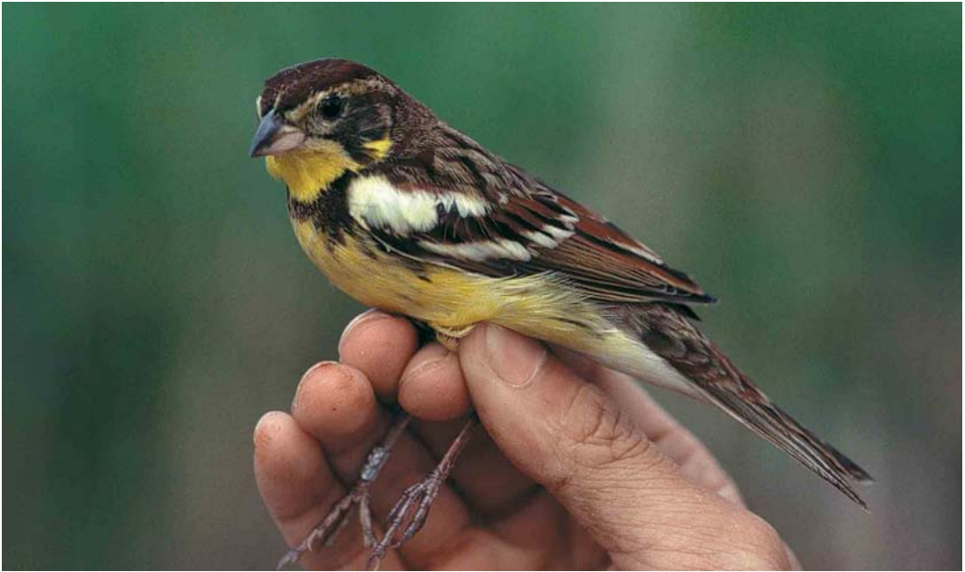
185 Yellow-breasted Bunting / Wilgengors Emberiza aureola , presumably of subspecies E a ornata , male, Mai Po, Hong Kong, China, 5 April 1988 (Ray Tipper). Black sides of breast suggesting E a ornata . Ageing difficult because of peculiar combination of adult-looking wing with lot of white and restricted black on face and chin more typical of immature 186 Yellow-breasted Bunting / Wilgengors Emberiza aureola , presumably of subspecies E a ornata , male, Tsim Bei Tsui, Hong Kong, China, 10 May 1986 (Ray Tipper). Note extensive black forehead, dark upperparts and blackish sides of breast and streaks on flanks, indicating E a ornata . Wing-bars fully covered by flank-feathers 187 Yellow-breasted Bunting / Wilgengors Emberiza aureola , presumably of subspecies E a ornata , female, Tsim Bei Tsui, Hong Kong, China, 10 May 1986 (Ray Tipper). Female E a ornata hardly separable from E a aureola but underparts slightly brighter coloured in E a ornata