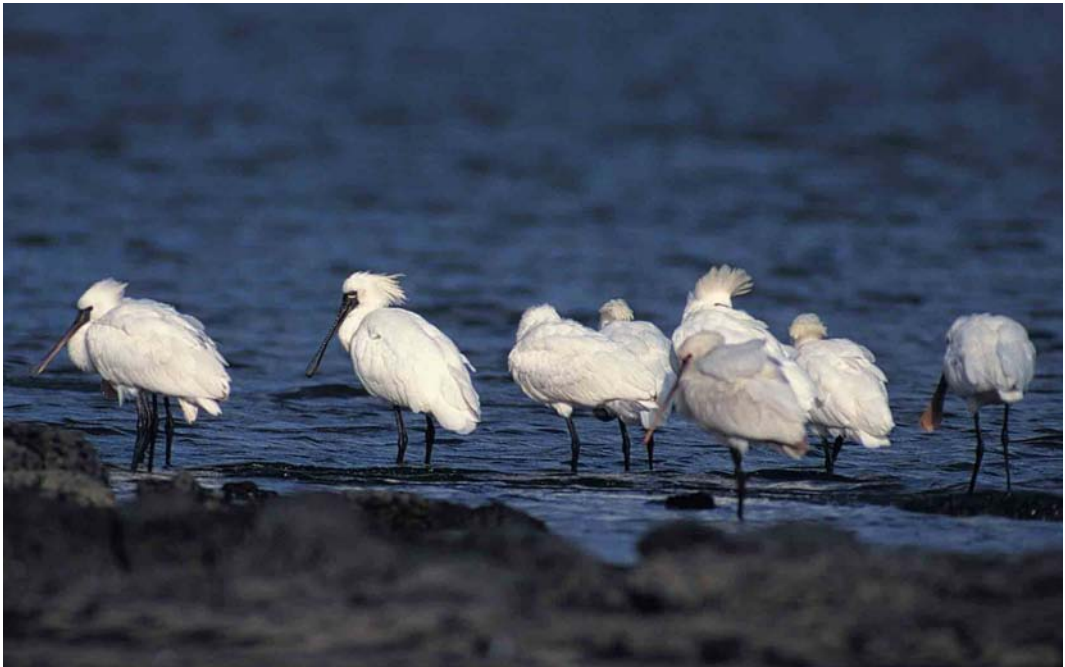
191 Black-faced Spoonbills / Kleine Lepelaars Platalea minor with Eurasian Spoonbill / Lepelaar P leucorodia , Jeju Island, South Korea, March 1997 (Jin-Young Park)

During migration, the mudflats attract very large numbers of shorebirds. The peak periods are from mid-April to mid-May and from early August to October. These concentrations are best viewed at Yocha-ri or Sonduri or by driving along the south-west coast of the island – scanning for birds or trying out small farm roads to