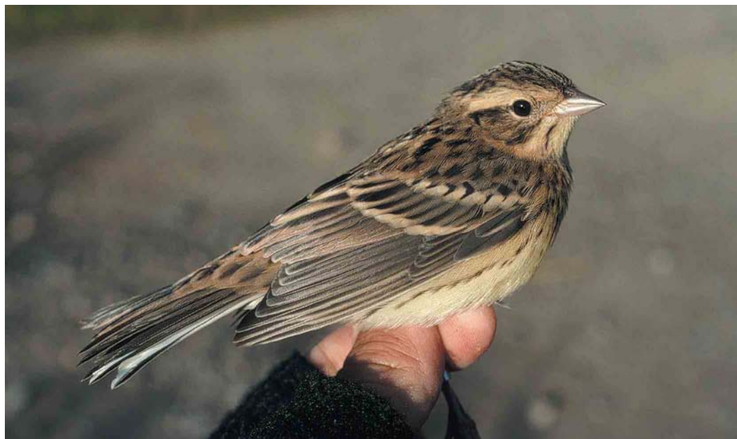
179 Yellow-breasted Bunting / Wilgengors Emberiza aureola aureola , juvenile, Liminka, Finland, July 1993 ( Jari Peltomäki ). Sometimes presence of buffish colour on tip to median and greater wing-coverts making wing-bars less distinctive. Note white outer rectrices 180 Chestnut Bunting / Rosse Gors Emberiza rutila , juvenile, Beidaihe, Hebei, China, September 1992 ( Jari Peltomäki ). Compare with juvenile Yellowhammer E citrinella in plate 184