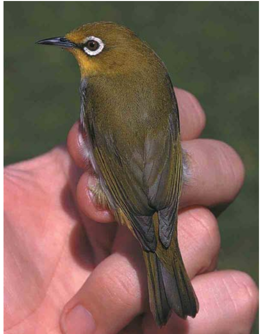
213 Japanese White-eye / Japanse Brilvogel Zosterops japonicus simplex , Mai Po, Hong Kong, China, 11 September 1999 (Paul J Leader). Note short primary projection and pronounced contrast between yellow throat and green side of head