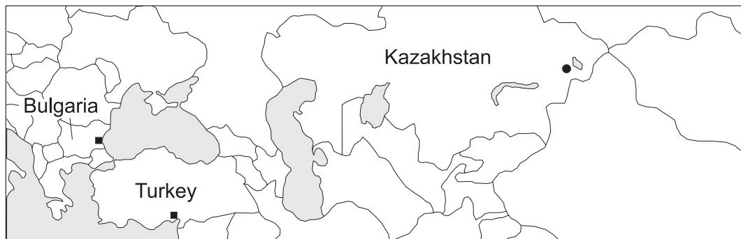
FIGURE 1 Ringing site in Kazakhstan (dot) and (possible) recovery sites in Bulgaria and Turkey (squares) of Relict Gulls / Relictmeeuwen Larus relictus

Relict Gull has been present here for a long time. E F Rodionov, when studying the egg collection of A A Sludsky, discovered two eggs of this species (labelled as ' Larus melanocephalus ') which had been collected on 21 May 1931 at Lake Alakol' near Rybal'noye (now Rybach'ye). Their measurements were 61.8 x 45.2 and 59.6 x 42.7 mm, respectively. In 1931, M D Zverev reportedly ringed four pulli of Mew Gull L canus at Lake Alakol', a species which has, however, never nested here (Dolgushin 1962). Presumably, these were pulli of Relict Gull.