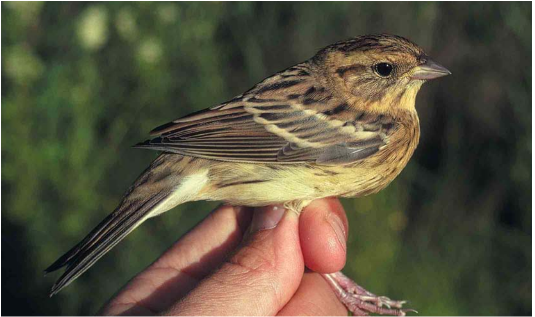
176 Yellow-breasted Bunting / Wilgengors Emberiza aureola aureola , juvenile, Liminka, Finland, July 1993 ( Jari Peltomäki ). Poorly marked individual with dark eye-stripe just behind eye and no moustachial stripe, giving plain-faced look to ear-covert area. Differs from adult female primarily by fresh plumage (adult female has worn plumage at this time of year) and by pointed dark centre of median wing-coverts 176 Chestnut Bunting / Rosse Gors Emberiza rutila , juvenile, Beidaihe, Hebei, China, September 1992 ( Jari Peltomäki ). Ear-coverts without dark framing and supercilium and sides of neck streaked. Wing-bars brownish, less obvious than in Yellow-breasted Bunting E aureola . Note also some chestnut colour on crown and ear-coverts