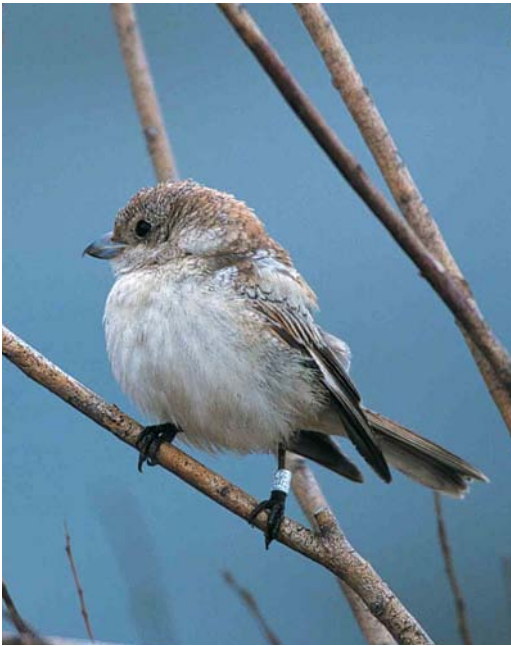
248 Roodkopklauwier / Woodchat Shrike Lanius senator , juveniel, Heist, West-Vlaanderen, 25 augustus 2000

beesten daar...? De eerste Pontische Meeuwen Larus cachinnans cachinnans doken op te Hensies-Pomeroeul van 26 juli tot 24 augustus (adult) en te Zeebrugge van 20 tot 27 augustus (eerste-winter). Op 3 augustus vloog een adulte Lachstern Gelochelidon nilotica over Het Zwin te Knokke; daar werden er op 10 augustus twee gezien. Op 11 augustus foerageerde er één boven het Kempisch Kanaal te Schoten, Antwerpen. De enige twee Reuzensterns Sterna caspia voor de periode trokken op 21 augustus langs Zeebrugge. Op 2 juli werd nog een Witwangstern Chlidonias hybridus opgemerkt te Longchamps, Namur, en op 11 juli één te Schoten. Twee juveniele Witvleugelsterns C leucopterus verbleven op 27 augustus kortstondig bij Tienen.