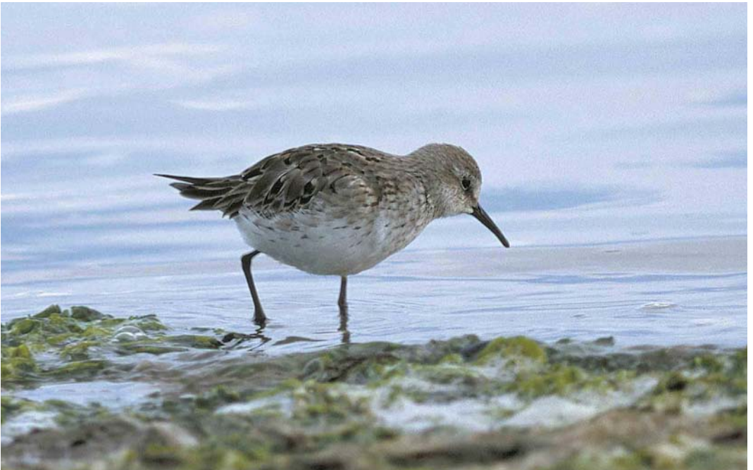
239 Bonapartes Strandloper / White-rumped Sandpiper Calidris fuscicollis , adult, Zeeburg, Texel, Noord-Holland, 2 september 2000