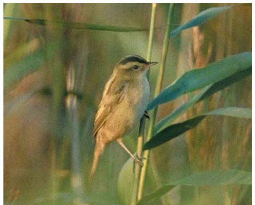
240 Ralreiger / Squacco Heron Ardeola ralloides , Egmond-Binnen, Noord-Holland, 8 juni 2000 (Cees Baart) cf Dutch Birding 22: 174, 2000 241 Steppiekievit / Sociable Lapwing Vanellus gregarius , Oosterwolde, Gelderland, 6 augustus 2000 (Eric Koops) 242-243 Steltstrandloper / Stilt Sandpiper Micropalama himantopus , adult, Sint Maartenszee, Noord-Holland, 23 juli 2000 (Teus J C Luijendijk) 244 Grasvanger / Zitting Cisticola Cisticola juncidis , Ooltgensplaat, Zuid-Holland, 27 juni 2000 (Marten van Dijl) 245 Waterrietzanger / Aquatic Warbler Acrocephalus paludicola , Westplaat, Zuid-Holland, 8 augustus 2000 (Marten van Dijl)