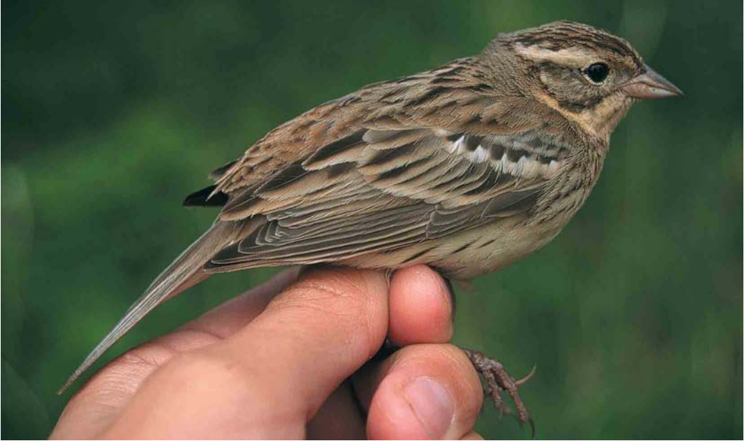
169 Yellow-breasted Bunting / Wilgengors Emberiza aureola aureola , adult female, Liminka, Finland, June 1993 (Jari Peltomäki). Adult females can be quite brightly coloured. There is some chestnut colour on rump and sides of breast and median wing-coverts show prominent white tips. Note relatively fresh remiges, especially tertials. Short primary projection typical of Yellow-breasted Bunting 170 Chestnut Bunting / Rosse Gors Emberiza rutila , adult male, Happy Island, Beidaihe, Hebei, China, May 1993 (David Tipling/Windrush). Males on spring migration are unmistakable