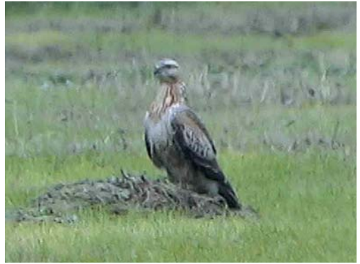
250-251 Arendbuizerd / Long-legged Buzzard Buteo rufinus , juveniel, Praamweg, Flevoland, 9 september 2000

verluidt al vanaf 1 september aanwezig. Overigens werd deze laatste in zeldzaamheid overtroefd door de eveneens die dag nabij Oosterend aanwezige Kleine Spotvogel Acrocephalus caligatus . De Grauwe Fitis van IJmuiden was op 10 september nog steeds aanwezig en die van Schiermonnikoog werd op 11 september – nadat er een aantral dagen niet op de plek gezocht was – opnieuw gemeld door Justin Jansen, ditmaal ook zingend.