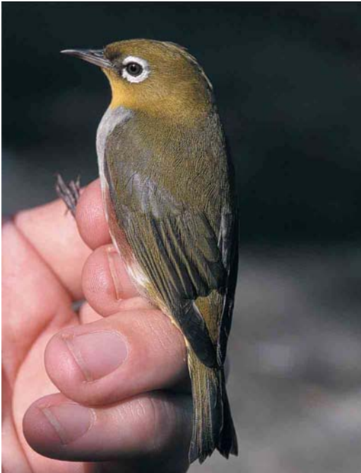
212 Chestnut-flanked White-eye / Roodflankbrilvogel Zosterops erythropleurus , Kadoorie Farm and Botanic Garden, Hong Kong, China, November 1999. Note long primary projection and diffuse contrast between yellow throat and green side of head