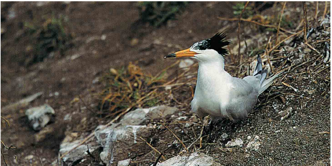
249 Chinese Crested Tern / Chinese Kuifstern Sterna bernsteini , Matsu, Taiwan, summer 2000

Op 4 september ontdekte Enno Ebels een exemplaar in de Kobbbeduinen op Schiermonnikoog, Friesland. De volgende ochtend werden al vroeg twee vogels ontdekt: één door Sander Bot op de westpunt van de Stuifdijk van de Maasvlakte, Zuid-Holland, en één door Roy Slaterus in de Kunstenaarsduintjes bij IJmuiden, Noord-Holland. Beide vogels riepen niet alleen maar zongen ook met enige regelmaat. Rond de middag bleek ook de vogel op Schiermonnikoog nog aanwezig te zijn. Later in de middag maakte Arie Ouwerkerk het kwartet voor die dag vol met de waarneming van een exemplaar bij Oosterend op Terschelling, Friesland. Deze laatste vogel was naar