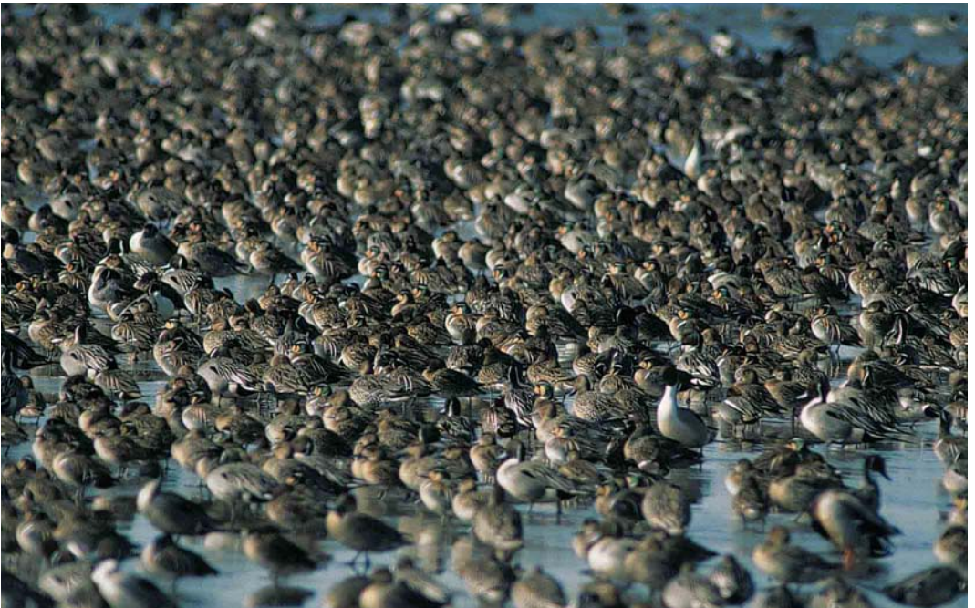
188 Baikal Teals / Siberische Talingen Anas formosa with Northern Pintails / Pijlstaarten A acuta , Ch'ön-su (Lake A), South Korea, 26 February 2000

South Korea's climate is somewhat extreme, especially away from the south coast. Summers are hot and humid but most rain is confined to