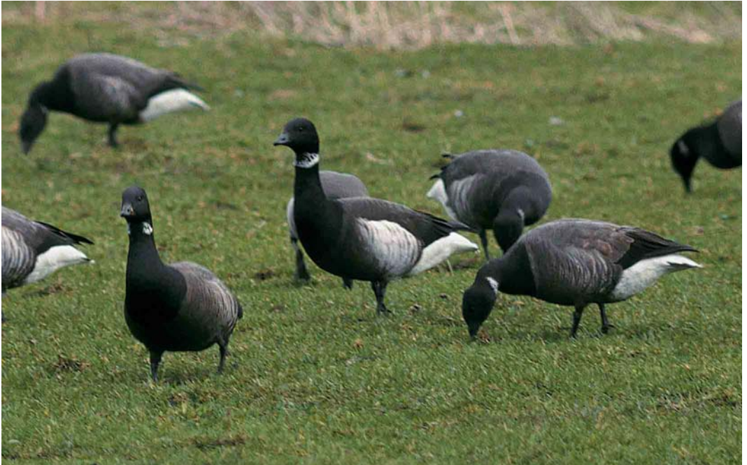
128 Zwarte Rotgans / Black Brant Branta nigricans , adult, met Rotganzen / Dark-bellied Brent Geese B. bernicla , Huisduinen, Noord-Holland, 21 februari 2001