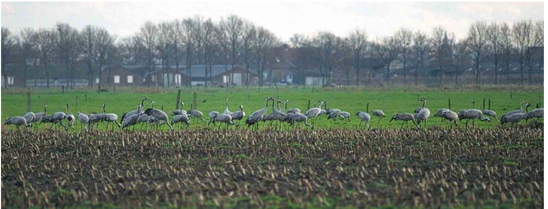
132 Koningseider / King Eider Somateria spectabilis , tweede-winter mannetje, Texel, Noord-Holland, 1 januari 2001 (Ruud E Brouwer) 133 Huiskraai / House Crow Corvus splendens , Renesse, Zeeland, 5 februari 2001 (Arnoud B van den Berg) 134 Ringsnavelmeeuw / Ring-billed Gull Larus delawarensis , adult winter, Goes, Zeeland, 7 januari 2001 (Peter L Meininger) 135 Koereiger / Cattle Egret Bubulcus ibis , Mariapolder, Wissenkerke, Zeeland, 20 januari 2001 (Gerwin Geertse) 136 Kraanvogels / Common Cranes Grus grus , Nederweert, Limburg, 8 december 2000 (Max Berlijn)