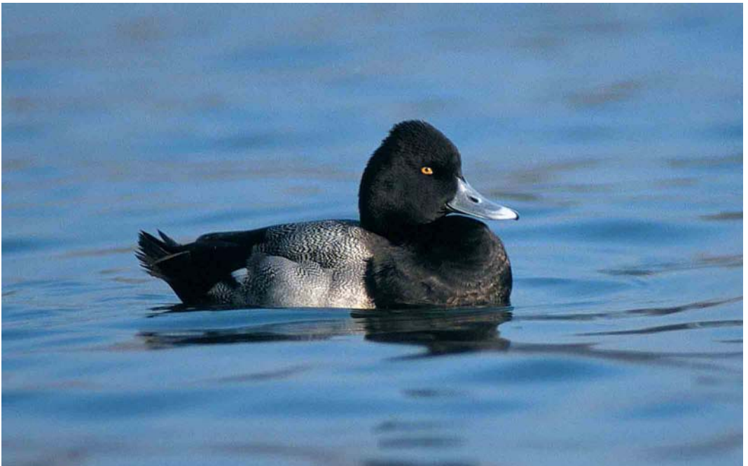
114 Lesser Scaup / Kleine Topper Aythya affinis , male, Huningue, Haut-Rhin, France, 14 January 2001 (Raffael Aye)