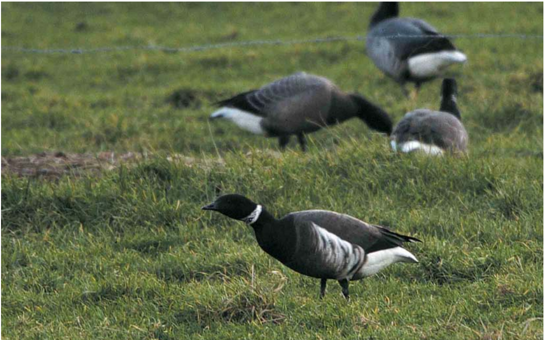
129 Zwarte Rotgans / Black Brant Branta nigricans , adult, met Rotganzen / Dark-bellied Brent Geese B. bernicla , Scharendijke, Zeeland, 7 januari 2001 (Jan van Holten)