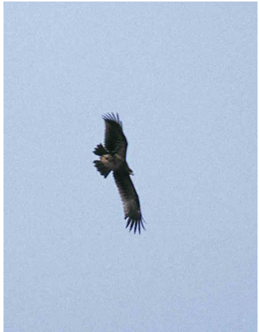
143-144 Bastaardarend / Greater Spotted Eagle Aquila clanga , juveniel, Alphen aan den Rijn, Zuid-Holland, 24 januari 2001 (Marten van Dijk)

gende Bastaardarend ontdekt, maar liefst de zesde waarneming van de soort sinds november 2000, wederom in het Lauwersmeergebied. Sietse Bernardus en Edwin de Weerd waren na een zoekactie voor een mogelijke – jawel – Bastaardarend bij Nieuwe Bildzijl, Friesland (die de volgende dag waarschijnlijk een Ruigpootbuiserd B lagopus bleek te zijn), op zoek naar wat ganzen in de Anjumerkolken, Friesland. Bij stom toeval ontdekten zij hier alsnog een Bastaardarend, wederom een juveniele. Deze vogel bleef tot in maart 2001 aanwezig in het Lauwersmeergebied, zowel aan de Groningse als de Friese kant, en is daarmee de langst verblijvende tot nu toe en bovendien de derde voor dit gebied.