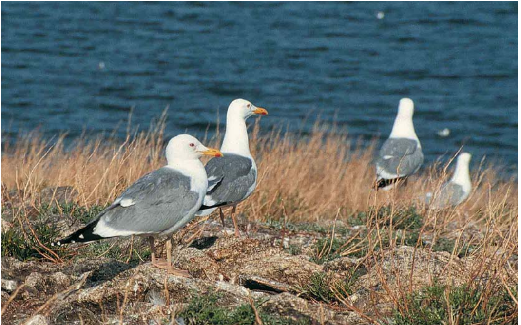
88 Mongolian Gulls / Mongoolse Meeuwen Larus (cachinnans) mongolicus , Maloye More, north-western Lake Baikal, Siberia, Russia, June 1992. Note that incidence of light influences perception of mantle colour