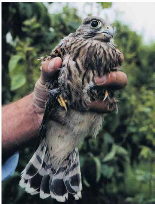
107 Common Kestrel / Torenvalk Falco tinnunculus , 27-day-old juvenile, Kapelle, Zeeland, Netherlands, 24 June 2000

However, the accompanying photograph demonstrates that even this character is not always decisive. It depicts a 27-day-old juvenile Common Kestrel, ringed as one of four fledglings at Kapelle, Zeeland, the Netherlands, on 24 June 2000. The central claw on both feet is very pale,