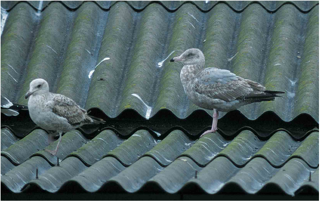
185 American Herring Gull / Amerikaanse Zilvermeeuw Larus smithsonianus , second-winter, Douro river, Portugal, 30 March 2001