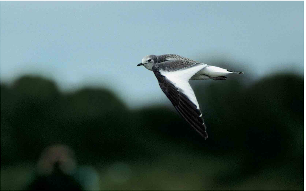
156 Sabine's Gull / Vorkstaartmeeuw Larus sabini , juvenile, Cork, Ireland, September 1984 (Anthony McGeehan)