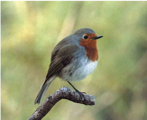
166 Tenerife Robin / Teneriferoodborst Erithacus superbis , Genoves, Tenerife, Canary Islands, February 1998 (Hans-Heiner Bergmann). Note dark throat and breast