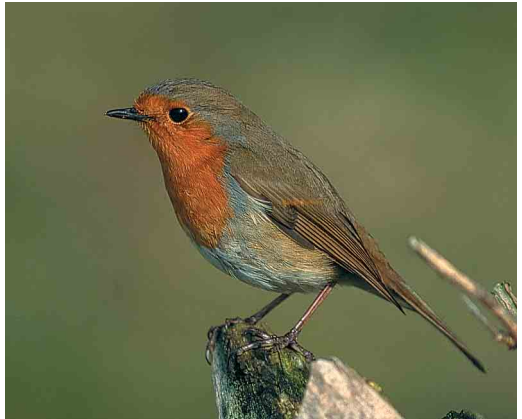
167 European Robin / Roodborst Erithacus rubecula , Kobbeduinen, Schiermonnikoog, Friesland, Netherlands, 27 March 1998 (Arnoud B van den Berg)

had not been preceded by songs of superbus as done by Stock & Bergmann (1988).