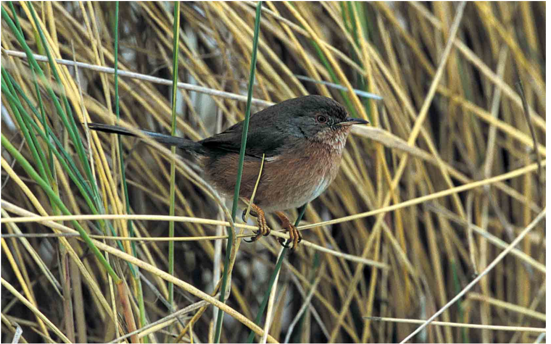
188 Provençaalse Grasmus / Dartford Warbler Sylvia undata , Maasvlakte, Zuid-Holland, 25 maart 2001 (Jan van Holten)