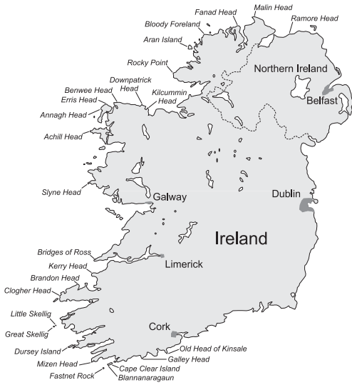
FIGURE 1 Seawatching sites in Ireland

much superior west coast sites and is only worth visiting in 'classic' north-westerly conditions. The best seawatch spot is beside a concrete life-belt stand reached by following the obvious coastal path around the headland.