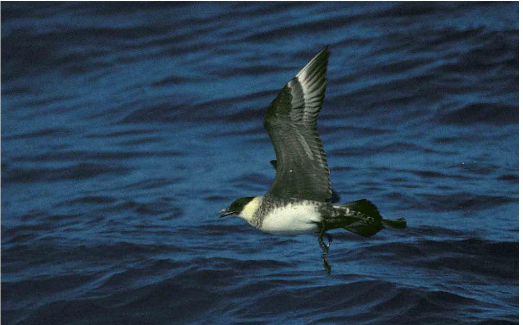
157 Pomarine Jaeger / Middelste Jager Stercorarius pomarinus , adult, off western Ireland, July 1993 (Anthony McGeehan)