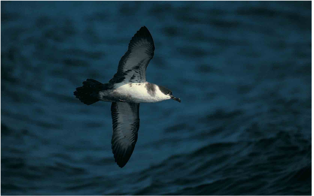
154 Great Shearwater / Grote Pijlstormvogel Puffinus gravis , off south-western Ireland, September 1991 (Anthony McGeehan)