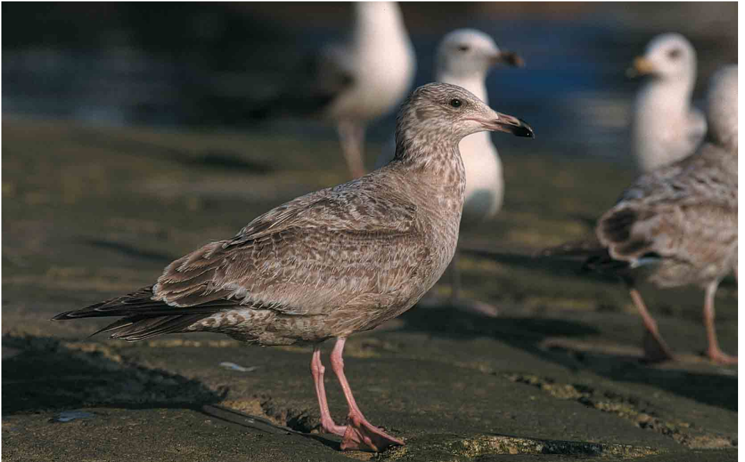
186 American Herring Gull / Amerikaanse Zilvermeeuw Larus smithsonianus , juvenile, Matosinhos, Portugal, 1 April 2001