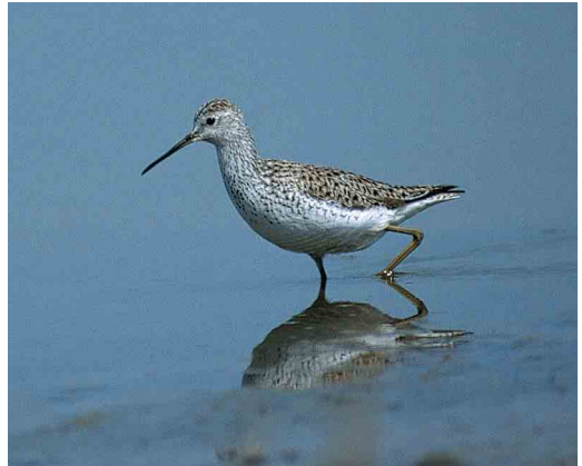
195 Poelruiter / Marsh Sandpiper Tringa stagnatilis , Longchamps, Namur, 22 april 2001

HOPPEN TOT GORZEN Op 17 april verbleef een Hop Upupa epops op Blokkersdijk, Antwerpen, en op 27 april werd er één opgemerkt bij De Panne. De eerste Draaihals Jynx torquilla werd op 28 april gezien bij Antwerpen. Duinpiepers Anthus campestris werden