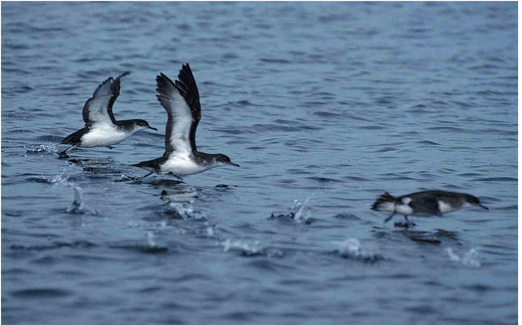
155 Manx Shearwaters / Noordse Pijlstormvogels Puffinus puffinus , Irish Sea, August 1996 (Anthony McGeehan)