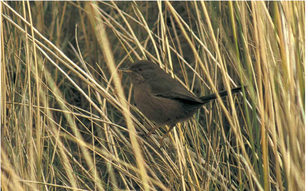
189 Provençaalse Grasmus / Dartford Warbler Sylvia undata , Maasvlakte, Zuid-Holland, 24 maart 2001 (Harm Niesen)