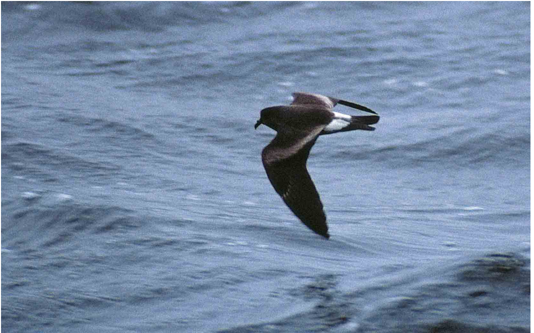
147 Leach's Storm-petrel / Vaal Stormvogeltje Oceanodroma leucorhoa , Newfoundland Grand Banks, North Atlantic Ocean, September 1997