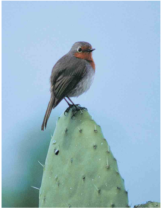
165 Tenerife Robin / Teneriferoodborst Erithacus superbus on Opuntia cactus, Tenerife, Canary Islands, February 1998 (Hans-Heiner Bergmann)

( n=91 ), constituting a highly significant difference. High-pitched elements of just less than 8 kHz occur more frequent in superbus than in rubecula . In superbus , the strophe usually begins with one or two short very high notes followed by a lower motif, which is usually repeated a number of times, or a trill, or a combination of these. In rubecula , the contrast between high and low material is also a striking feature of the song, but the general pattern of high units near the start, followed by lower material is more often than not repeated in the course of the much longer strophe, so that there is often a return to high units in the middle of the strophe (Magnus Robb in litt) It is unknown whether female superbus sings. Female rubecula does so, at least during territory establishment in autumn (Lack 1939, Hoelzel 1986).