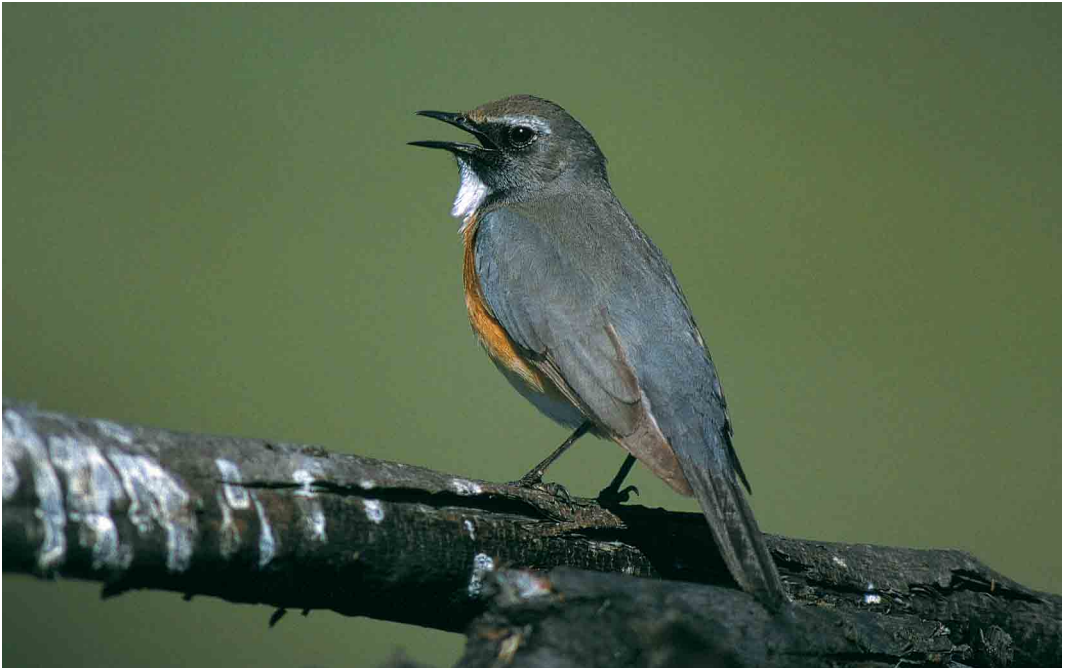
187 White-throated Robin / Perzische Roodborst Irania gutturalis , male, Lesbos, Greece, 11 May 2001

at Khor Kalba on 27 March. On 22 March, an adult Lesser Crested Tern S bengalensis wearing an Italian ring was seen at Viareggio, Toscana, Italy. On Lesbos, one was seen on 4-6 May. If accepted, an adult Roseate Tern reported here on 23 March will be the fourth for Italy. In Israel, up to four White-cheeked Terns S repressa were seen at North Beach, Eilat, between 3 April and 6 May.