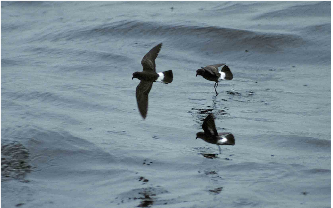
146 European Storm-petrels / Stormvogeltjes Hydrobates pelagicus , off south-western Ireland, August 1985