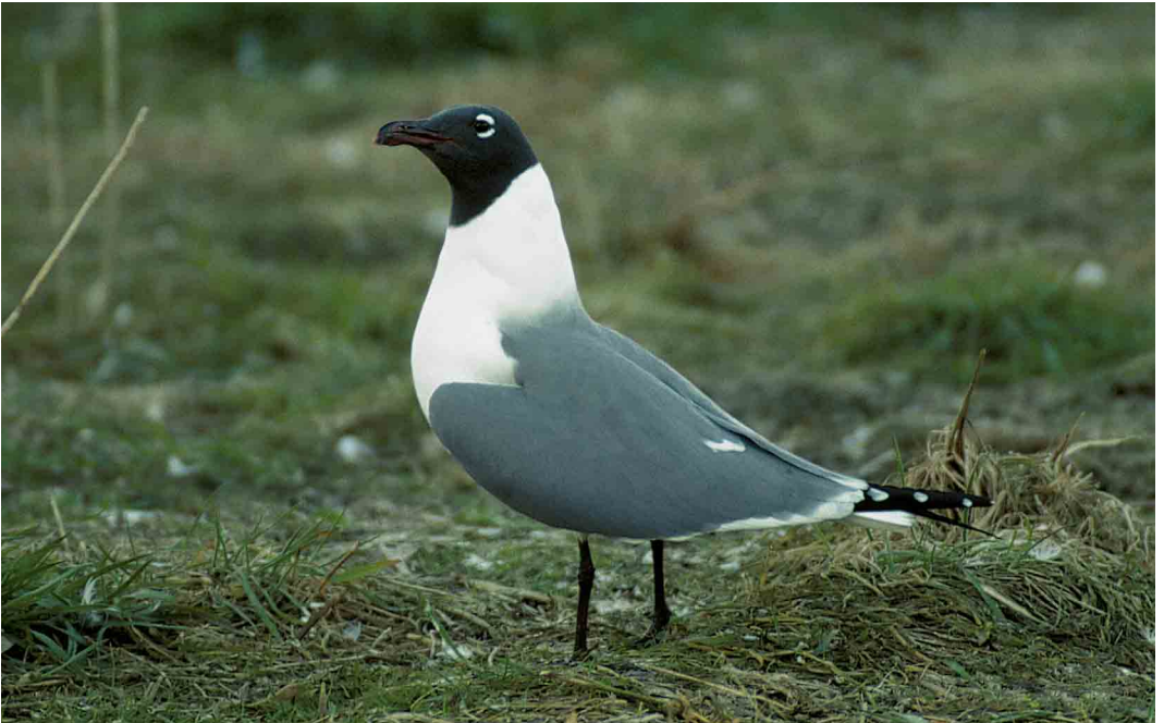
184 Laughing Gull / Lachmeeuw Larus atricilla , Zwillbrocker Venn, Nordrhein-Westfalen, Germany, 11 April 2001