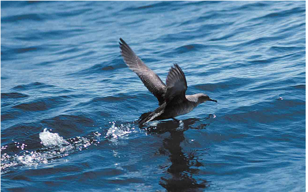
153 Balearic Shearwater / Vale Pijlstormvogel Puffinus mauretanicus , Catalunya, Spain, April 1996