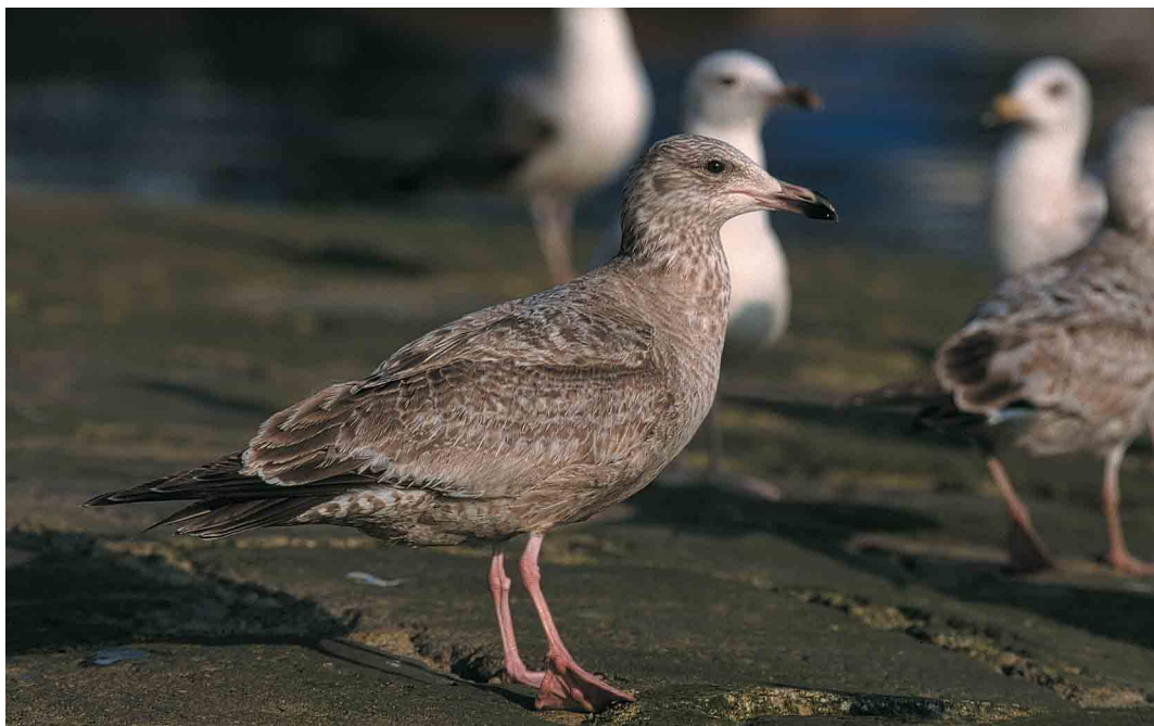
186 American Herring Gull / Amerikaanse Zilvermeeuw Larus smithsonianus , juvenile, Matosinhos, Portugal, 1 April 2001 (Visa Rauste)