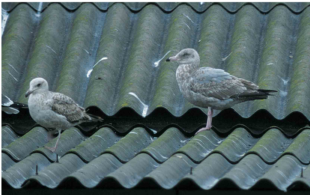
185 American Herring Gull / Amerikaanse Zilvermeeuw Larus smithsonianus , second-winter, Douro river, Portugal, 30 March 2001