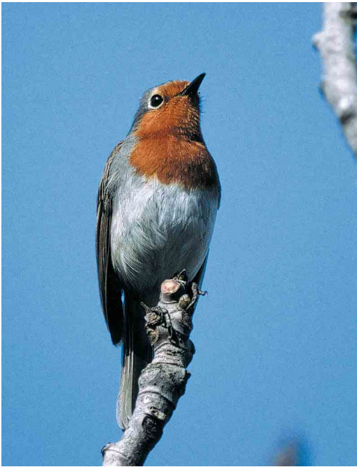
164 Tenerife Robin / Teneriferoodborst Erithacus superbus on its song post, Tenerife, Canary Islands, February 1987