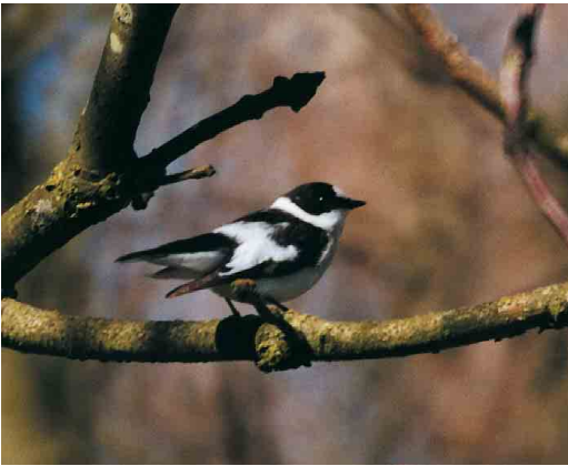
196 Withalsvliegenvanger / Collared Flycatcher Ficedula albicollis , eerste-zomer mannetje, Lies, Terschelling, Friesland, 6 mei 2001 (Johan van der Louw)

is het van belang om verdacht te zijn op hybriden met Bonte Vliegenvanger F hypoleuca (die zich bijvoorbeeld 'verraden' door een onderbroken halsband en een minder duidelijke stuitvlek) en Bonte Vliegenvangers van de ondersoorten F h iberiae en F h speculigera uit respectievelijk Centraal-Spanje en Noordwest-Afrika die in veel kenmerken meer overkomt vertonen met Withalsvliegenvanger dan met Bonte. Zo hebben deze ondersoorten – misschien gaat het ook wel om een aparte soort – een grote witte handpenvlek, een grote witte voorhoofdsvlek, een lichtere stuitvlek en soms een vrijwel volledige witte halsband! De vogel van Terschelling vertoonde – net als die van Vlieland, Friesland, in mei 1996 – enig wit op de buitenste staartpen. Meestal is de staart bij Withalsvliegenvanger helemaal zwart, terwijl Bonte en met name Balkanvliegenvanger F semitorquata (veel) meer wit in de buitenste staartpen(nen) vertonen. Enig wit op de buitenvlag van de buitenste staartpen of zelfs op meer penen is echter bij Withalsvliegenvanger niet ongebruikelijk.