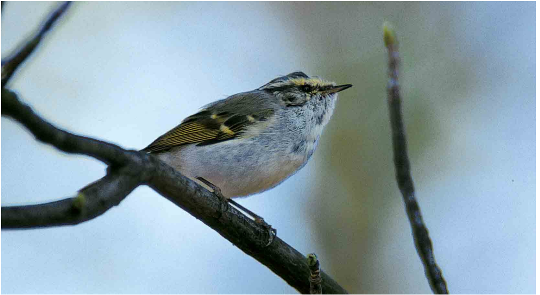
194 Pallas' Boszanger / Pallas's Leaf Warbler Phylloscopus proregulus , Vlaardingen, Zuid-Holland, 2 april 2001 (Marten van Dijk)