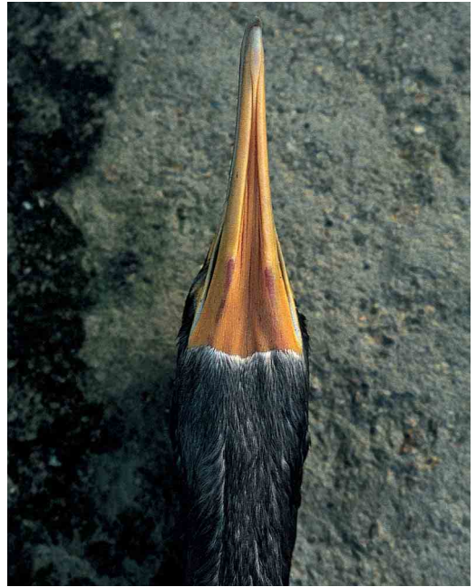
160-161 Double-crested Cormorant / Geoorde Aalscholver Hypoleucos auritus , Ouessant, Finistère, France, 8 October 2000 (Alain De Broyer)

of many ecosystems, especially that of the Great Lakes. Today, the population is at historic highs, in large part due to the presence of ample food in their summer and winter ranges, federal and state protection, and reduced contaminant levels. The Interior population of Cormorants, which includes the Great Lakes region, is the fastest growing of the six major North American cormorant breeding populations. During 1970-91, in the Great Lake region of the USA and Canada, the number of Double-crested Cormorant nests increased from 89 to 38 000, an average annual increase of 29%. For the contiguous USA as a whole, the breeding population increased at an average rate of 6.1% per year during 1966-94, and now stands at c 372 000 breeding pairs. Using estimates of one to four non-breeding birds per breeding pair yields an estimated total population of between one and two million birds (cf Katzenberger & Tollefson 1999).