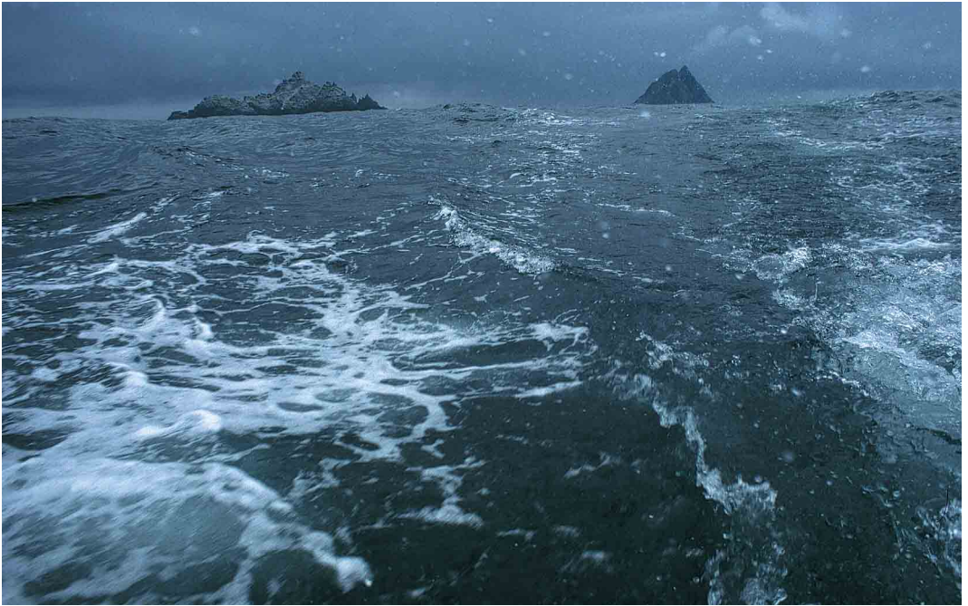
158 Skellig Islands, Kerry, Ireland. Located 10 km offshore, both islands have impressive concentrations of seabirds. Boat trips are available to Great Skellig (right) and both Manx Shearwaters Puffinus puffinus and European Storm-petrels Hydrobates pelagicus are reliably seen during the crossing

possible) and the Great Skellig (Skellig Michael) has splendid monastic ruins and many breeding Atlantic Puffins Fratercula arctica and other very approachable seabirds. European Storm-petrels breed abundantly but only come ashore at night – after the day trips leave! Numerous boat trips cross from seaside villages on the Kerry coast and European Storm-petrels can be seen en route to the islands between May and late August. It is possible to book a boat trip on the internet (using ‘skelligs boat trips’ as a word search).