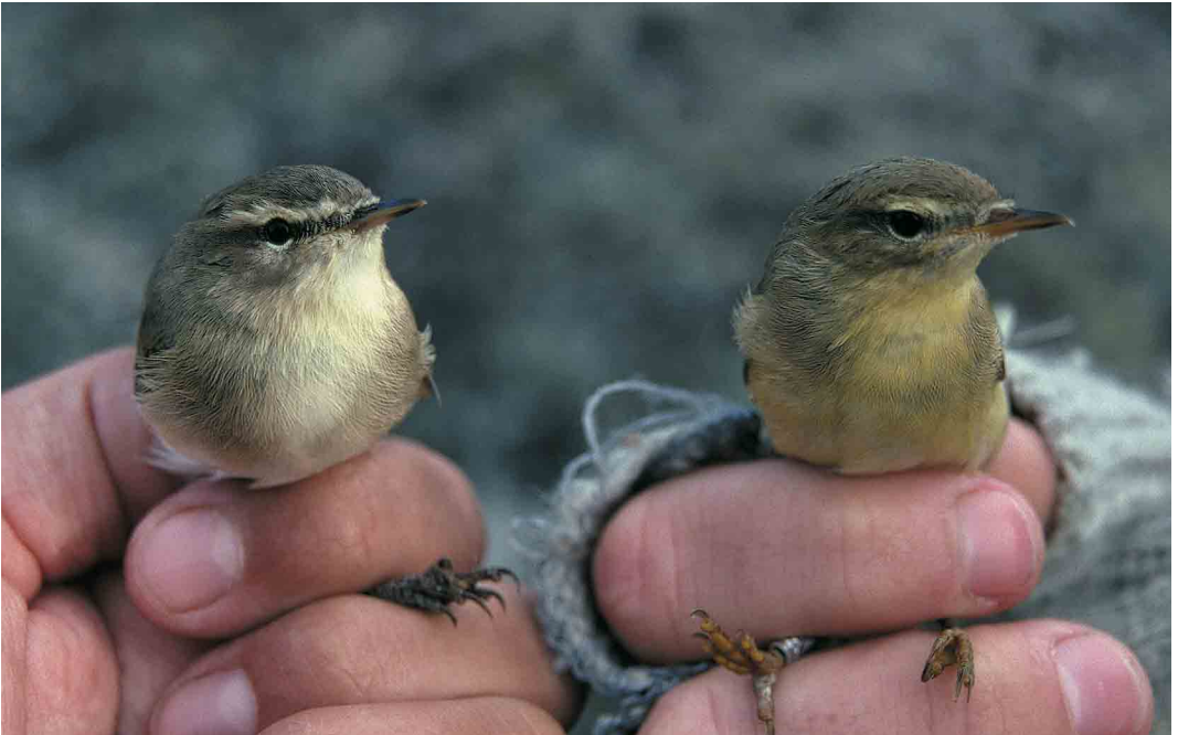
Mystery birds V (left) and VI (right) (September)

Taking all these (very subtle) features of the mystery bird into consideration, the balance tips in favour of Western Black-eared Wheatear. Fortunately, this identification is confirmed by the location of the bird, as it was photographed in the Algarve, Portugal, on 2 June 1998 by Ray Tipper. Another photograph of the same bird