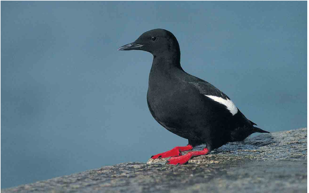
152 Black Guillemot / Zwarte Zeekoet Cephus grylle , Bangor, Down, Northern Ireland, June 1982 (Anthony McGeehan)