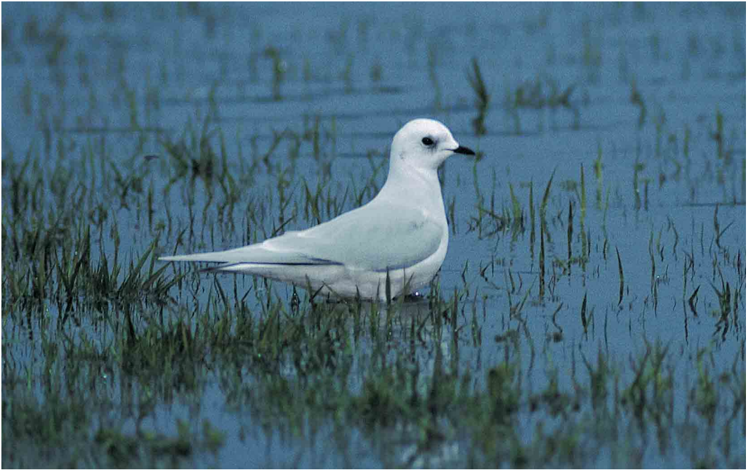
172 Ross's Gull / Ross' Meeuw Rhodostethia rosea , adult, Leuchtenbuch, Bayern, Germany, 27 March 2001