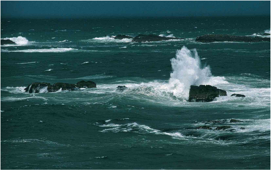
151 Ideal seawatching weather – squally showers and blustery onshore winds – at Ramore Head, Antrim, Northern Ireland, September 1992

Once you know the species, it can be surprisingly straightforward to identify. Unlike European Storm-petrel and Leach's Storm-petrel, Wilson's usually fly strongly and glide with a fixed-wing, level flight-path even in strong winds. When they pause to foot-patter, they use a remarkably vigorous 'puppet on a string' action with long legs kicking off the sea surface and making the bird almost bounce.