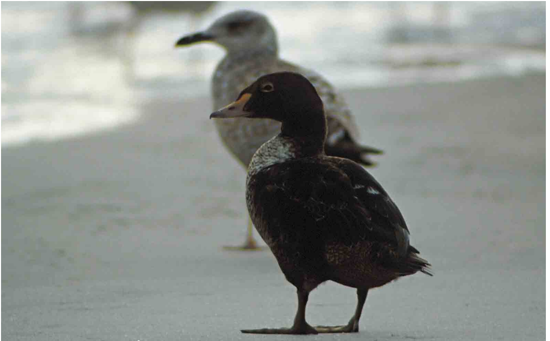
173 King Eider / Koningseider Somateria spectabilis , second-year male, Laxe, A Coruña, Galicia, Spain, 22 December 2000