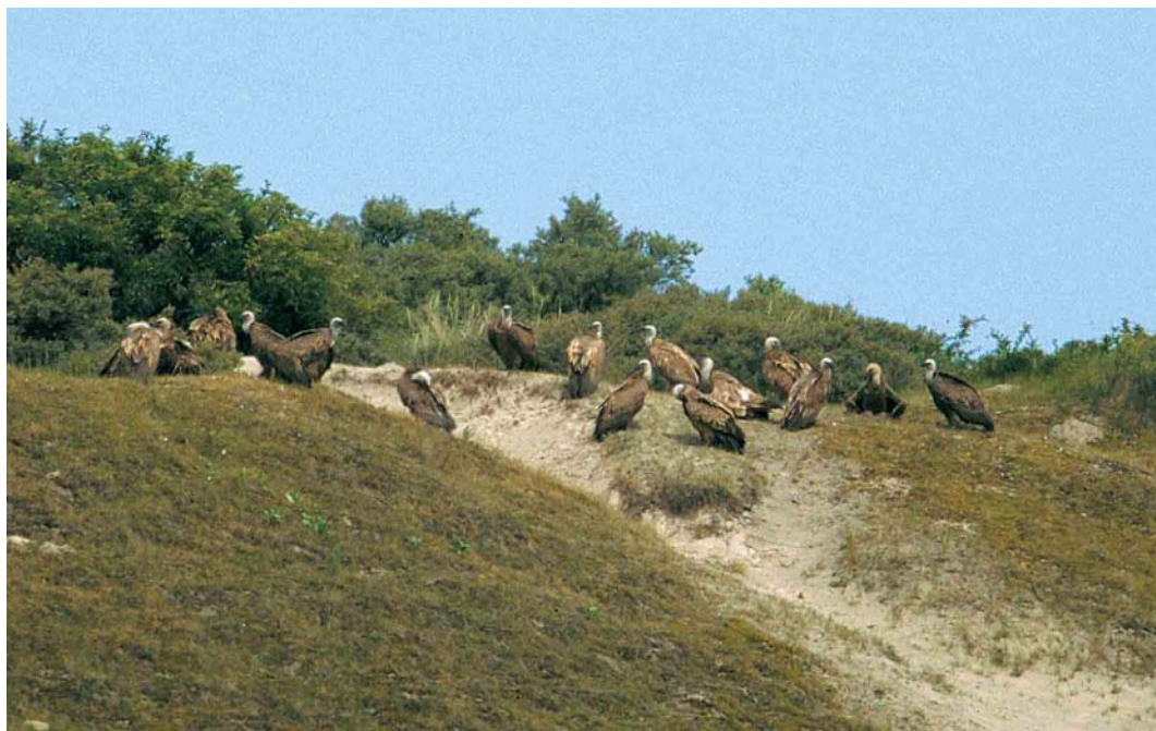
339 Eurasian Griffon Vultures / Vale Gieren Gyps fulvus , Westenschouwen, Zeeland, Netherlands, 6 July 2001 (Arie Ouwerkerk)