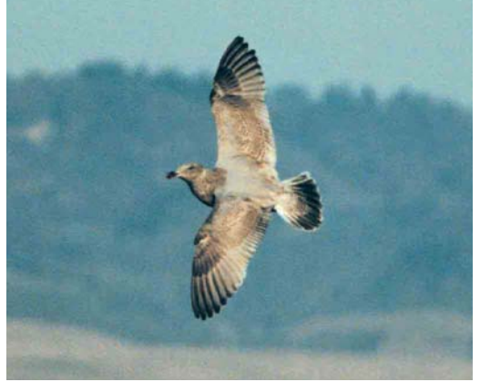
315 Hybrid Glaucous-winged x Western Gull / Beringmeeuw x Californische Meeuw Larus glaucescens x occidentalis , second calendar-year, Point Reyes, Marin County, California, USA, 12 November 1996 (Jon R King). Most of plumage is closer to Western Gull but note pale mantle and scapulars more close to Glaucous-winged Gull

Overall, juvenile Glaucous-winged Gull resembles juvenile Thayer's Gull but most are easily distinguished by obvious differences in size and structure. Thayer's is smaller and neater,