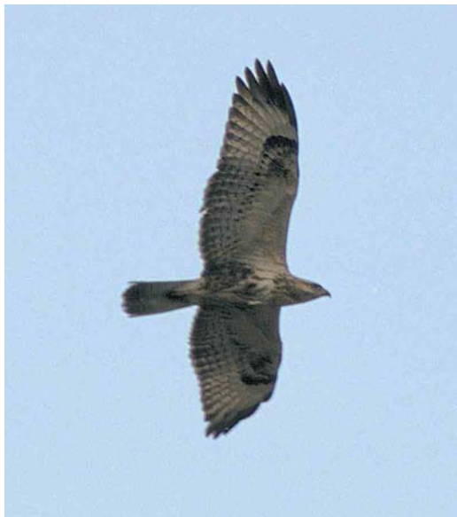
331 Arendbuizerd / Long-legged Buzzard Buteo rufinus rufinus , juveniel, Praamweg, Flevoland, 9 september 2000

Op donderdag 7 september gingen we wederom terug want door de gidsen groeide de onrust; op de achterkop hadden we namelijk een donker vlekje ontdekt dat in Jonsson (1997) niet wordt beschreven maar wél wordt getekend bij Arendbuizerd. Bij het vertrouwde veld vonden we al snel de inmiddels tot 'vermoedelijke Arendbuizerd' gepromoveerde vogel terug. Hij zat nu fraai belicht, rustig speurend naar voedsel, soms de nek wat rekkend en met een paar krachtige stappen een donkere prooi (muis of mol?) verschalkend. We konden de vogel vervolgens ongeveer een uur lang op c 70 m afstand met onze telescopen bestuderen bij vrijwel windstil weer en maakten een zo compleet mogelijke veldbeschrijving. Onze conclusie was nu dat het zeker een onvolwassen Arendbuizerd betrof. Onder de indruk en best opgewonden haastten we ons om de waarneming per gsm in te spreken op de Dutch Birding-vogellijn, waarna we onze vogelreis volgens schema vervolgden naar Gaasterland in Friesland. In de avond werden we door de beheerder van de vogellijn, Klaas Haas, gebeld voor nadere informatie en vatten we de genoteerde kenmerken kort samen.