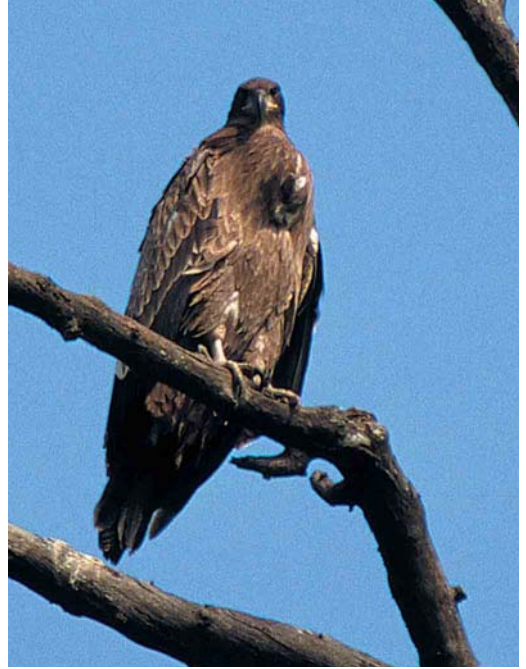
Mystery photograph X (April)

Birding 23: 36, 2001) carefully and identify the birds in the photographs. Solutions can be sent in three different ways: