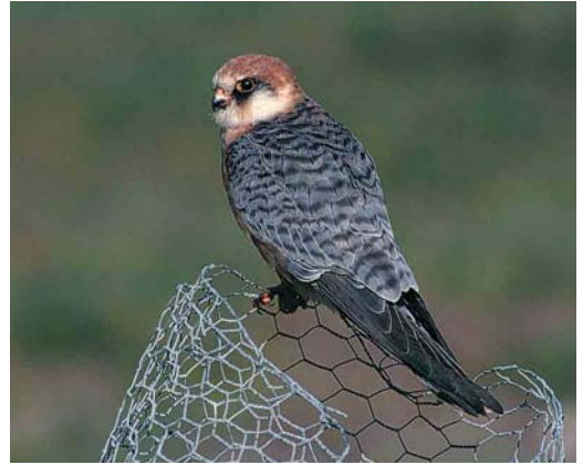
109 Red-footed Falcon / Roodpootvalk Falco vespertinus , first-summer female, Lesbos, Greece, 8 May 2000 (Peter de Knijff). Aged as first-summer by old and worn primaries and tertiaries, which are retained juvenile feathers. Dark streaking on crown and nape also indicative of this age 110 Red-footed Falcon / Roodpootvalk Falco vespertinus , adult female, Lesbos, Greece, 8 May 2000 (Peter de Knijff)