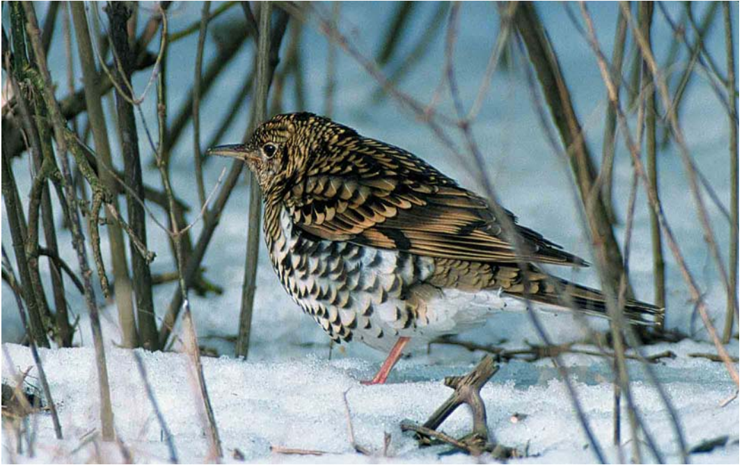
121 White's Thrush / Goudlijster Zoothera aurea , Skårup, Thisted, Nordjylland, Denmark, 6 March 2001 122 White's Thrush / Goudlijster Zoothera aurea , Skårup, Thisted, Nordjylland, Denmark, 5 March 2001. Aged as first-winter by outermost retained juvenile greater covert which is more rusty tinged than renewed other greater coverts