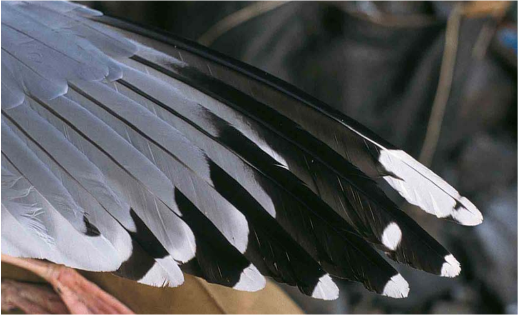
97 Mongolian Gull / Mongoolse Meeuw Larus (cachinnans) mongolicus , adult, upperwing, Lake Baikal, Siberia, Russia, June 1992. Less common wing-tip pattern. Note incomplete subterminal black bar on p10