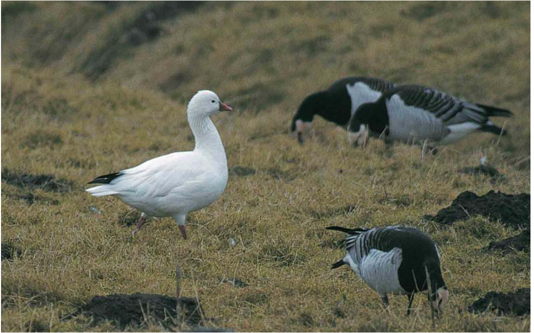
126 Ross' Gans / Ross's Goose Anser rossii , met Brandganzen / Barnacle Geese Branta leucopsis , Nieuwendijk, Zuid-Holland, 14 januari 2001