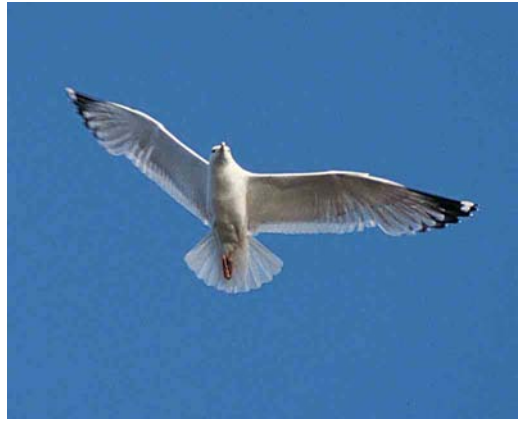
89-91 Mongolian Gull / Mongoolse Meeuw Larus (cachinnans) mongolicus , adult, Lake Baikal, Siberia, Russia, June 1992 ( Pierre Yésou ). Note distinct white trailing edge to wing 92 Mongolian Gull / Mongoolse Meeuw Larus (cachinnans) mongolicus , adult, Lake Baikal, Siberia, Russia, June 1992 ( Pierre Yésou ). Note contrast between pale grey coverts, darker grey band formed by bases of remiges and white (almost translucent) trailing edge to wing

of vegae and birds of Taimyr, mongolicus only shows poorly developed dark streaks on the head after the post-breeding moult (Dement'ev 1951). Birds still present at Lake Baikal in November show a virtually all-white head and neck (Sergey Pyzhianov pers comm).