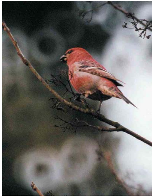
123 Northern Hawk Owl / Sperweruil Surnia ulula , Kallstorp, Skåne, Sweden, 17 February 2001 124 Pine Grosbeak / Haakbek Pinicola enucleator , adult male, Nyholla, Skåne, Sweden, January 2001 125 Pine Grosbeak / Haakbek Pinicola enucleator , probably first-winter male, Espoo, Helsinki, Finland, 12 February 2001. Narrow white fringes on just visible greater coverts indicate first-winter (white fringes are broader in adult); orange on head and breast indicates first-winter male