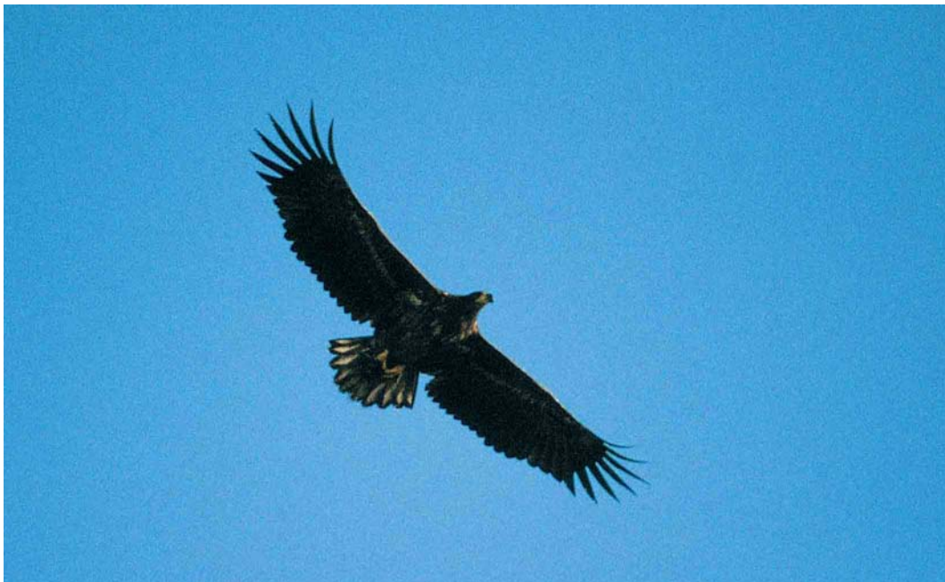
130 Zeearend / White-tailed Eagle Haliaeetus albicilla , juveniel, Goudplaat, Noord-Beveland, Zeeland, 13 januari 2001 (Corstiaan Beeke)