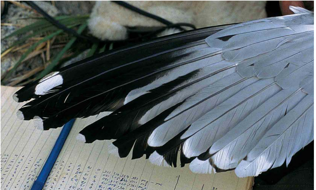
98 Mongolian Gull / Mongoolse Meeuw Larus (cachinnans) mongolicus , (sub)adult, upperwing, Lake Baikal, Siberia, Russia, June 1992. Wing-tip pattern shown by a minority of birds. White mirror on p9 is missing. Note black markings on outer greater coverts in this otherwise fully adult-plumaged breeding bird