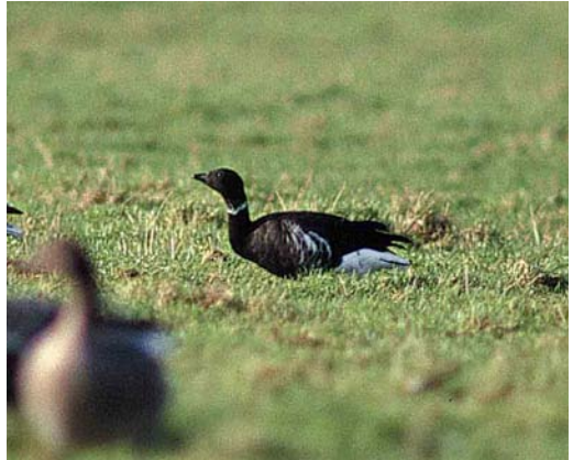
140 Zwarte Rotgans / Black Brant Branta nigricans , Uitkerkse Polders, West-Vlaanderen, 26 november 2000 cf Dutch Birding 23: 57, 2001

eik, Limburg; Roisin, Hainaut (twee); Roksem (drie); Wetteren, Oost-Vlaanderen; en Zingem. Vanaf half februari werd er trek vastgesteld maar verschillende van de Oostvlaamse waarnemingen hebben betrekking op hetzelfde exemplaar. Op 10 februari vloog een Heilige Ibis Threskiornis aegyptius over Wuustwezel, Antwerpen. Een Rode Wouw Milvus milvus vloog op 8 januari over Kruike, Oost-Vlaanderen, en op 18 februari werd er één gezien te Eben, Liège. In januari werd geregeld een juveniele Zeearend Haliaeetus albicilla waargenomen in Het Zwin te Knokke. Er werden Ruigpootbuiszeters Buteo lagopus gezien te Oud-Heverlee, Vlaams-Brabant, op 14 januari en te Tienen, Vlaams-Brabant, op 20 februari. Reeds op 27 februari was er een waarneming van een Visarend Pandion haliaetus te Voeren, Limburg. Een Lannervalk Falco biarmicus van onbekende origine joeg op 14 januari te Poederlee, Antwerpen. Tussen 1 en 8 januari werden in Vlaanderen 83 overvliegende Kraanvogels Grus grus opgemerkt en op 13 januari vlogen er twee over Deerlijk, West-Vlaanderen; op 10 februari trokken er twee over Nivelles, Brabant-Wallon, en op 25 februari één over Galmaarden, Vlaams-Brabant, en zes over Wellen, Limburg. Op 18 januari liepen twee Kleine Strandlopers Calidris minuta in de Achterhaven van Zeebrugge. De eerste Grote Grijs Snip Limnodromus scolopaceus voor België, een adulte in winterkleed, verbleef van 16 tot 18 januari in Het Zwin te Knokke.