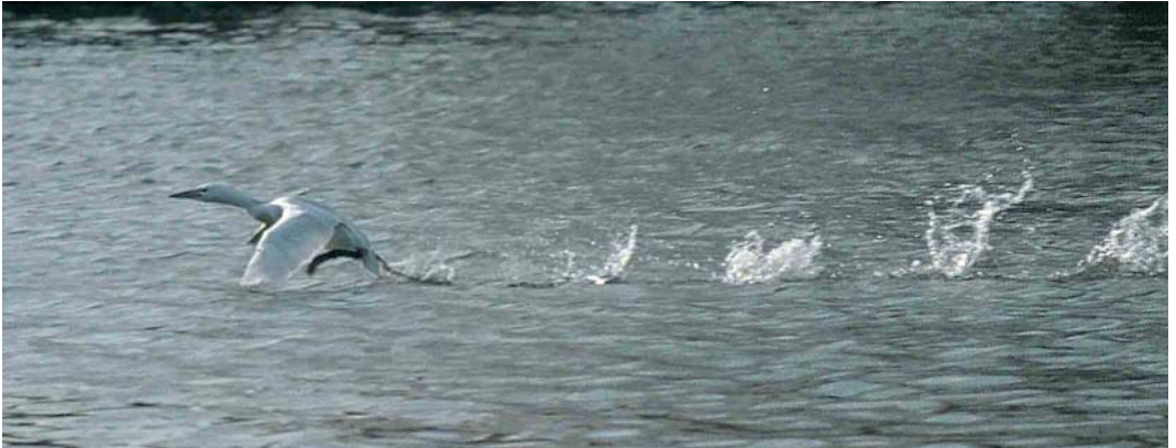
115 Giervalk / Gyr Falcon Falco rusticolus , Ouessant, Finistère, France, 4 March 2001 116 Steppe Grey Shrike / Steppeklapekster Lanius pallidirostris , Penisola Magnisi, Siracusa, Italy, January 2001 117 Probable hybrid Mallard x Red-crested Pochard / vermoedelijke hybride Wilde Eend x Krooneend Anas platyrhynchos x Netta rufina , Huningue, Haut-Rhin, France, 15 January 2001. Note Mallard-like tail with much white; uniform brown head and body with paler head sides and dark-grey bill (but without pink) are reminiscent of Red-crested Pochard 118 Probable Taverner's Canada Goose / vermoedelijke Taverners Canadese Gans Branta hutchinsii taverneri , with Barnacle Geese / Brandganzen B leucopsis , Dunfanaghy, Donegal, Ireland, 25 February 2001 119 Probable Black-throated Loon / vermoedelijke Parelduiker Gavia arctica , albino, Lauffen, Baden-Württemberg, Germany, December 2000