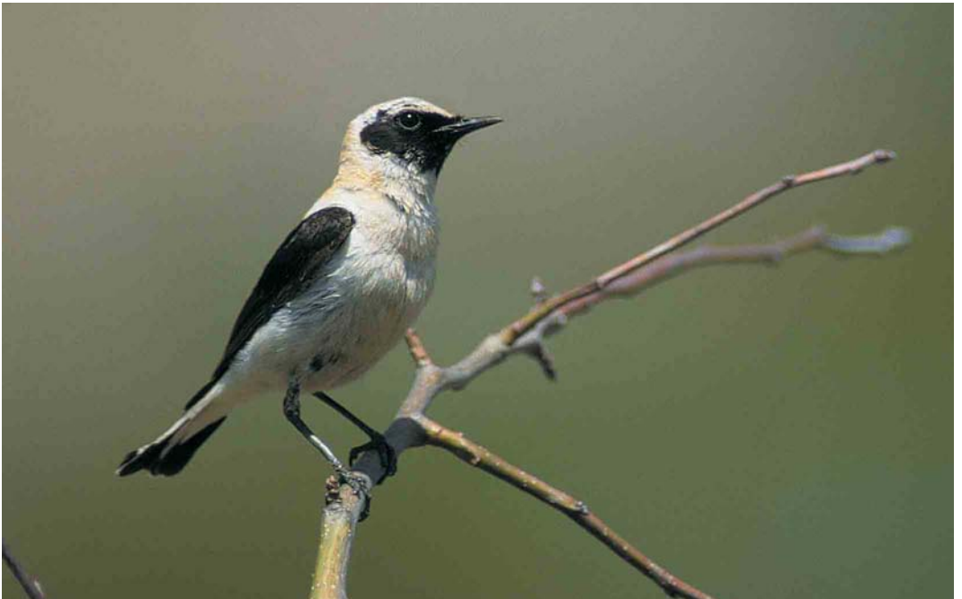
Mystery photograph IV (June)