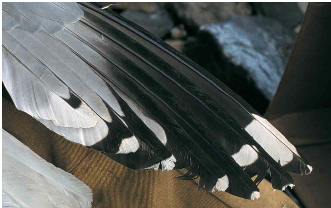
95-96 Mongolian Gull / Mongoolse Meeuw Larus (cachinnans) mongolicus , adult, upperwing, Lake Baikal, Siberia, Russia, June 1992. Typical wing-tip patterns. Note large white mirror and subterminal black bar (white tip more or less abraded) on p10 and mirror of variable extent on p9