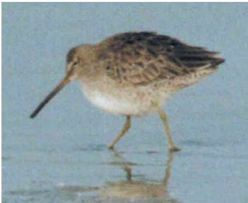
145 Grote Grijze Snip / Long-billed Dowitcher Limnodromus scolopaceus , Het Zwin, Knokke, West-Vlaanderen, 16 januari 2001

LONG-BILLED DOWITCHER From 16 to 18 January 2001, a Long-billed Dowitcher Limnodromus scolopaceus was seen at Het Zwin, West-Vlaanderen, Belgium. This constituted the first record for Belgium. Two earlier Belgian records of dowitchers flying past have only been accepted as unidentified Limnodromus and six other reports (seven individuals) have not been accepted or submitted.