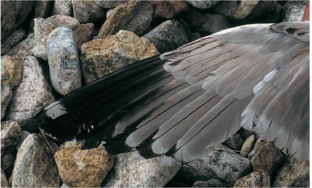
99 Mongolian Gull / Mongoolse Meeuw Larus (cachinnans) mongolicus , (sub)adult, upperwing, Lake Baikal, Siberia, Russia, early June 1992 ( Pierre Yésou ). This bird shows very dark wing-tip pattern, without white mirror on p9, and with many dark markings on outer coverts. Although bird was trapped at nest, its advanced moult stage (growing inner primaries and in particular fresh unmarked outer median coverts contrasting with older, brown-tinged, surrounding feathers) suggests that it has not yet reached fully adult plumage 100 Mongolian Gull / Mongoolse Meeuw Larus (cachinnans) mongolicus , adult, underwing, Lake Baikal, Siberia, Russia, May 1992 ( Pierre Yésou ). Note contrast between mid-grey remiges, paler grey greater and median coverts, and white lesser coverts. Shadow is partly masking pale grey tips to primaries that appear white and translucent when seen from below in flight