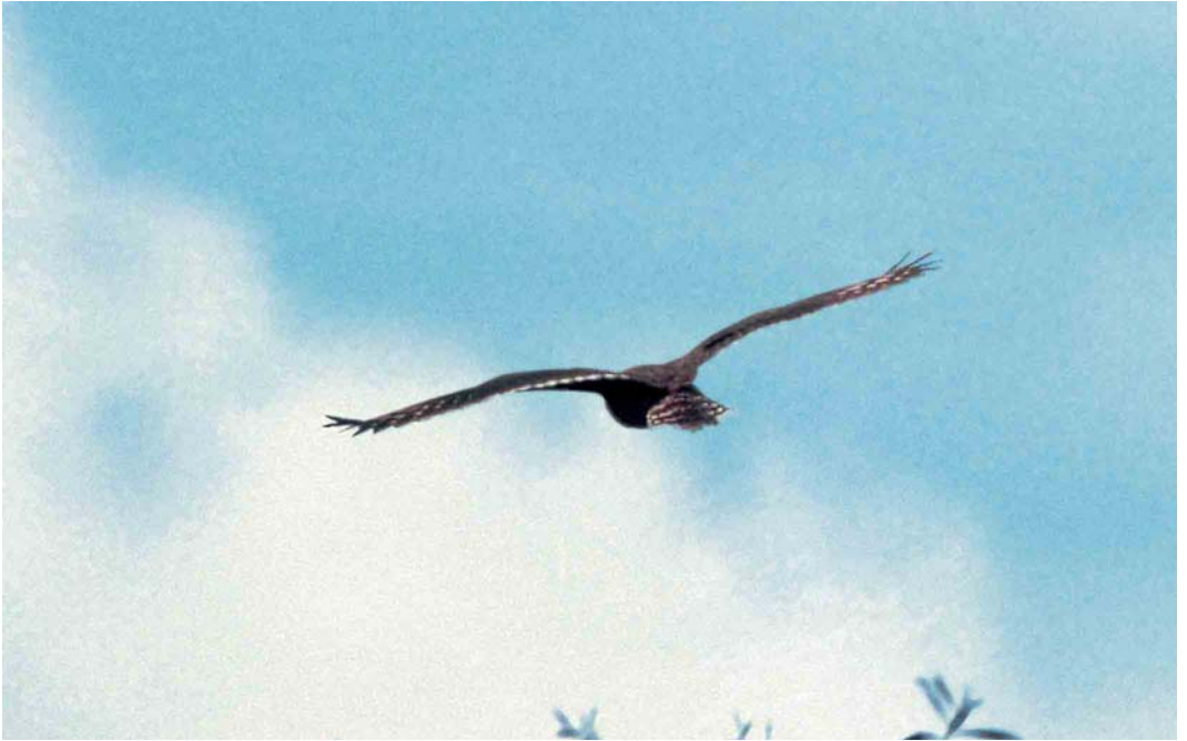
Mystery photograph III (December)