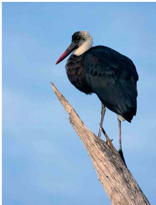
123 Woolly-necked Stork / Bisschopsooievaar Ciconia episcopus, Nazinga Game Ranch, Burkina Faso, 29 May 2000

plain that provides food for a Hippo herd which occupies the lake, sometimes sharing the shores with African Elephants from the nearby Maro Reserve.