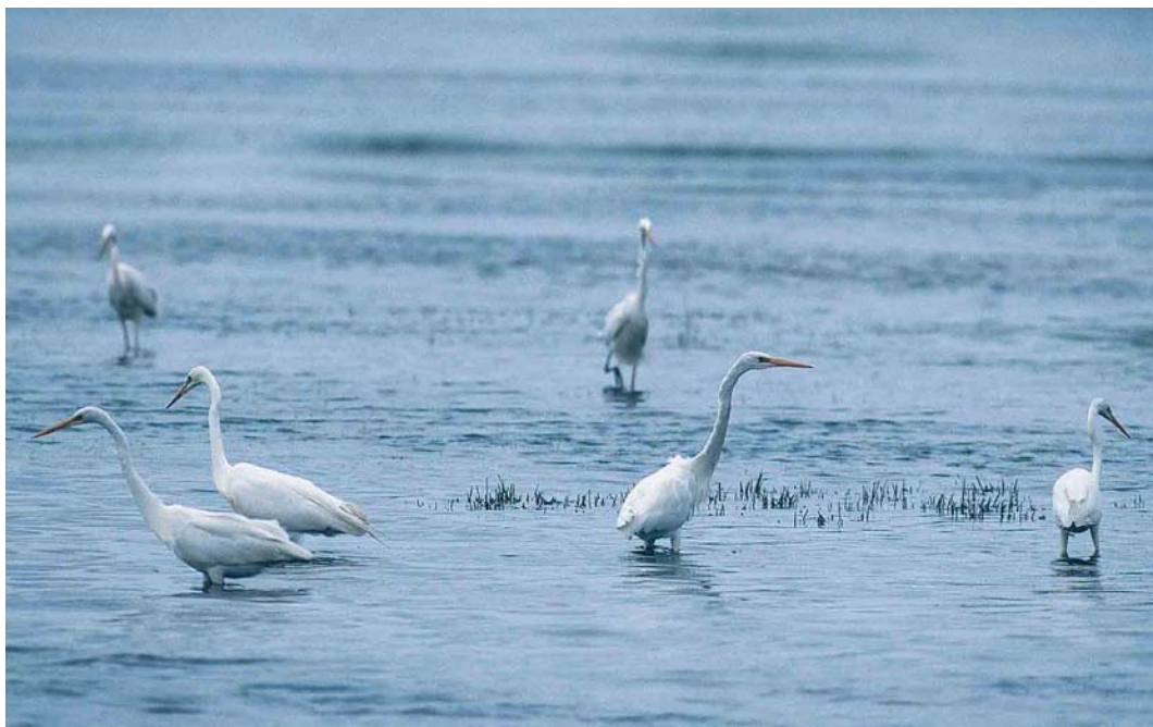
161 Grote Zilverreigers / Great Egrets Casmerodius albus , Veenhuizerstukken, Groningen, 13 maart 2002