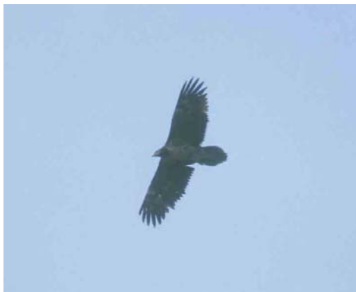
169 Lammergier / Lammergeier Gypaetus barbatus , onvolwassen, Texel, Noord-Holland, 3 juni 2002

Eerdere gevallen van in gevangenschap geboren en