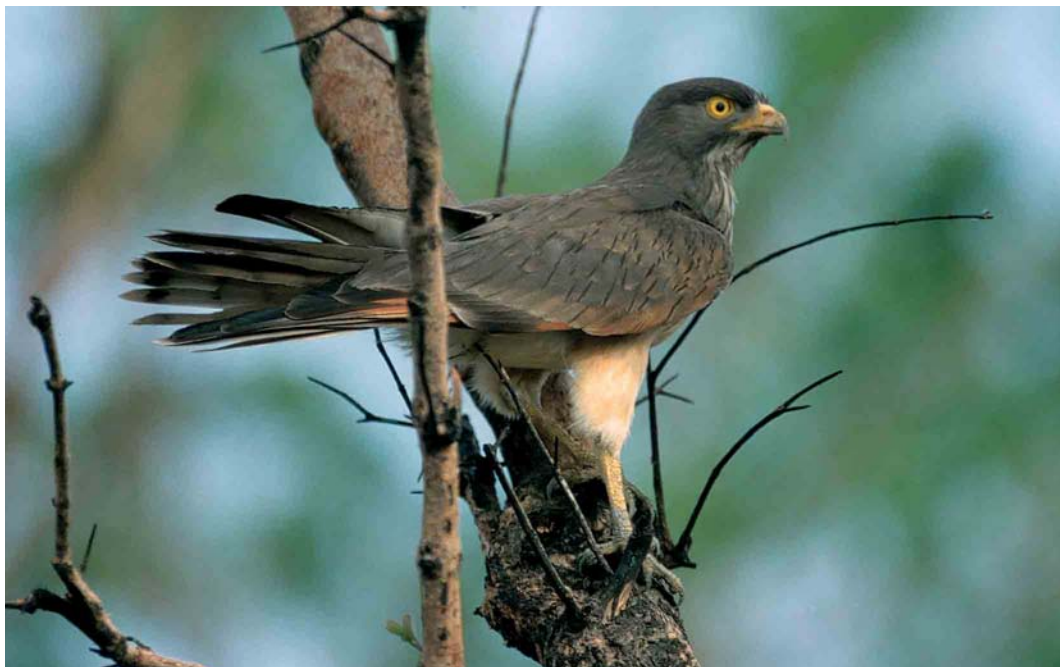
112 Grasshopper Buzzard / Sprinkhaanbuizerd Butastur rufipennis, Gonsé Classified Forest, Burkina Faso, 6 May 2000