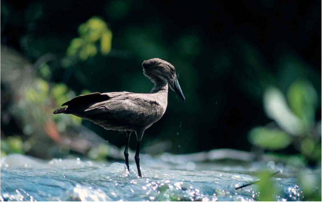
110 Hamerkop / Hamerkop Scopus umbretta, Nazinga Game Ranch, Burkina Faso, 20 November 1999 111 White-backed Night Heron / Witrugkwak Gorsachius leuconotus, juvenile, Nazinga Game Ranch, Burkina Faso, 27 May 2000. One of the potential highlights. This very elusive and nocturnal species was recently discovered in Burkina Faso