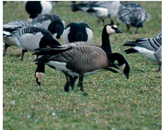
131 Hutchins' Canadese Gans / Hutchins's Canada Goose Branta hutchinsii hutchinsii , met Brandganzen / Barnacle Geese B leucopsis , Bandpolder, Friesland, 25 april 1998 (Roef Mulder) 132 Kleinste Canadese Gans / Cackling Canada Goose Branta hutchinsii minima , met hybride canadse gans x Brandgans / hybrid canada goose x Barnacle Goose B hutchinsii/canadenis x leucopsis en Kolganzen / Greater White-fronted Geese Anser albifrons , Anjummerkolken, Friesland, 13 maart 1998 (Theo Bakker/Cursorius) 133 Kleinste Canadese Gans / Cackling Canada Goose Branta hutchinsii minima , met Brandganzen / Barnacle Geese B leucopsis , Anjummerkolken, Friesland, 9 maart 2000 (Theo Bakker/Cursorius) 134 Kleinste Canadese Gans / Cackling Canada Goose Branta hutchinsii minima , met Brandganzen / Barnacle Geese B leucopsis , Anjummerkolken, Friesland, 2 maart 2000 (Theo Bakker/Cursorius)

pulaties in met name Brittannië en Scandinavië, of van ontsnapte exemplaren. Er werd bovendien nauwelijks opgelet of men te maken had met een taxon van Kleine Canadese Gans (waartoe hutchinsii , leucopareia , minima en taverneri worden gerekend) of Grote Canadese Gans (waartoe canadensis , fulva , interior , maxima , moffitti , occidentalis en parvipes worden gerekend; indeling conform Sangster et al (1999). Deze taxonomische indeling werd recentelijk ondersteund door moleculair onderzoek waaruit bleek dat Kleine Canadese Gans meer verwant is