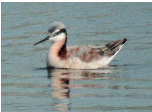
168 Grote Franjepoot / Wilson's Phalarope Phalaropus tricolor , vrouwtje, Bredene, West-Vlaanderen, 24 april 2002 (Koen Verbanck)