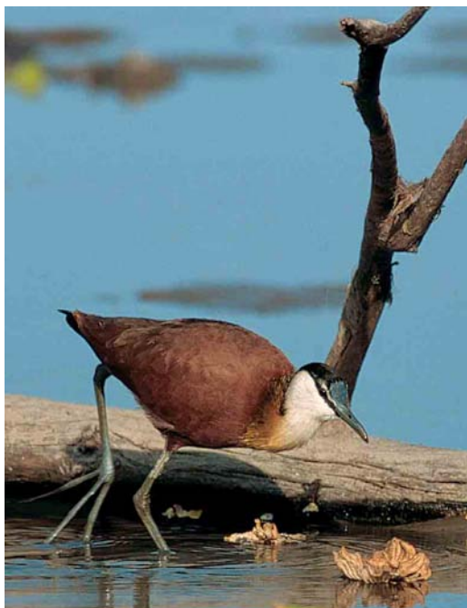
120 African Jacana / Lelieloper Actophilornis africanus, Nazinga Game Ranch, Burkina Faso, 27 November 1999