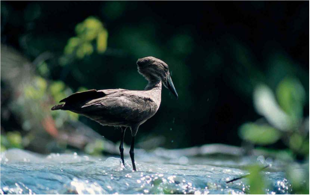
110 Hamerkop / Hamerkop Scopus umbretta, Nazinga Game Ranch, Burkina Faso, 20 November 1999 111 White-backed Night Heron / Witrugkwak Gorsachius leuconotus, juvenile, Nazinga Game Ranch, Burkina Faso, 27 May 2000. One of the potential highlights. This very elusive and nocturnal species was recently discovered in Burkina Faso