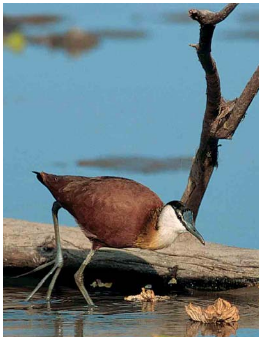
120 African Jacana / Lelieloper Actophilornis africanus, Nazinga Game Ranch, Burkina Faso, 27 November 1999