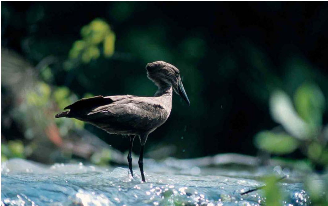
110 Hamerkop / Hamerkop Scopus umbretta, Nazinga Game Ranch, Burkina Faso, 20 November 1999 111 White-backed Night Heron / Witrugkwak Gorsachius leuconotus, juvenile, Nazinga Game Ranch, Burkina Faso, 27 May 2000. One of the potential highlights. This very elusive and nocturnal species was recently discovered in Burkina Faso