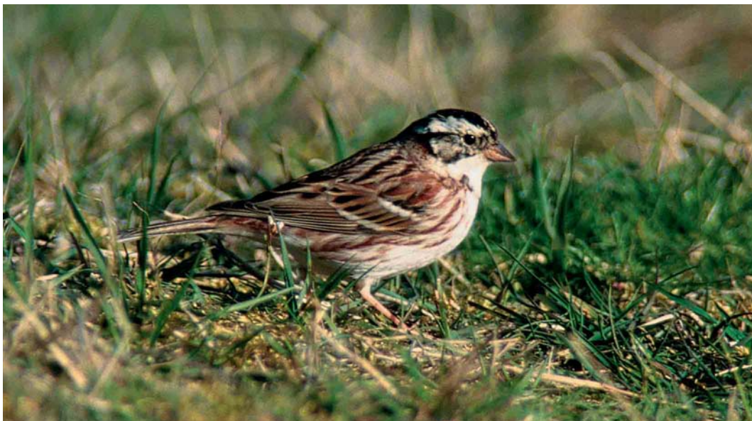
167 Bosgors / Rustic Bunting Emberiza rustica , tweede-kalenderjaar mannetje, De Kennemerduinen, Noord-Holland, 6 april 2002 (Marten van Dijk)

getroffen werd in Bleskensgraaf, Zuid-Holland, was zeker ontsnapt. Op 1 april was een Alpengierzwaluw Apus melba c 30 min ter plaatse boven de Zoute Kwel in de Lauwersmeer, Groningen. Op 27 april vloog een Bijeneter Merops apiaster rond aan bij het Nieuwe Robbengat aan de oostkant van de Lauwersmeer. Hoppen Upupa epops werden ontdekt op 19 april bij het Soerendonks Goor, Noord-Brabant, en op 21 april in langs telpost Parnassia in De Kennemerduinen, Noord-Holland. Een Kortteenleeuwerik Calandrella brachydactyla vloog op 22 april roepend over ten noordoosten van Bergen, Noord-Holland. Een Grote Pieper Anthus richardi was van 10 tot 31 maart (weer) aanwezig op de Maasvlakte, Zuid-Holland. Het aantal van 44 Rouwkwikstaarten Motacilla yarellii op 16 maart bij Rioolwaterzuivering Everstekeoog op Texel is het vermelden waard. Een late Pestvogel Bombycilla garrulus was op 10 maart aanwezig in Heerhugowaard, Noord-Holland. De Waterspreeuwen Cinclus cinclus waren nog aanwezig tot 8 maart in de AW-duinen, Noord-Holland, en tot 9 maart bij de Ketelbrug, Flevoland. Roodborsttapuiten met kenmerken van Aziatische Roodborsttapuit Saxicola maura werden gezien van 25 tot 31 maart op de Brielsegatdam bij Oostvoorne, Zuid-Holland, en op 13 april op de Dwingelose Heide, Drenthe. De Graszanger Cisticola juncidis van het Kennemermeer bij IJmuiden bleef daar in ieder geval tot 2 april. Een andere vloog op 21 april over de Akerdijkse Plassen, Zuid-Holland. Eind april