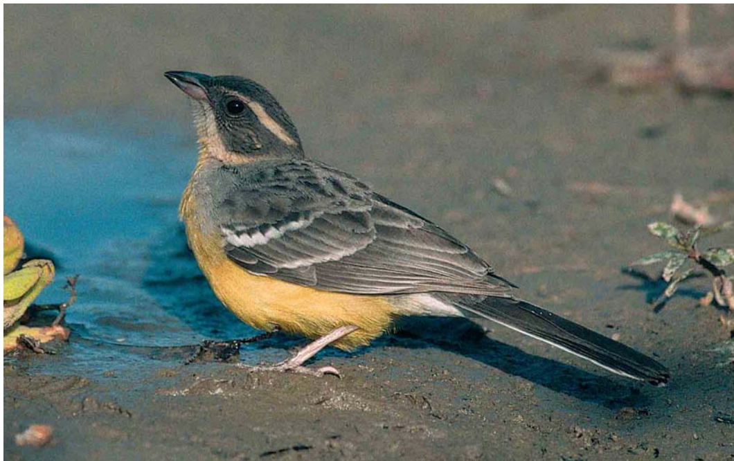
126 Cabanis's Bunting / Cabanis' Gors Emberiza cabanisi , female, Nazinga Game Ranch, Burkina Faso, 12 February 2000